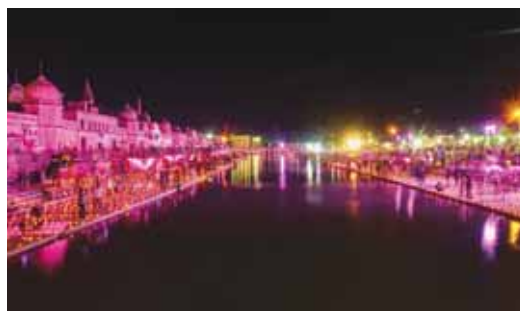
Devotees light lamps on Deepotsav at Ramghat on the eve of bhoomi puja of the Ram Temple in Ayodhya on Tuesday.

There is an air of festivity around Ayodhya. Religious songs or the chanting of Sunderkand wafts through the air as one drives through the