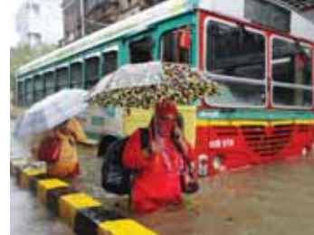
Commuters waded through a waterlogged street during heavy rain in Mumbai on Tuesday.

The India Meteorological Department (IMD) has forecast spells of more heavy to very heavy rainfall in Mumbai and surrounding areas over the