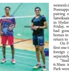
PV Sindhu poses for photograph after resuming practice at Pulla Gopichand Academy in Hyderabad on Friday.

"I am very happy to have our elite shuttlers back for on-field training after this long break. We are fully equipped to resume training in a safe environment," Chief national coach