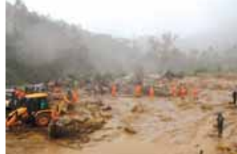
Rescuers work at the site of a mudslide triggered by heavy monsoon rain in Idukki, Kerala on Friday

Cooking utensils buried in mud, asbestos and tin sheets strewn around were all there to be seen at the area, which was the habitation of around 80 odd workers near a tea plantation, about 30 km from the tourist town of Munnar.