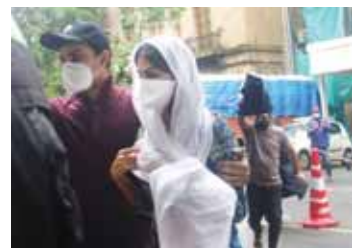
Bollywood actress Rhea Chakraborty arrives at Enforcement Directorate office for questioning in connection with a money laundering case in Mumbai on Friday