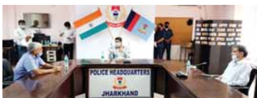
Singh, Ramgarh and Palamu, while two persons from Hazaribag district died today.

The final death toll at per health bulletin stands at 151, while the number of active cases is 8840, at the same time 7491 persons have won the battle against corona after they were discharged from hospital on recovery from infection. The six deaths include one each from Dhanbad, East