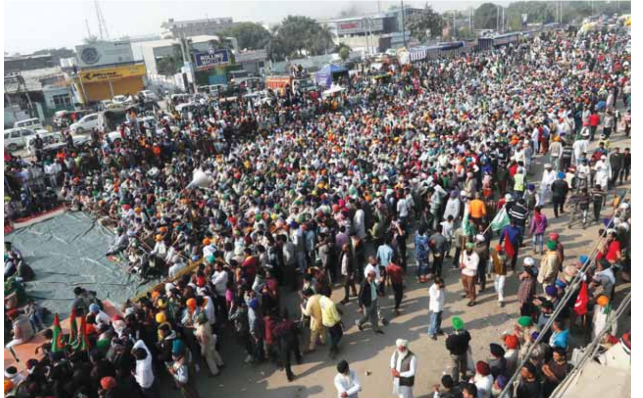
Farmers gather at the Singhu border during their ongoing Delhi Chalo protest against Centre's farm laws in New Delhi on Monday