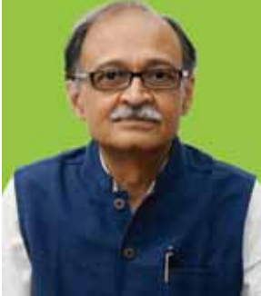
■ NEW DELHI