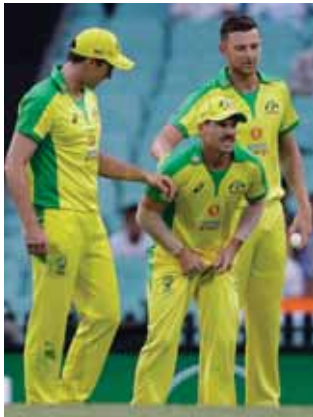
replacement in Australia's white-ball squad.

Left-handed batsman D'Arcy Short, who was the leading run-scorer in two series in the Big Bash League, has been named Warner's