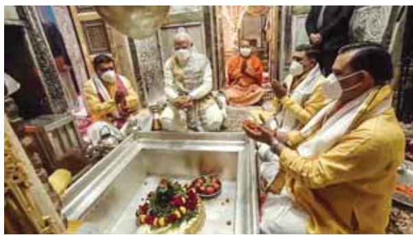
Prime Minister Narendra Modi during his visit to Kashi Vishwanath Mandir in Varanasi on Monday

Addressing a public meeting at Khazuri on the outskirts of Varanasi, his Parliamentary constituency here, on Monday after inaugurating six-lane widening project of about 73-km-long route between Raja