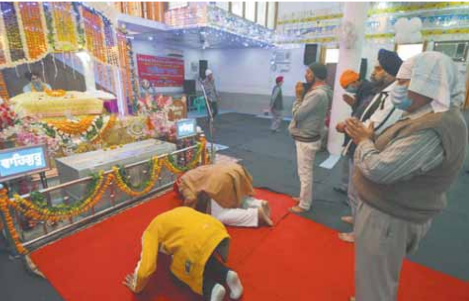
Sikh devotees at Gurdwara Naka Hindola on the occasion of Prakash Parv on Monday

The distribution of langar in the 'samagam' was done by Sikh Young Men's Association and Dashmesh Sewa Society.