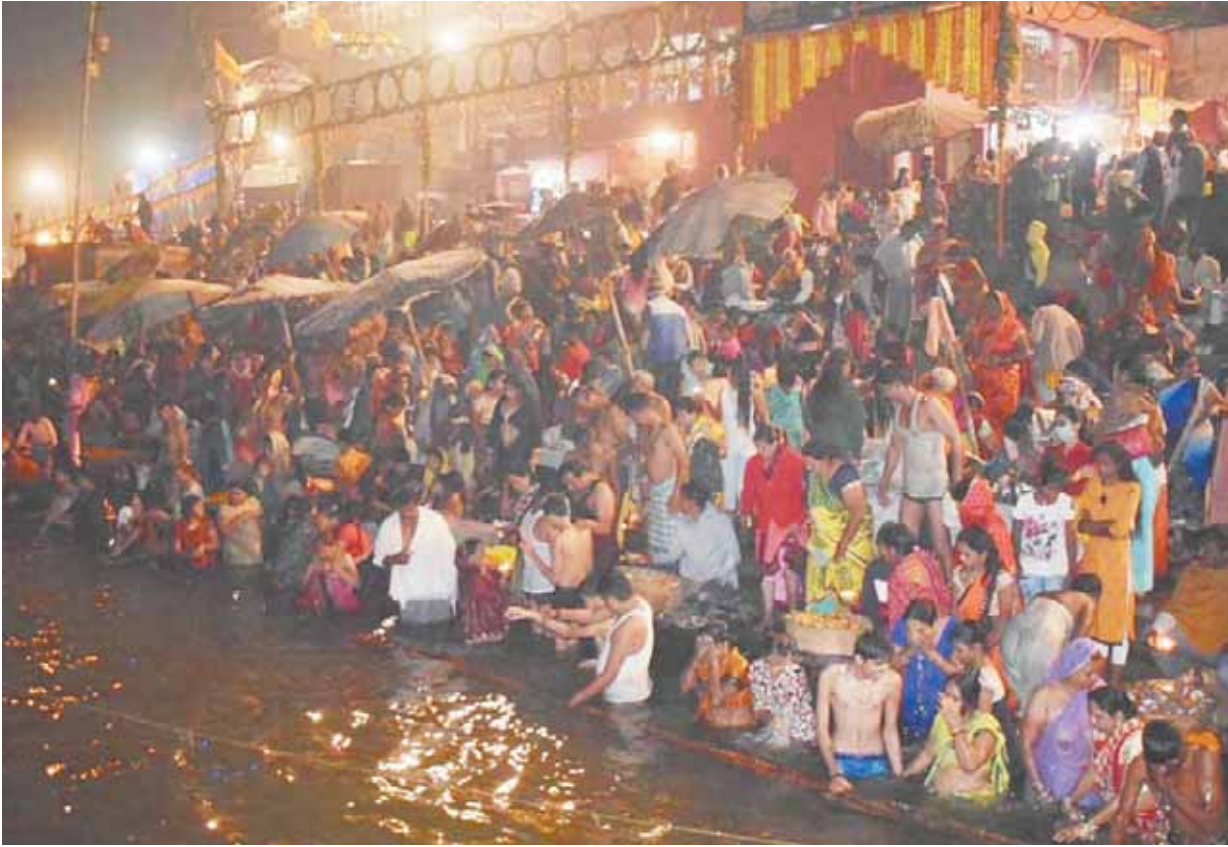
Devotees taking holy dip at river Ganga on the occasion of Kartik Purnima in Varanasi on Monday morning