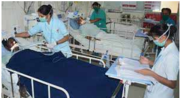
PNS ■ NEW DELHI

With markets buzzing with activity and people throwing caution to wind, the Centre on Monday issued fresh SOPs on preventive measures in market places aiming to check the spread of coronavirus in the country. The Union Health Ministry issued fresh do's and don'ts stating that the markets in containment zones will remain shut until further orders. Civic enforcement agencies will have the discretion to open the market on alternate days in case of surge in infections or if people do not follow anti-Covid norms. "Market places in containment zones shall remain closed. Only those outside containment zones will be allowed to operate," the notification from the Centre stated. According to the new