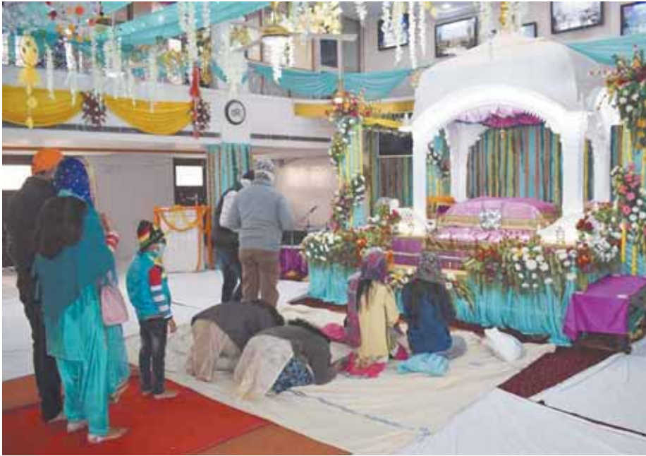
Sikhs offering prayer at Gurubag Gurdwara on Prakashotsav of Guru Nanak Devji in Varanasi on Monday

The city, which is important for the Hindus, Buddhists and Jains, is also important for the Sikhs as it is said that in 1563 Vikram Samvat, Guru Nanak Dev, the first Guru of Sikhs, had arrived in the city along with some of his followers and stayed here for almost one month and during the period he also delivered religious discourses. It was the same place where Guru Nanak Devji Maharaj had delivered his discourses, today Gurubagh Gurdwara is located. Varanasi is also the place