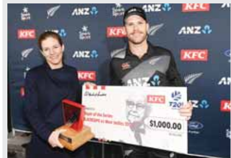
Kiwi pacer Lockie Ferguson poses with Player of the series trophy and pay cheque after end of T20I series between New Zealand and West Indies on Monday