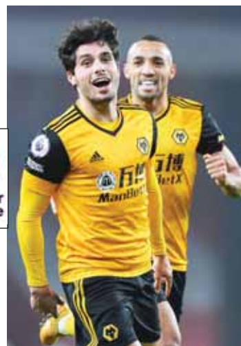
Pedro Neto celebrates after scoring

Willian nearly equalized for Arsenal with a free kick in the 57th, but it rose just over the bar. Rob Holding also had an open header but couldn't connect with a Saka cross.