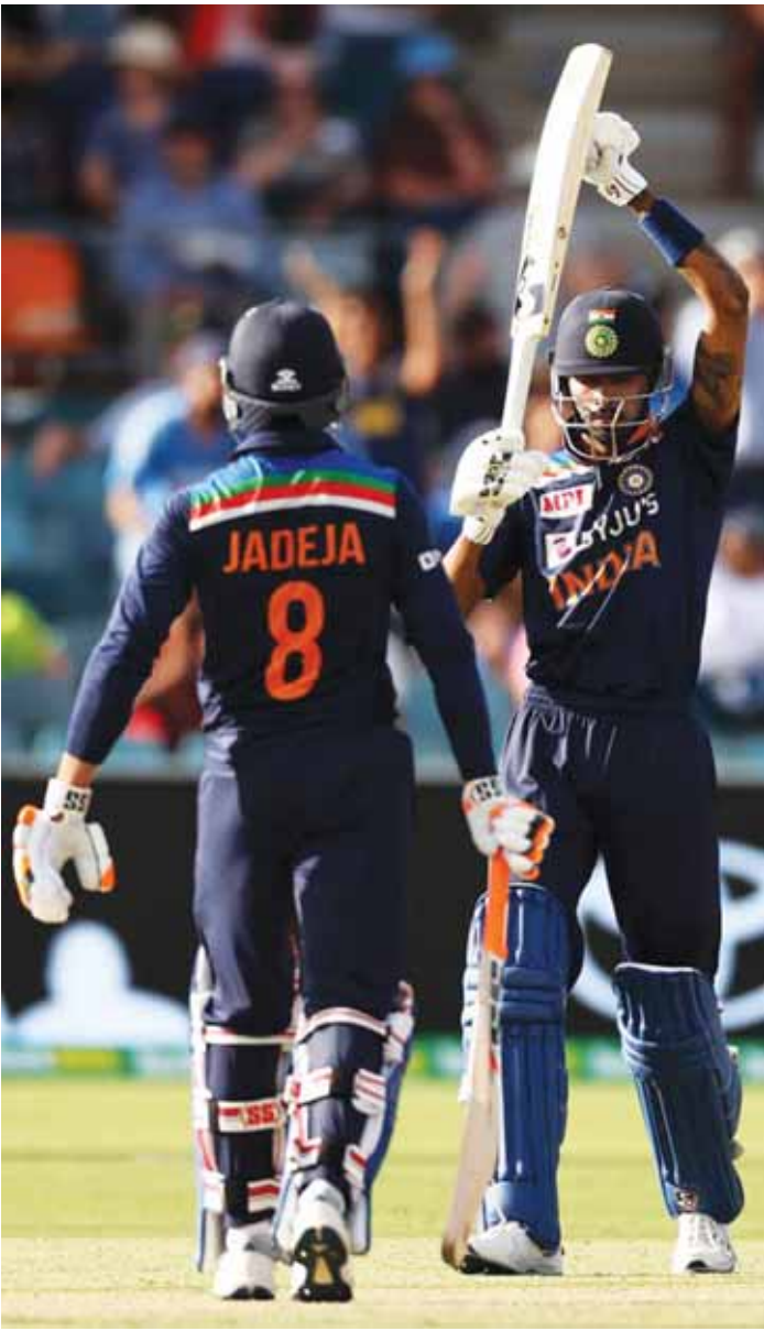
Hardik Pandya raises his bat after completing his fifty during third ODI on Wednesday

Natarajan was very steady in his first spell and got his maiden wicket when Marnus Labuschagne (7), in an unfamiliar role as opener, dragged a wide delivery back onto the stumps.