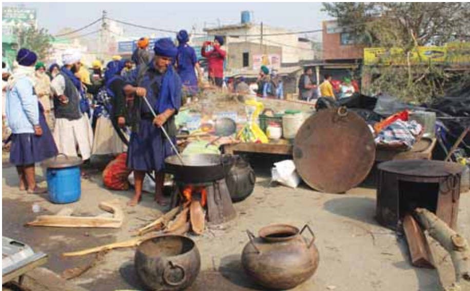
Farmers prepare food for others during their Delhi Chalo protest march against the Centre's new farm laws at Singhu border in New Delhi on Wednesday

The Krantikari Kisan Union president said repre-