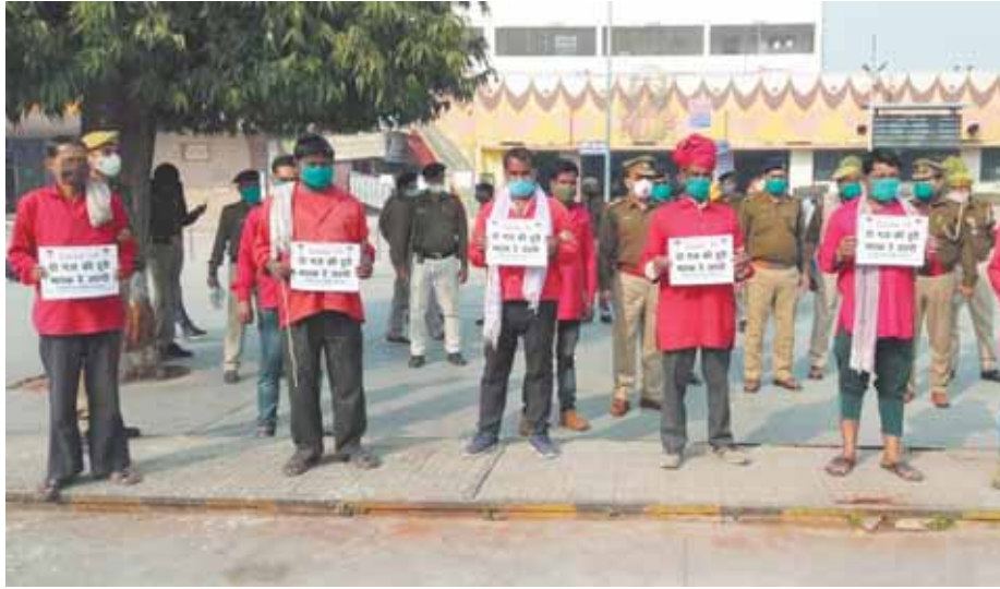
Coolie and GRP personnel spreading awareness about COVID-19 at Prayagraj Jn in Prayagraj

He said that the total number of corona infected in the district has reached 26,685. While the number of infection-free people is 25,536. Covid test was conducted by 5,031 people on