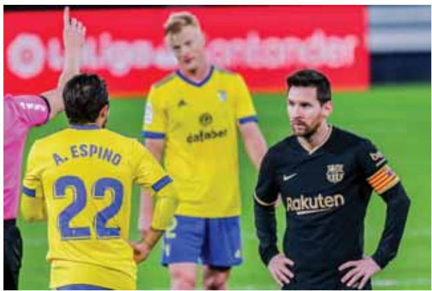
Barca's Lionel Messi reacts during the La Liga match against Cadiz