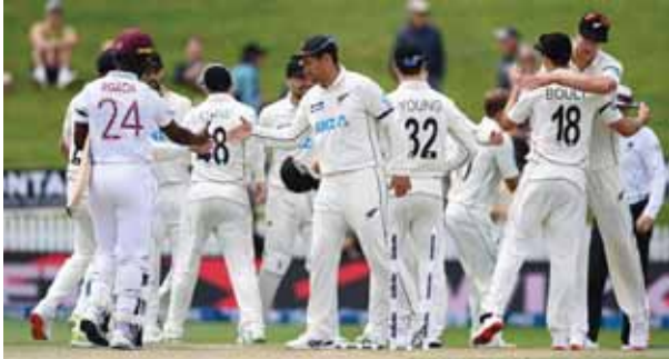
New Zealand's players celebrate their innings and 134 run win over Windies

Pacer Michael Neser (2/51) and Bird (1/34) too bowled well, while skipper Travis Head too picked up two wickets with his off-spin.