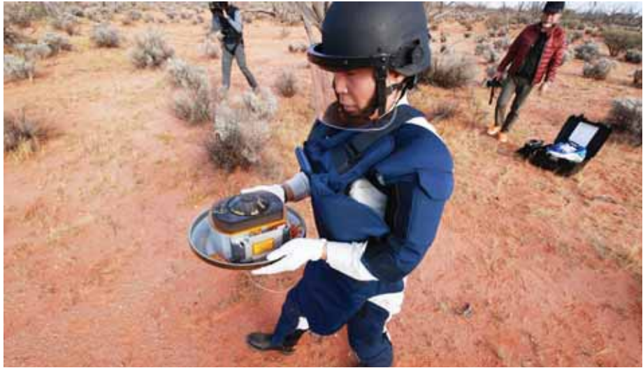
A member of JAXA retrieves a capsule dropped by Hayabusa2 in Woomera, southern Australia on Sunday

“It’s just going to make a burdensome system,” Vigil said, adding, “It is going to hinder bilateral operations, it is going to hinder bilateral exchange of information. This is going to be much more detrimental to Mexico than to the United States.”