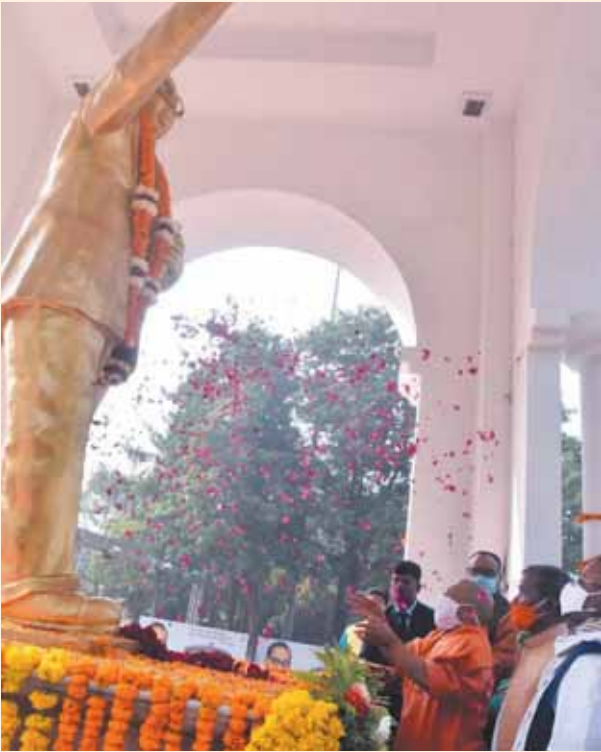
Chief Minister Yogi Adityanath paying floral tributes to Baba Saheb Bhimrao Ambedkar on his 64th Mahaparinirvan Divas in Lucknow on Sunday