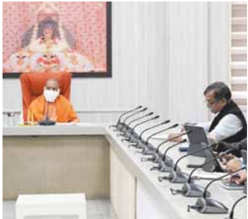
Chief Minister Yogi Adityanath during unlock review meeting at his official residence on Sunday