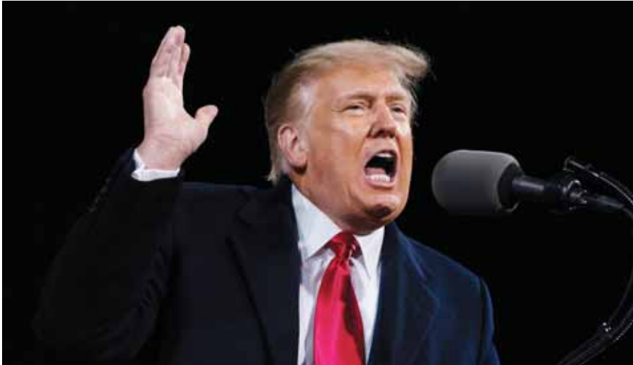
President Donald Trump speaks at a campaign rally for Senate Republican candidates, Sen Kelly Loeffler, R-Ga, and Sen David Perdue, R-Ga, at Valdosta Regional Airport on Saturday

“If I lost, I would be a very gracious loser. If I lost, I would