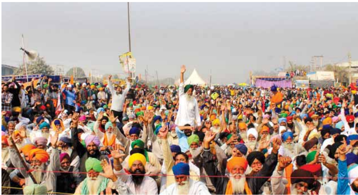
Farmers shout slogans during their Delhi Chalk protest march against the new farm laws at Singhu border