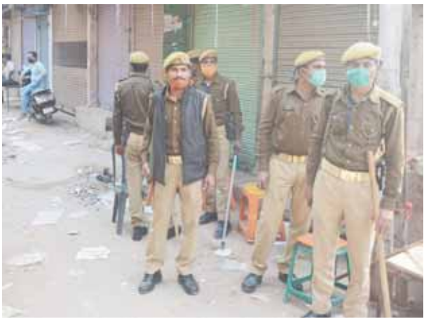
A Muslim-dominated market remains closed on anniversary of December 6 incident in Varanasi on Sunday

Hindu forces have avoided organising any programmes on the day for the last many