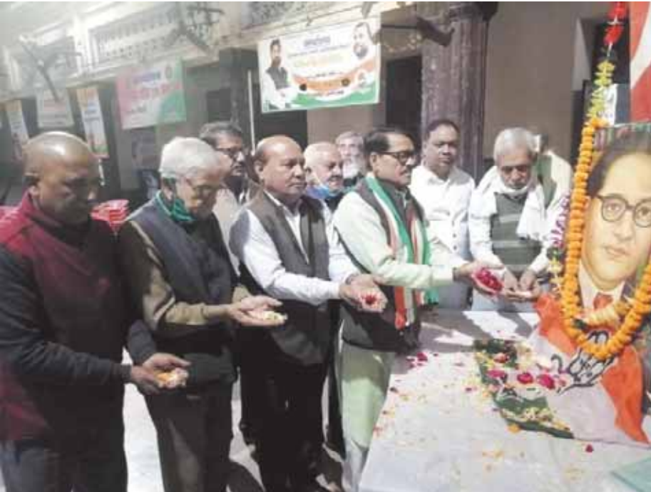
Congressmen paying homage to Dr Bheem Rao Ambedkar at Tilak Hall on Sunday.

H said Dr Ambedkar believed that development of India was not possible without rapid industrialisation and suggested that government should start large-scale industries and