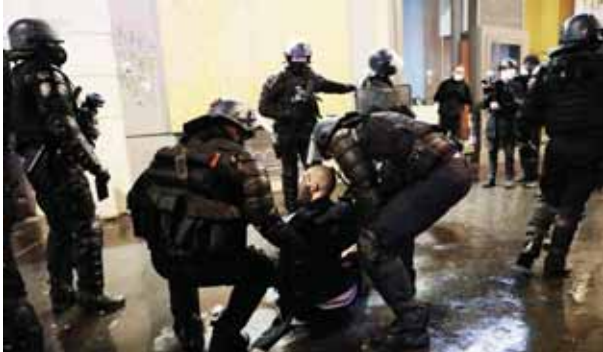
Riot police officers detain a man during a demonstration on Saturday

Paris police held 25 people, including two minors,