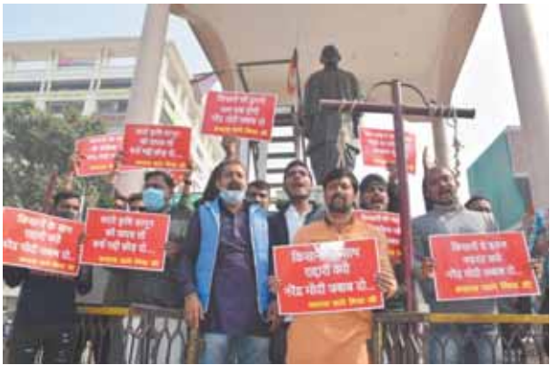
Congress Seva Dal workers protesting against farm laws in Varanasi on Sunday