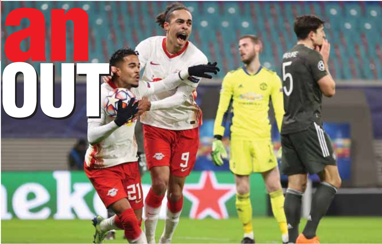
Leipzig's Justin Kluivert, left, celebrates with teammate Yussuf Poulsen after scoring his side's third goal against Man United during Champions' League group H match

Ole Gunnar Solskjaer's side, meanwhile, gets the consolation of Europa League football in the new year. Whether the under-fire Norwegian is in charge when the continental campaign restarts