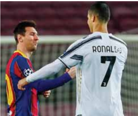
Lionel Messi shakes hands with Cristiano Ronaldo