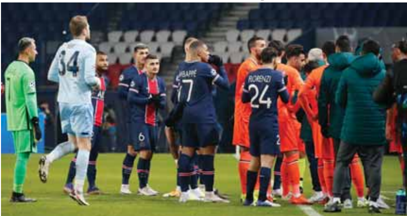
PSG and Istanbul Basaksehir players leave the pitch during the Champions' League group H match on Tuesday

"UEFA has — after discussion with both clubs — decided on an exceptional basis to have the remaining minutes of the match played tomorrow (Wednesday) with a new team of match officials ... (and) a thorough investigation on the incident that took place