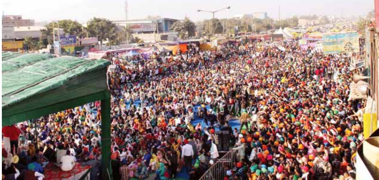
Farmers shout slogans during their Delhi Chalo protest march against the new farm laws, at Singhu border in New Delhi on Wednesday