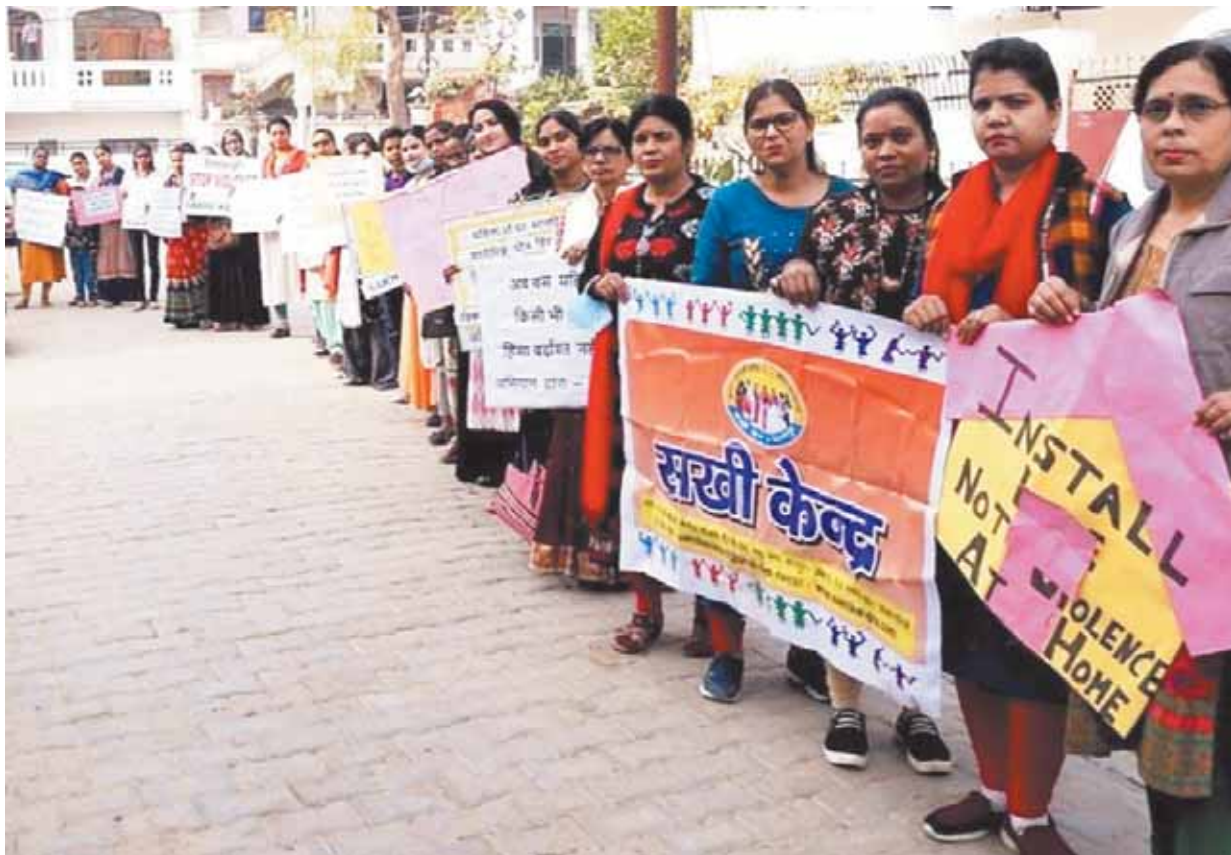
Sakhi Kendra members form a human chain to protest domestic violence against women on Wednesday