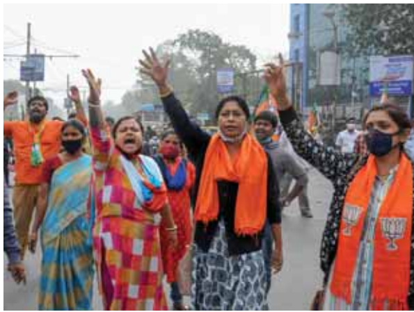
BJP workers block a road during a protest against the attack on party national president JP Nadda's convoy in West Bengal, in Kolkata on Friday