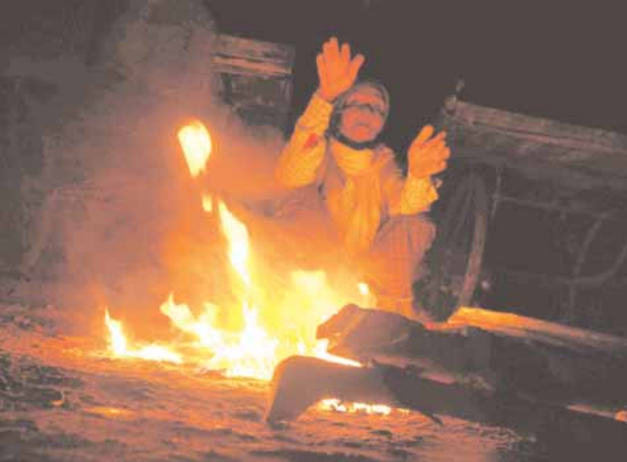
An elderly woman sits near a bonfire on a cold evening in Lucknow on Friday