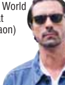
Actor —Arjun Rampal

If we say the Holocaust happened with Jews in World War II, I don't think that (battle of Bhima Koregaon) was anything less.