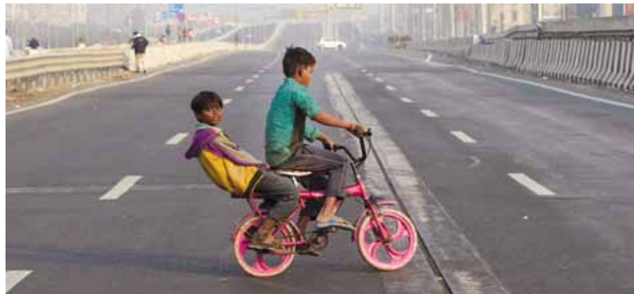
Children ride a bicycle on Delhi-Meerut Expressway during farmers' Delhi Chalo protest against new farm laws at UP side of the Ghazipur Border of New Delhi on Friday

Alternative routes to/from Haryana, UP witness traffic chaos in national Capital