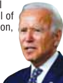
US President-elect —Joe Biden

This distinguished group of public servants will bring the highest level of experience, compassion, and integrity to bear.