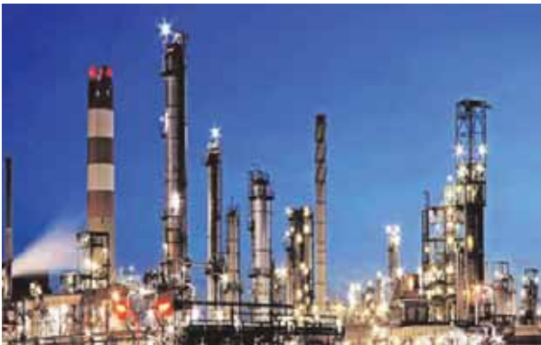
PIANS ■ NEW DELHI

India's industrial activity accelerated in October with a rise of over 3.5 per cent in factory output on a year-on-year basis, official data showed on Thursday.