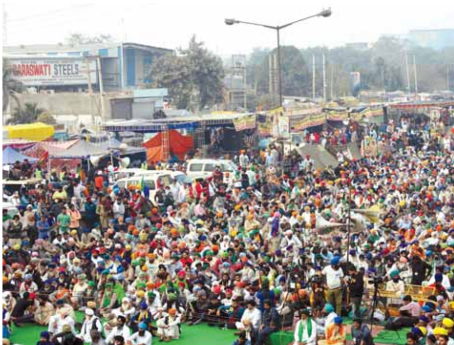
Farmers gather in large numbers at Singhu Border during their Delhi Chalo protest march against the Centre's new farm laws in New Delhi on Friday

According to BJP leaders, their "awareness campaign" (on the farm laws) which got thwarted on account of coronavirus pandemic, would be expanded and also involve