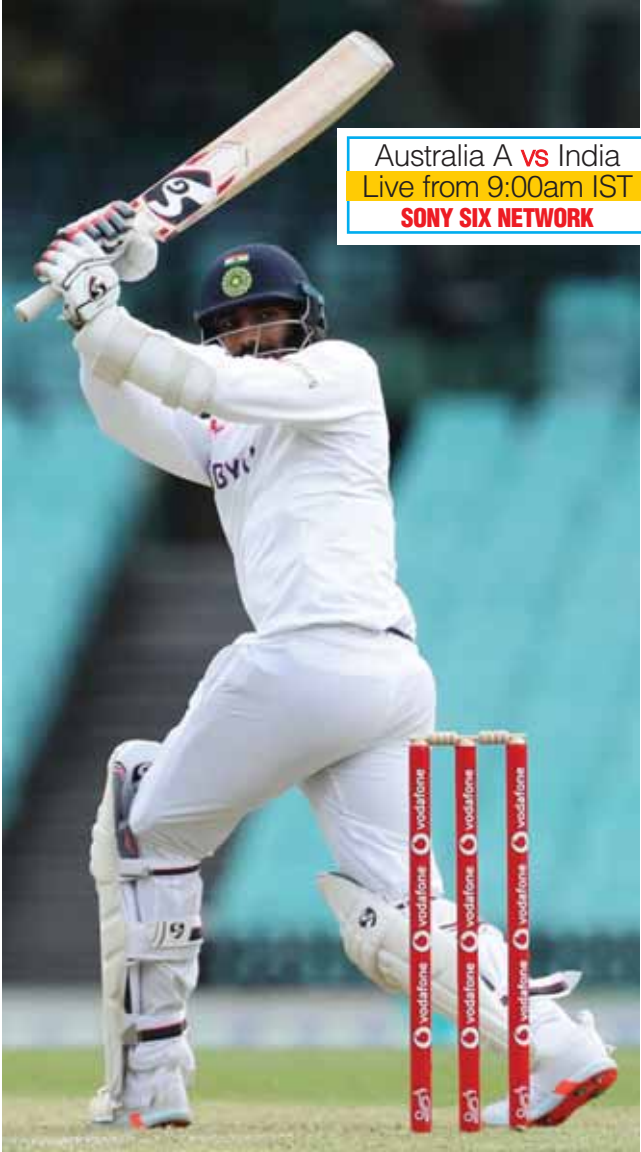
Jasprit Bumrah plays shot during his unbeaten 55-run innings against Australia A on first day of pink ball warm-up game at Sydney Cricket Ground on Friday

Earlier, after skipper Ajinkya Rahane opted to bat, Prithvi Shaw (40) and Shubman Gill (43) — both 21-year-old batsmen with bright futures — showed enough