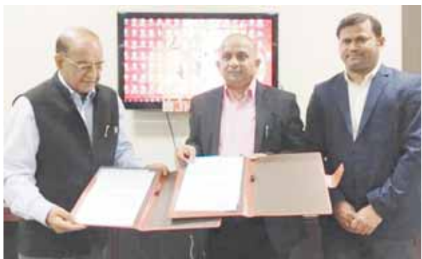
JK Centre for Technician Training and JBM Group signed a Memorandum of Understanding.