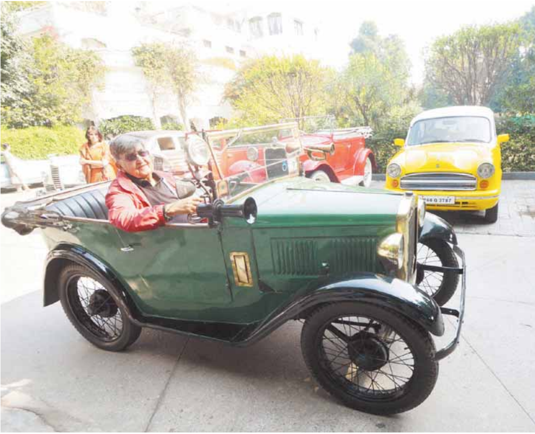
Vintage car rally in Mall Avenue on Sunday

The police said booking of a taktal ticket at the booking counter consumed 1:30 to 2:30 minutes. “By using the software, the gang members used to do the work in comparatively very small time and this way they hacked the system,” the police explained.