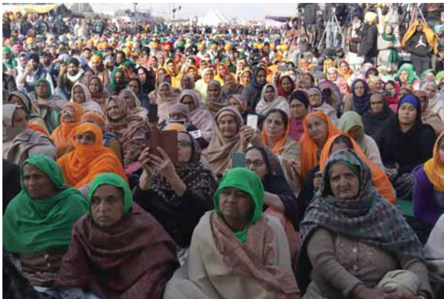
Farmers during their sit-in protest against the Centre's farm reform laws at Singhu border in New Delhi on Sunday