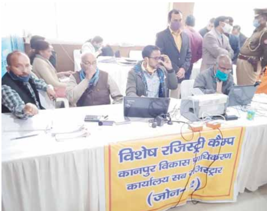
KDA organised special registry camp on Saturday.