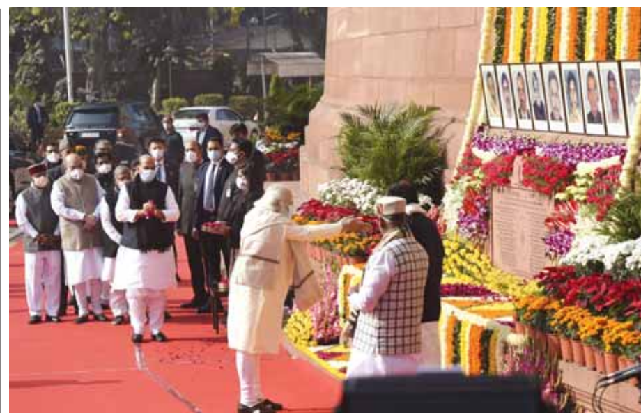
Prime Minister Narendra Modi pays tribute to the martyrs of 2001 Parliament attack on its 19th anniversary at Parliament House in New Delhi on Sunday