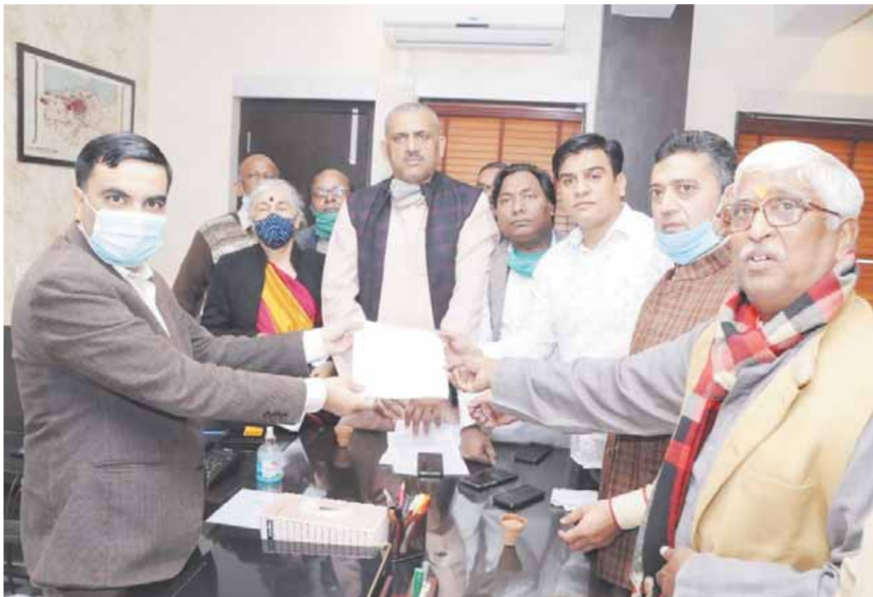
Joint Opposition Front members hand over memorandum to DM on Sunday expressing solidarity with the ongoing farmers agitation at Delhi and demonstration on Monday.