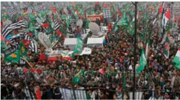
Supporters of the Pakistan Democratic Movement, an alliance of opposition parties, attend an anti-government rally in Lahore, Pakistan on Sunday