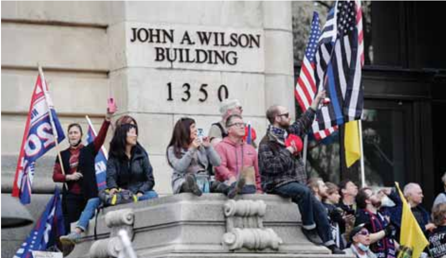
Supporters of President Donald Trump attend a rally at Freedom Plaza in Washington