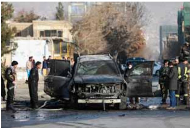
Afghan security personnel inspect a damaged vehicle after a bomb blast in Kabul, Afghanistan on Sunday