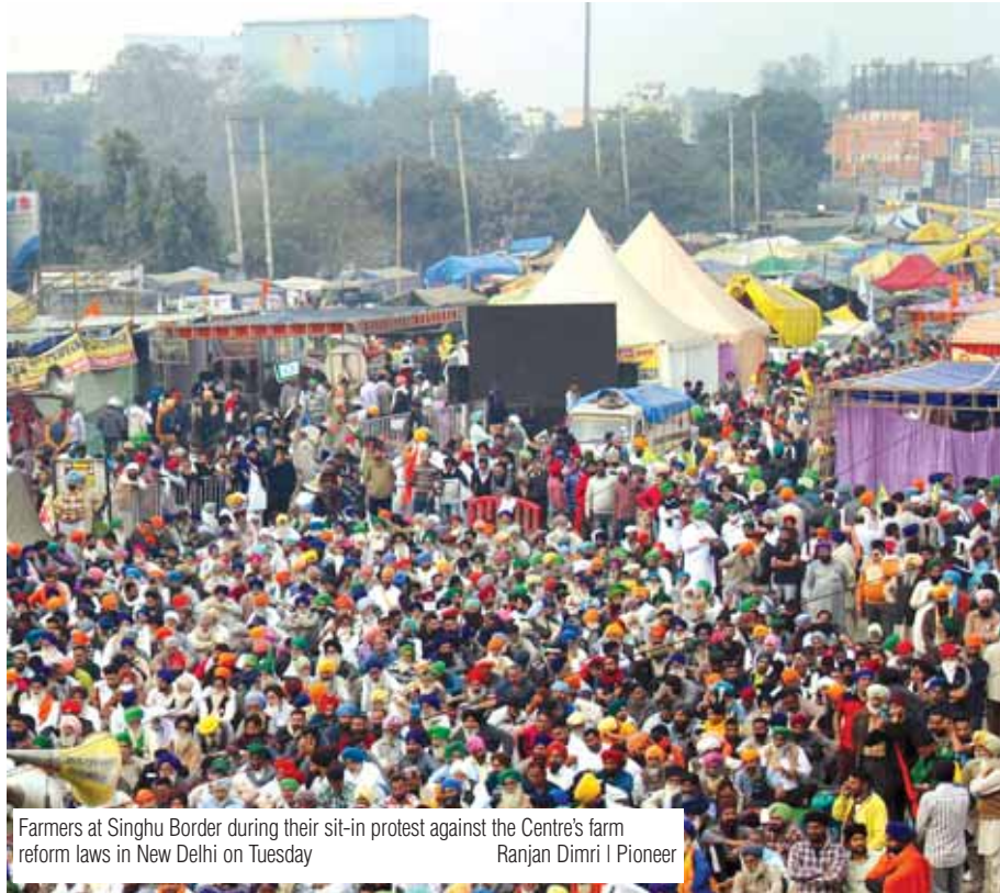
Farmers at Singhu Border during their sit-in protest against the Centre's farm reform laws in New Delhi on Tuesday

After the function, the Prime Minister interacted with a body of Sikh representatives