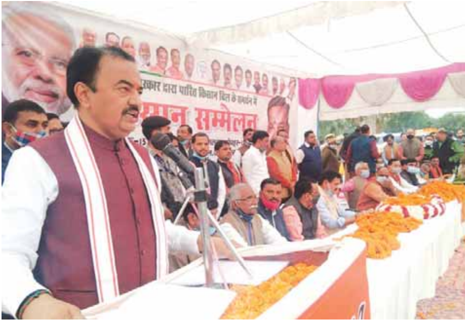
Deputy Chief Minister KP Maurya addressing farmers in Varanasi on Tuesday

Highlighting the features of farm laws, Maurya said that by this the farmers would be free to sell their crops in any part of the country without any interference of middlemen. Besides, the farmers can also export their products for handsome earning. Praising the Prime Minister Narendra Modi, he said that the Central Government had courage for the interests of the farmers which could not be shown by any government during the