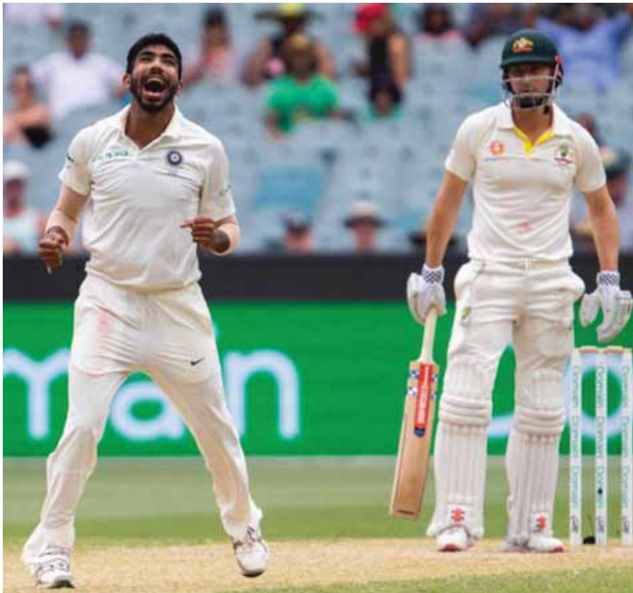
Indian pacer Jasprit Bumrah celebrates after he dismiss Australian batsman Shaun Marsh (lbw) during 3rd Test of 2018-19 Border-Gavaskar trophy series at Melbourne Cricket Ground

"I agree, there will be a huge gap in that line-up — just his (Kohli's) presence around that team and out on the field. I think the Aussies will really enjoy that they don't have to bowl to him for three of the Test matches.