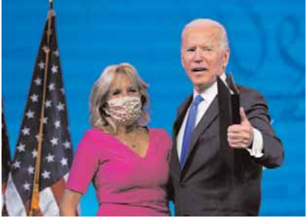
President-elect Joe Biden walks offstage with his wife Jill Biden after the Electoral College formally elected him as President

The Electoral College votes will now be sent to Congress to be counted formally next month. Though some House Republicans have indicated they will object to the results in key states, they can do little more than delay the process during a joint session of Congress on January 6.