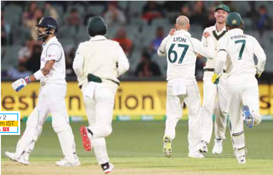
Australia's Nathan Lyon, center, celebrates with teammates after running-out India's Virat Kohli, left, on 1st day of 1st Test

Earlier, Pujara's ultra-defensive approach became his own undoing as India literally crawled during the first two