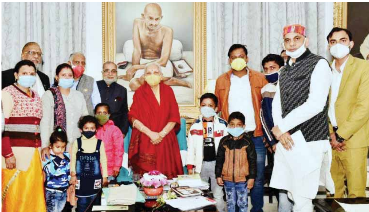
Mehrotra Foundation, working on Bal Shraavan Yojana, for cochlear implant were invited by the Governor, Anandi Ben Patel at Raj Bhawan on Thursday.