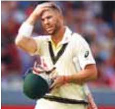
SEN about the Melbourne Test.

"I am (hopeful), that's one that I never want to miss out on," Warner told Australian sports radio network