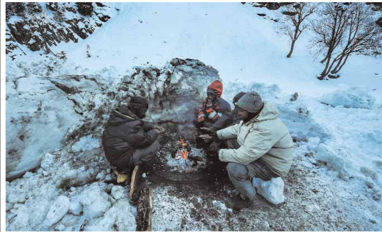
Workers warm themselves around a bonfire amid the snow-laden area at Sonamarg in Ganderbal district of Central Kashmir on Thursday