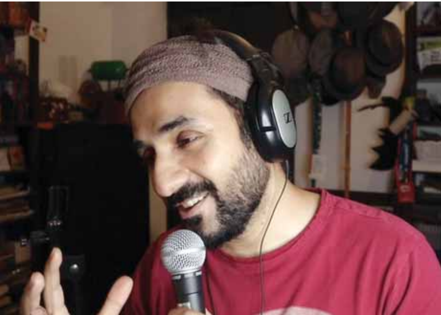
VIR DAS: OUTSIDE IN — THE LOCKDOWN SPECIAL Netflix *ing: Vir Das Rated: 5.5/10

We all know how funny stand-up comedy is. We also know that Vir Das has perfected this craft. The latest 50-odd minute virtual session on Netflix on how he entertained people in order to raise money for charity is everything that he is known for—being funny and ensuring that his audience got plenty of laughs. What is brilliant about this show that Das conducted over Zoom is it managed to