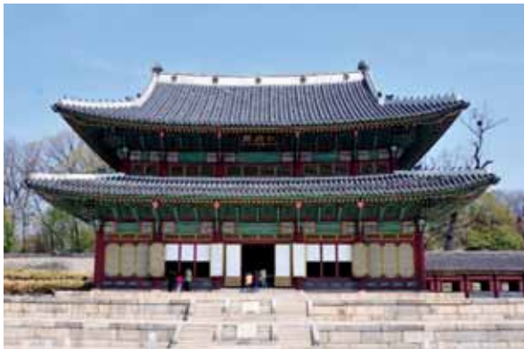
Pavilions inside the Korean palaces with traditional Korean architecture