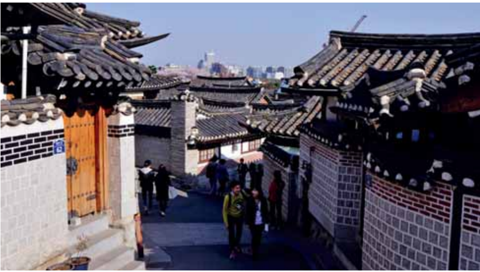
The rooftops of Bukchon Hanok village

like approach manifests in various ways — be it the 22000 USD per capita GDP, which was less than USD 100 in 1953; the meteoric rise of South Korean economy, which is Asia's third-biggest economy today, or the legendary emergence of not just Hyundai or Samsung brands, but so many others. It could be felt in the interactions with any Korean — from the presentations of my Korean Custom department friends to the absolute professional homework of the tour guide, who took us on a tour of the World Heritage Site of Gyeongbokgung Palace. For example, to explain the concept of 'ondol', the traditional heating system of Korean homes, our tour guide drew out a proper schematic diagram to show the generation of heat and the consequent hot air and its movement under the floor made up of stones and clay.