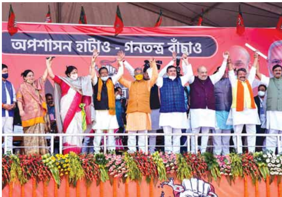
Union Home Minister Amit Shah, along with party leaders, during an election rally ahead of West Bengal Assembly polls 2021 in West Midnapore district on Saturday

The long queue of defectors suggested that the BJP was going to come to power with 200-plus legislators, Shah said buttressing party vice president Mukul Roy's argument that the ruling outfit would not