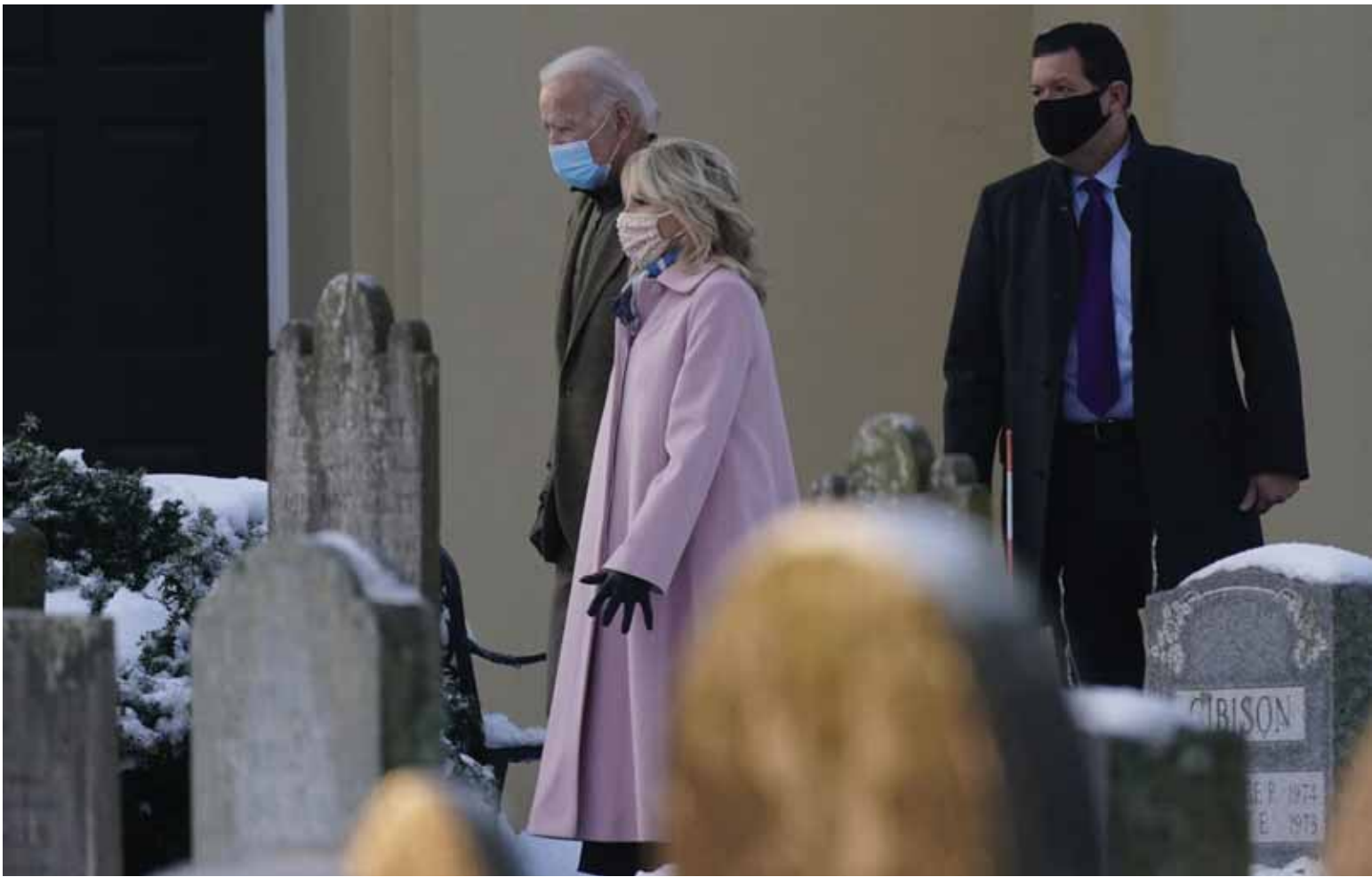
President-elect Joe Biden and his wife Jill Biden walk from St Joseph on the Brandywine Roman Catholic Church in Wilmington, Del, on Friday

Biden has attempted to move away from the quintessential American Dream dreamt of by American historian John Truslow Adams as he reiterated in his acknowledgement speech in Delaware that the pained American soul would be reinstated during his term as the American President in January 2021 as he stressed upon the context of the United States of America requiring a re-building and reorientation in a larger international system which reeks with reformed