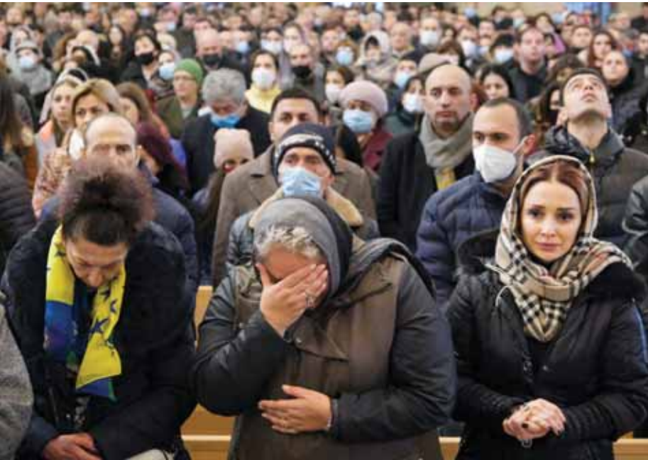
People attend a memorial church service for the victims of the conflict with Azerbaijan over Nagorno-Karabakh in Yerevan, Armenia on Saturday

All the victims were passengers of the bus, bdnews24.Com reported. PTI