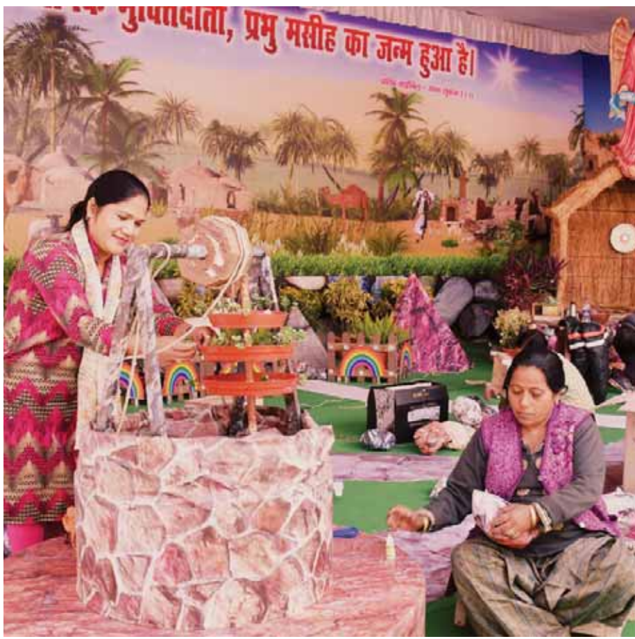
Christmas preparations underway at Cathedral church in Hazratganj on Saturday