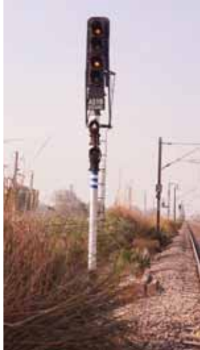
quadrupling, flyovers, yard

NCR operates and maintains 751 Kms of busiest New Delhi-Howrah trunk route falling on Prayagraj division. Mobility on this route is critical for overall operations of trains from North to Eastern part of the country. To increase train handling capacity in this critical section, many important works including tripling,