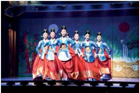
Traditional Korean dance