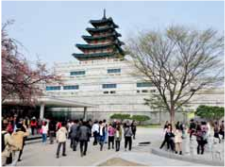
A glimpse of traditional Seoul

Seoul is fast emerging as the 'New Design Capital' of the world, sprinkled with art galleries at every nook and corner of the city, with multi-storeyed markets selling artistic