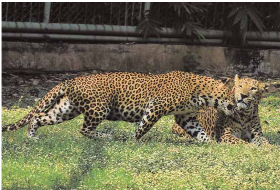
Leopards inside an enclosure at Sarthana Nature Park in Surat on Saturday

Stressing the need to change the strategies of war according to evolving times, Singh said the country may face challenges not only across the borders and the seas, but also Space and Cyber domains, for which it needs to be prepared. PTI