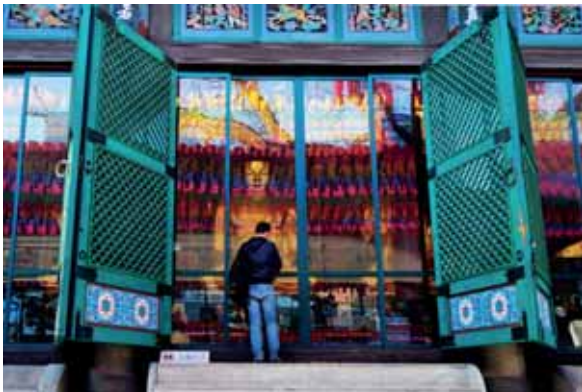
Peace and solitude at Jogyesa