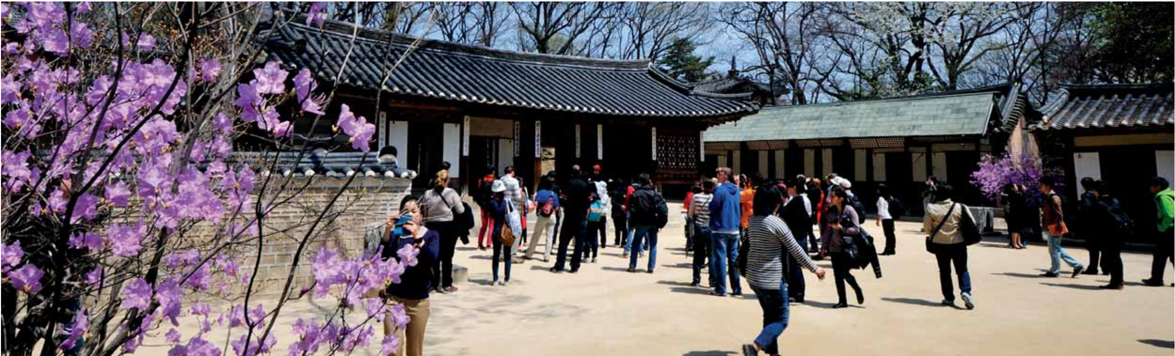
Gardens and pavilions of Gyeongbokgung Palace

By turning your attention inwards, you can make necessary amends through fresh inputs to rewrite your destiny