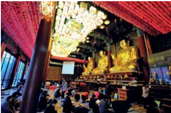
Daeungjeon, the sanctum sanctorum of Jogyesa with its holy trinity