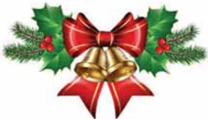
PLATE FULL OF XMAS CHEERS

With only five days left for Christmas, it is time to whip up some tasty treats and bid adieu to the year on a sweet note. SUNDAY PIONEER brings you some exclusive recipes