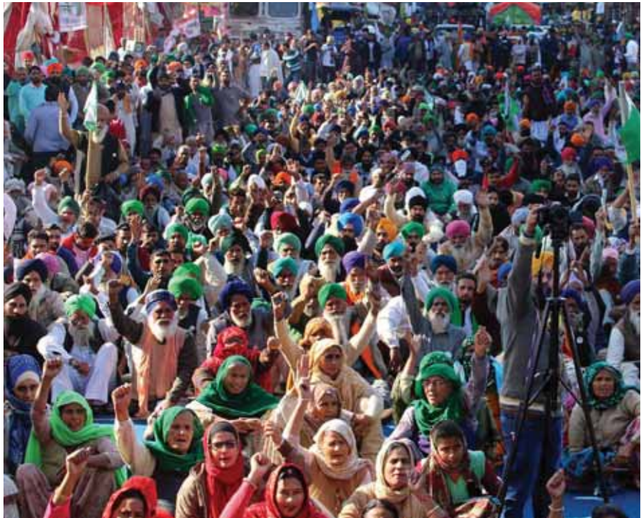
Farmers gather at Tikri border during their sit-in protest against the Centre’s farm reform laws, in New Delhi on Saturday

She said that serious questions are being raised on the UP’s Yogi government from this charge sheet. Priyanka released a statement stating that CBI has filed a charge sheet against 4 accused of the Hathras case. In it, it is said that a 19-year-old girl was gang-raped and murdered.