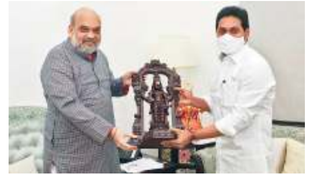
Chief Minister YS Jaganmohan Reddy presents a memento to Union Home Minister Amit Shah during their meeting in New Delhi on Tuesday.

During the meeting, Jagan informed Shah that his govern-