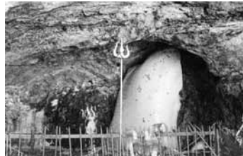
Palaham. At least four helpalads and a base camp have been made operational to facilitate pilgrims via Baltal route. The 16 km track on this route is more treacherous and difficult to climb. Necessary security arrangements and other logistics have been kept in place to ensure incidents free and smooth conduct of the yatra even for a limited time period. In Jammu and along the entire yatra route elaborate security arrangements will be made to ensure safety of the pilgrims.

its original schedule, Shri Amarnath Shrine Board authorities had approached the national broadcaster, Doodarshan, to explore the possibility of live telecast from the cave shrine. After receiving clearance from their head office, the technical teams were rushed to the spot to assess the ground situation and make necessary arrangements. On the other hand, Shri Amarnath Shrine Board Authorities are fully geared up on ground zero and making all necessary arrangements for the start of the yatra in the near future. So far, Shrine Board authorities have decided to conduct the yatra via Baltal route. The annual pilgrimage will not be allowed via another traditional route of