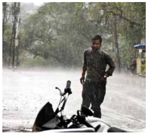
A man walks on road amid rain during nationwide lockdown in the wake of coronavirus pandemic in Bhopal on Wednesday

Ayodhya: The Ram Lalla idol here was shifted to a temporary new location early on Wednesday in the presence of Uttar Pradesh Chief Minister Yogi Adityanath, clearing the site to allow construction of Ram temple.