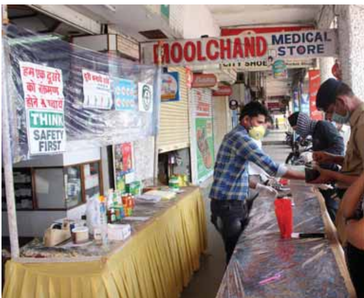
A shopkeeper at a chemist shop use protective measures and maintain distance from the customers in the wake of coronavirus outbreak in Bhopal on Wednesday