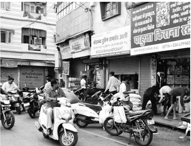
People buy grocery items during nationwide lockdown and curfew in the wake of coronavirus outbreak in Bhopal on Wednesday

should make such a system that poor people, organized and unorganized sector's laborers, families below the poverty line can get sufficient quantity of food grains. The arrangement made by the Government so far is not enough and it needs to be improved. The Government should also worry about the poor tribal people living in rural areas," he added.