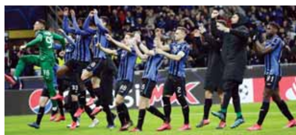
Atalanta players celebrate at end of CL round of 16, first leg match against Valencia at San Siro