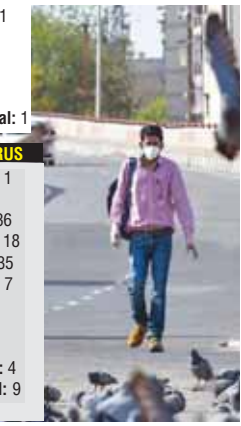
Five more persons tested positive for COVID-19 in Delhi, Chief Minister Arvind Kejriwal

Health Ministry stated that the second death reported in Delhi was Covid-19 negative.