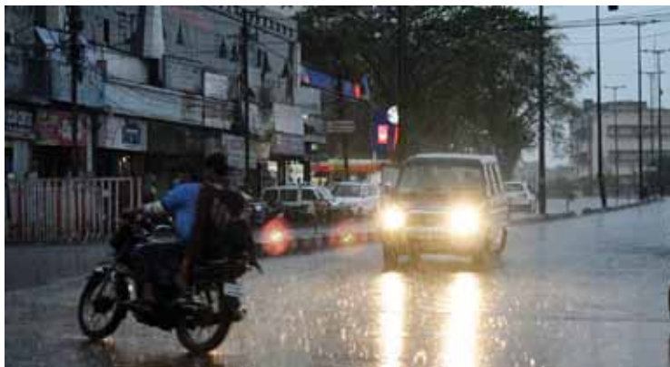
Commuters move on road while it rains during nationwide lockdown in the wake of coronavirus pandemic in Bhopal on Wednesday

Thundery activities and speedy winds would be witnessed in six divisions and five districts warned Met officials. The warning of thunder lightning and speedy winds has been issued for Indore, Ujjain, Hoshangabad, Gwalior, Bhopal and Chambal divisions and Tikamgarh, Sagar, Damoh,