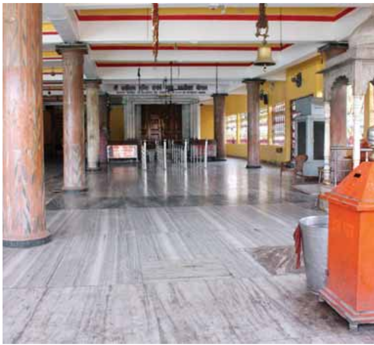
A deserted Goddess Durga temple with no devotees on the beginning of Chaitra Navratri festival, during nationwide lockdown in the wake of coronavirus pandemic in Bhopal on Wednesday

The video conferencing would be attended by senior officers of police, health department, Municipal corporations and administration.