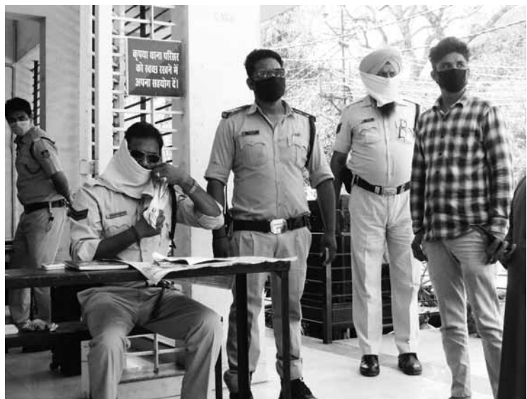
aPolice personnel keep distance from the complainants at a police station in the wake of coronavirus pandemic, in Bhopal on Wednesday

Besides, the contact details of the staff should be provided to the institutions, so that they may be contacted if required.