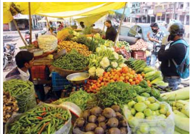
People buy vegetables during nationwide lockdown and curfew in the wake of coronavirus outbreak in Bhopal on Wednesday

The victim is mentally challenged and due to which she failed to find way and later met the two accused.