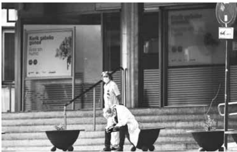
Health services staff members protest outside the Txagorritxu hospital

The country's hospitals are groaning under the weight of the pandemic: Video and photos from two hospitals in the Spanish capital showed patients, many hooked up to oxygen tanks, crowding corridors and emergency rooms. At