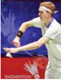
BWF, in the short-term, is also looking into the possibility of freezing World Rankings until international tournaments

"For our athletes, we will review any impacts on the Olympic and Paralympic qualification system to ensure a fair solution is found to qualify players for the postponed Games," the BWF said in a statement.