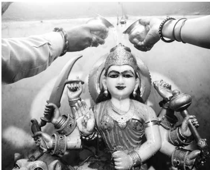
Hindu devotees perform abhishek to Goddess Durga as they offer prayers in a temple on the beginning of Chaitra Navratri festival, in Bhopal on Wednesday

Police after issuing notice to the operator of the factory registered a case against him. The police would collect further information regarding the verification of these workers was done at the police station and is case if verification was not done by the factory operator a case would be registered against him.