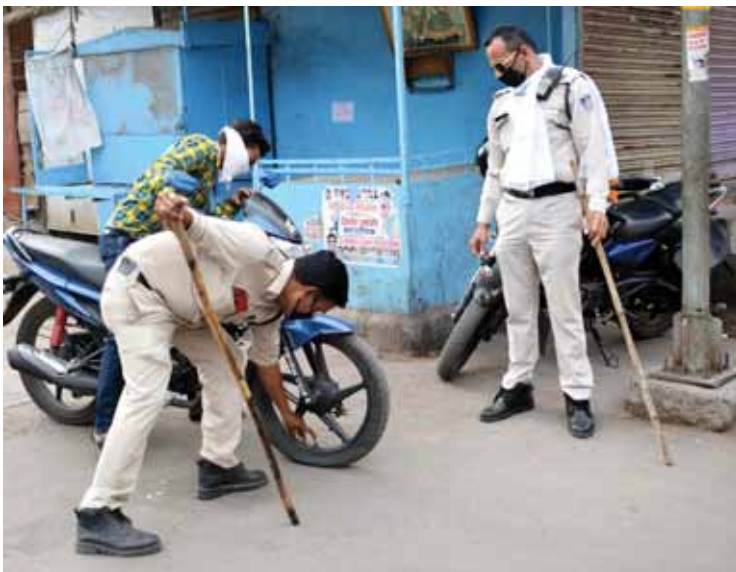
A security personnel deflates the tyre of an offender's vehicle during nationwide lockdown in the wake of coronavirus pandemic in Bhopal on Thursday