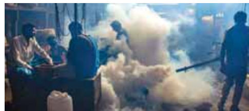
A BMC worker fumigates Byculla market area as a precautionary measure against the spread of coronavirus during lockdown in Mumbai on Thursday

It has been decided that scheduled international commercial passenger services shall