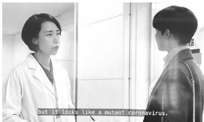
but it looks like a mutant coronavirus.

With binge-watch becoming the ideal quarantine activity, pandemic films are the new favourite genre across the world, says CHAHAK MITTAL