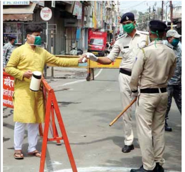
A social worker serves tea to the Quick Response Force personnel deployed during nationwide lockdown and curfew in the wake of coronavirus outbreak in Bhopal on Thursday

Besides, keeping in view the serious outbreak of Coronavirus, the CBSE also postponed board exams across the country.