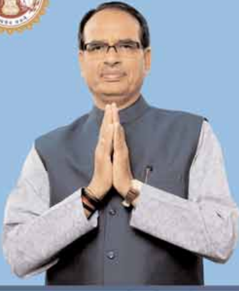
शिवराज सिंह चौहान मुख्यमंत्री, मध्यप्रदेश