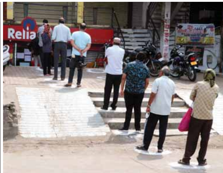
People maintain social distancing as they stand in queue to purchase daily need items at Reliance Fresh during nationwide lockdown and curfew in the wake of coronavirus pandemic in Bhopal on Thursday