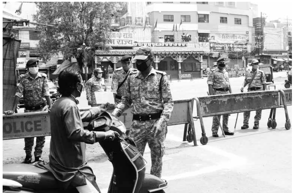
Quick Response Force personnel check a scooterist in Bhopal on Thursday

He said that as many as 2257 people have been kept under surveillance out of which 636 have completed 28 days of surveillance period. The investigations of 34 persons for COVID-19 have been done today and all were found negative.