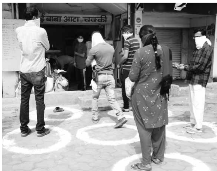
People keep distance as they stand to grind wheat grains at a flour mill during the nationwide lockdown and curfew, in Bhopal on Thursday