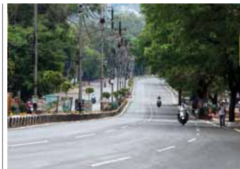
A city street wears a deserted look during nationwide lockdown and curfew in the wake of coronavirus outbreak in Bhopal on Thursday

The total number of novel corona virus positive cases have risen to 21 in Madhya Pradesh including deaths of two. Former Chief Minister Kamal Nath on Thursday wrote to CM Shivraj Singh Chouhan urging him to ensure availability of protective gears for health staff, identification of dedicated hospitals for this disease, proper arrangements in private hospitals and establishment of labs in every district.