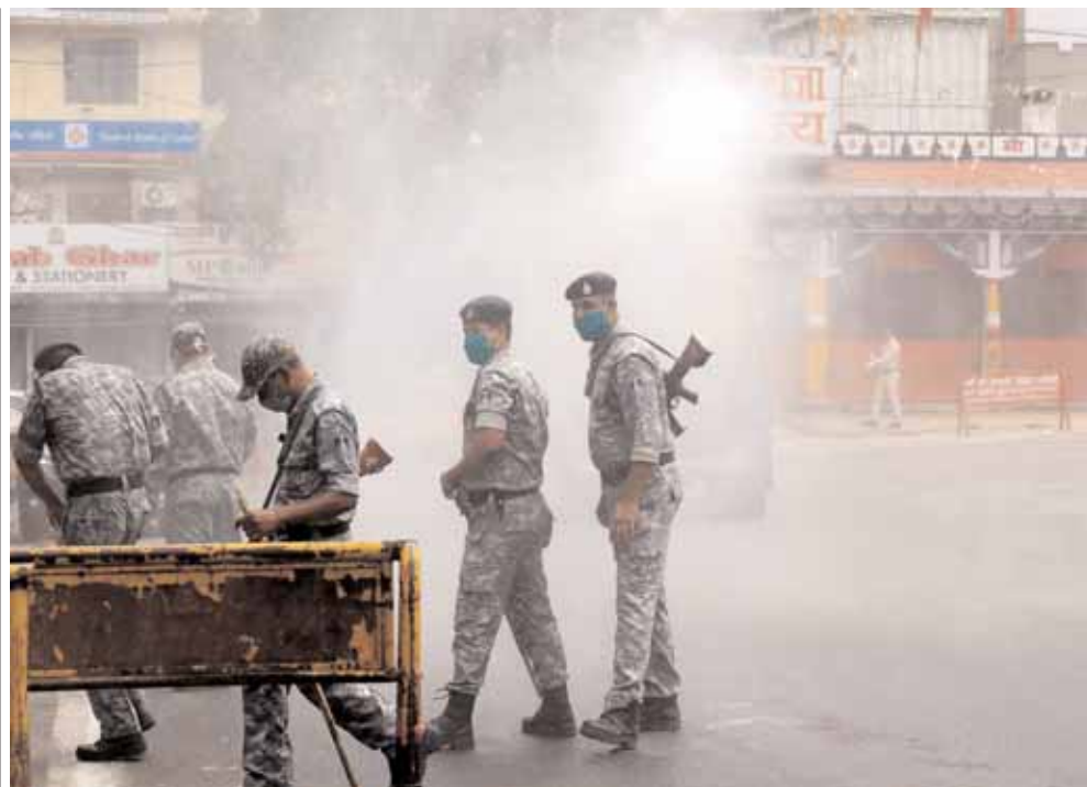
Quick Response Force (QRF) personnel stand guard as BMC employees spray disinfectant during nationwide lockdown and curfew in the wake of coronavirus outbreak in Bhopal on Thursday

Police were informed and on the receipt of the information police team reached the spot and started investigation. After the preliminary investigation the body was sent for the post mortem. The police have registered a case under section 174 of the CrPC and have started further investigation.