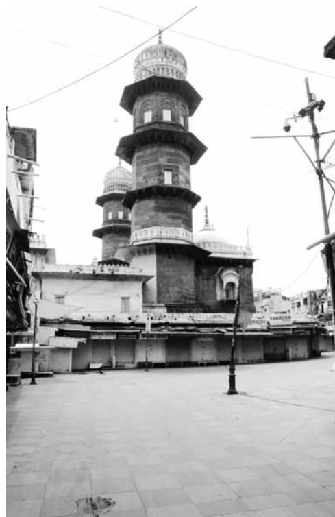
A view of closed Chowk Bazaar during nationwide lockdown and curfew in the wake of coronavirus outbreak in Bhopal on Thursday

The project was selected for the Prime Minister's Award in the year 2017 for achieving minimum tariff for the first time.