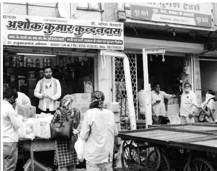
People purchase essential items from shops during nationwide lockdown and curfew in the wake of coronavirus outbreak in Bhopal on Thursday