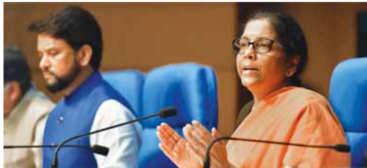
Union Finance Minister Nirmala Sitharaman addresses a Press conference to announce Gareeb Kalyan Yojana to help the poor in the view of the coronavirus lockdown at National Media Centre in New Delhi on Thursday

Focus on migrant/farm labourers; ₹50L insurance for health-sanitation workers; fund to prevent lay-off