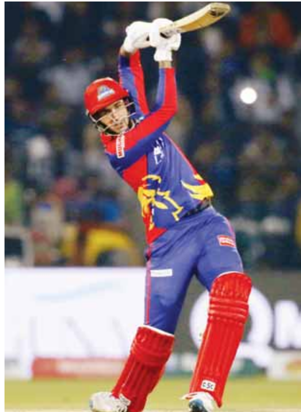
Karachi Kings batsman Alex Hales plays a shot during Pakistan Super League match