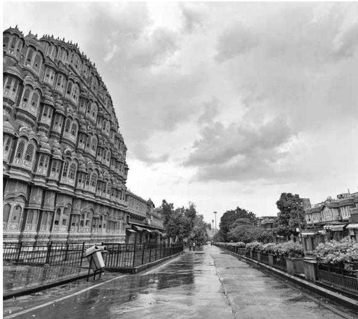
A deserted Hawa Mahal area during the lockdown in the wake of coronavirus pandemic in Jaipur on Tuesday