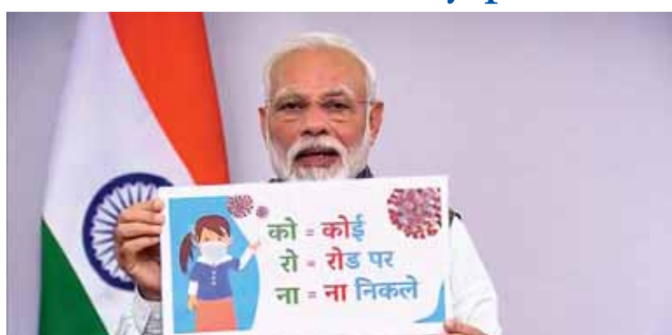
Prime Minister Narendra Modi addresses the nation on coronavirus pandemic in New Delhi on Tuesday

PM declares 21-day pan-India lockdown to defeat corona