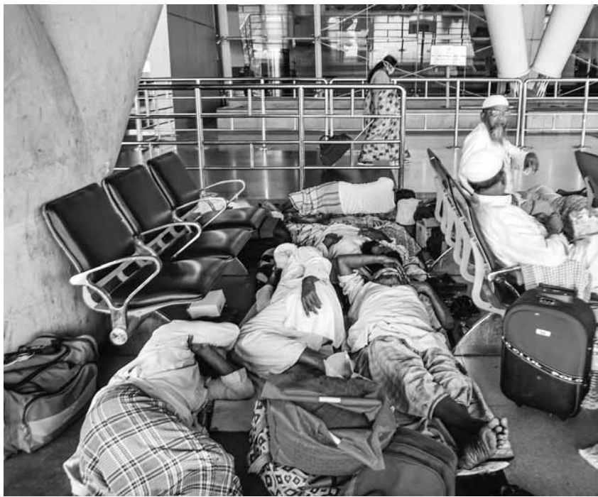
Passengers stranded at the airport take rest after no local transport was available following Government's imposition of lockdown in the State amid coronavirus pandemic, in Chennai on Tuesday

The three earlier victims included a 68-year-old Filipino and two other men, both aged 63. IAN S