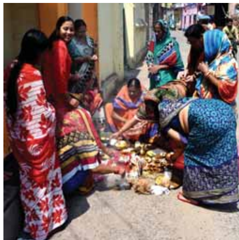
Even though there is total lockdown for coronavirus in Puri town, women gather on a roadside to observe Pantei Puja on Tuesday