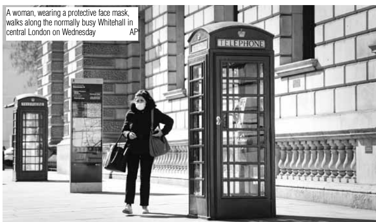
A woman, wearing a protective face mask, walks along the normally busy Whitehall in central London on Wednesday

The cemetery itself remains closed to the villagers because public gathering are banned — so grieving for your loved ones with flowers at their grave is no longer allowed.