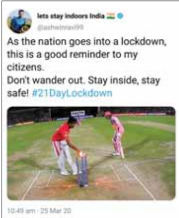
With govt calling for a 21-day lockdown in an effort to fight coronavirus outbreak, India spinner R Ashwin used a picture of him making Jos Buttler in last years IPL to ask people to stay indoors and stay safe

"So, for example, someone like a Kohli loves to train with weights as well. So, his routine would have weights involved like the clean and jerk and deadlifts and other exercises. While another player might be more comfortable doing free-hand exercises, so in that case, he has been given more free weight functional training options," the source pointed.