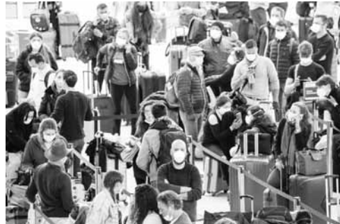
Passengers wear face masks to fend off coronavirus as they wait in line to check in for their flights at JFK airport in New York

President Trump, whose approval rating touched 50 per cent for the first time apparently because of his handling the coronavirus crisis on a war footing, put up a brave front on Tuesday telling reporters that he expects things to go back to normal in about three weeks'