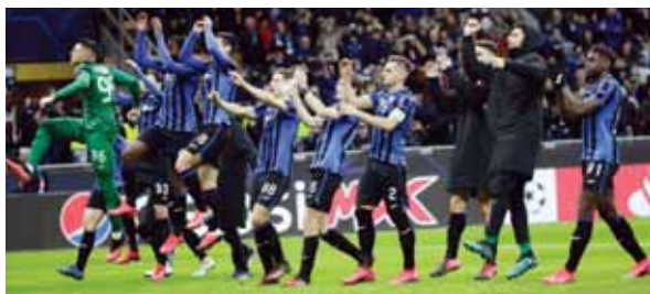
Atalanta players celebrate at end of CL round of 16, first leg match against Valencia at San Siro