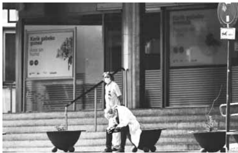
Health services staff members protest outside the Txagorrixu hospital

The country's hospitals are groaning under the weight of the pandemic: Video and photos from two hospitals in the Spanish capital showed patients, many hooked up to oxygen tanks, crowding corridors and emergency rooms. At