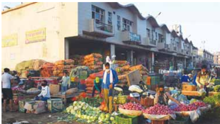
Vendors wait for customers at Ghazipur vegetable market during a nationwide lockdown in the wake of coronavirus pandemic, in New Delhi on Wednesday

Meanwhile, top e-commerce sites Flipkart and Amazon have temporarily suspended their services. Flipkart has listed all products as "out of stock" on the search page.