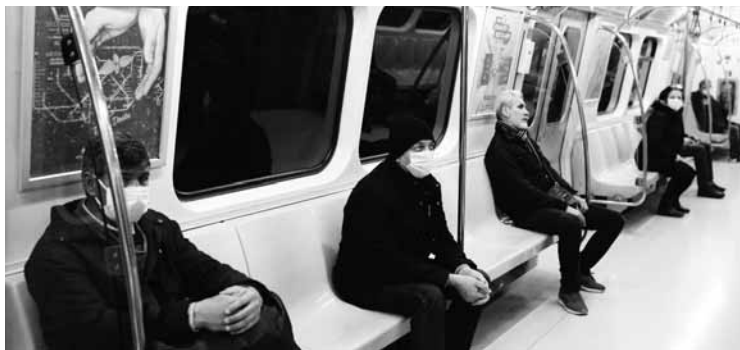
Commuters ride an underground train while keeping their social distance due to the coronavirus outbreak, in central Istanbul on Wednesday