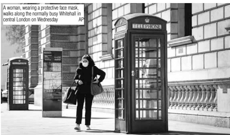
A woman, wearing a protective face mask, walks along the normally busy Whitehall in central London on Wednesday

The cemetery itself remains closed to the villagers because public gathering are banned — so grieving for your loved ones with flowers at their grave is no longer allowed.