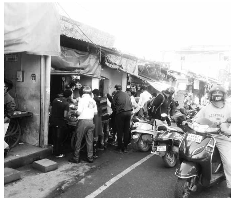
Defeating the purpose of lockdown, people crowd ignoring social distancing while purchasing vegetables during the 7 AM to 10 AM window in Dehradun on Wednesday

administration has assured citizens that there is no need to panic as there is enough stock of food items in the district. The district has one lakh quintals of wheat, 31,000 quintals of rice with sufficient stock of pulses and sugar. The district supply officer KK Agarwal said that strict action will be taken against shopkeeper found over-pricing.