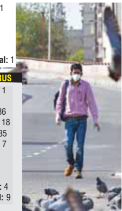
positive for COVID-19 in Delhi, Chief Minister Arvind Kejriwal said on Wednesday evening.

the second death reported in Delhi was Covid-19 negative. Five more persons tested