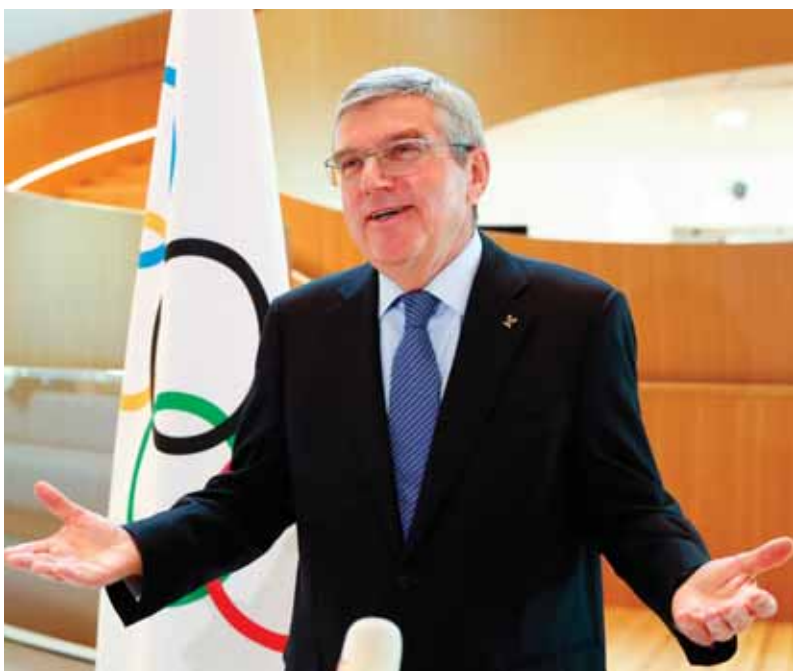
IOC president Thomas Bach attends an interview after the decision to postpone Tokyo 2020 Olympics because of coronavirus disease AP German said.

"The first step, we have to see with them, to see what the options are. We also have to take into account the sports calendar around the Olympic Games," the