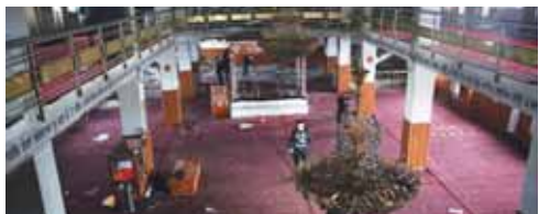
Inside view of the gurdwara after an attack in Kabul on Wednesday

The ISIS terror group, which has targeted Sikhs before in Afghanistan, claimed