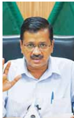
the Government does not want daily wagers and homeless to suffer due to restrictions hence it had decided to distribute free

food and enhanced benefits under ration scheme.