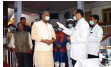
CM TS Rawat undergoes screening conducted on all members and officials before entering the House on Wednesday

attitude shown by the opposition members who didn't brought any cut motions on the budget proposals. In view of the threat posed by the novel