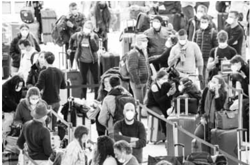
Passengers wear face masks to fend off coronavirus as they wait in line to check in for their flights at JFK airport in New York

President Trump, whose approval rating touched 50 per cent for the first time apparently because of his handling the coronavirus crisis on a war footing, put up a brave front on Tuesday telling reporters that he expects things to go back to normal in about three weeks'