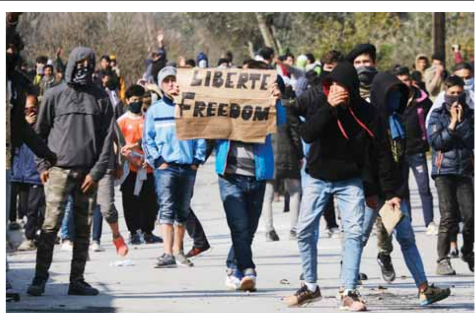
Migrants hold placards during a rally outside the Moria refugee camp on the northeastern Aegean island of Lesbos, Greece on Monday

Kuala Lumpur: Malaysia's new prime minister insisted Monday he was no "traitor" after taking power without an election and with support from a scandal-tainted party, following political heavyweight Mahathir Mohamad's shock resignation.