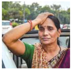
Nirbhaya's mother at the Patiala House Court in New Delhi on Monday

According to the Delhi Prison Rules, if a mercy petition is submitted, a 14-day period has to be given to the convict after the dismissal of the mercy plea, for a new death warrant.