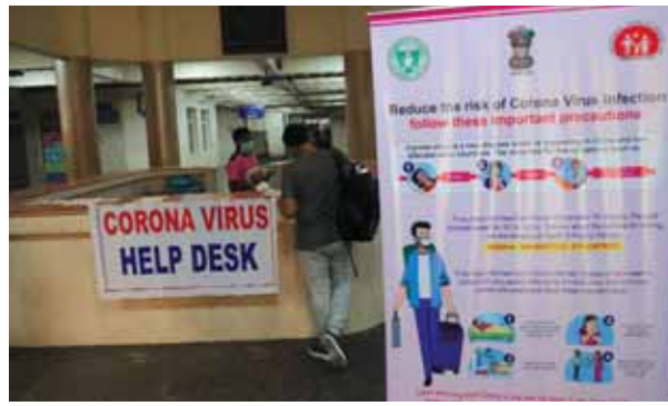
A man with symptoms fills a form at a coronavirus help desk at the Government Gandhi Hospital in Hyderabad on Monday

Rajasthan Health Minister Raghunath Singh said an Italian tourist has been found positive of coronavirus in Jaipur. He is being treated at Jaipur's SMS Hospital. In the first sample collected on February 29, the man was tested negative but his condition deteriorated so the second sample was collected which tested positive on Monday, the Minister said,