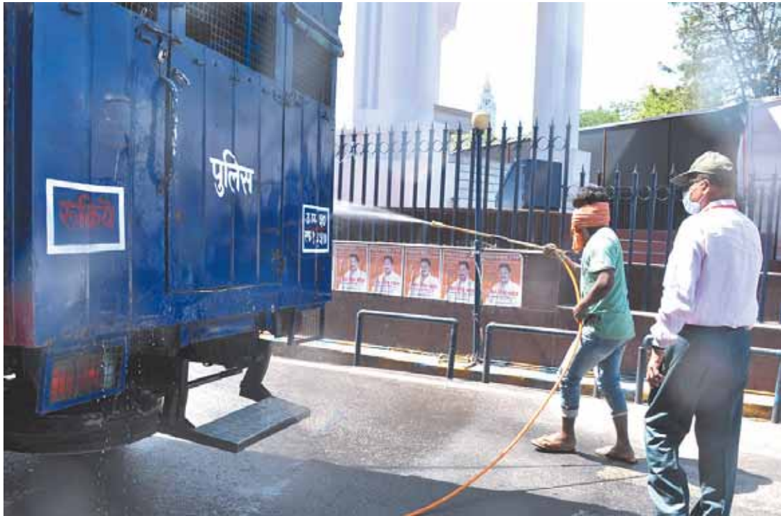
A police vehicle is being sanitised in Lukcnow on Thursday

"I demand that the Union and UP governments identify such people and provide food, water and other facilities especially for children. Besides, the government should also arrange for their safe return to their homes. But before that, they should also be tested free of cost for corona-virus," the Congress leader suggested.