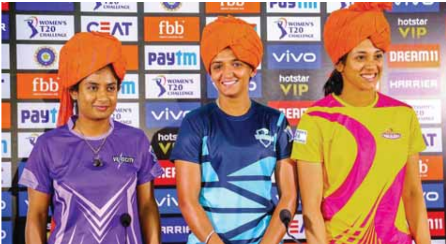
Mithali Raj, Harmanpreet Kaur and Smriti Mandhana pose for photo after pre-match conference of women's tourney in 2019

In 2019, a three-team women's tournament was held featuring sides called IPL