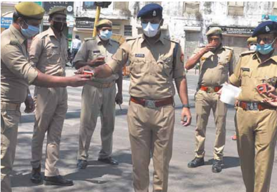
(Clockwise from top) Police personnel at a shop following complaints of overcrowding; a cop sitting outside a shop to ensure social distancing; barricades put up on a road in Barabirwa; and security personnel on duty getting refreshments