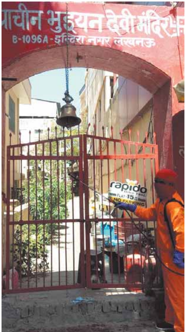
Bhuiyan Devi temple in Indira Nagar being sanitised on Thursday in view of the coronavirus outbreak

They later walked along railway tracks to reach Chandauli's Kuchman station sans food or water and decided to walk along the tracks to their homes at Samastipur and Chhapra. On being informed, a police team rescued the workers. They were medically checked and fed. The SP said that arrangements were being made to ensure their safe transit to their destinations.