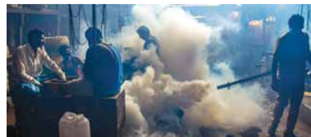
A BMC worker fumigates Byculla market area as a precautionary measure against the spread of coronavirus during lockdown in Mumbai on Thursday

"It has been decided that scheduled international commercial passenger services shall