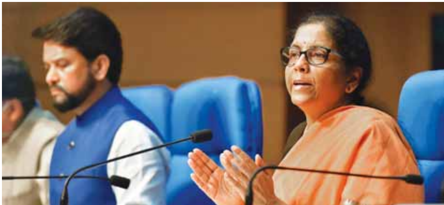
Union Finance Minister Nirmala Sitharaman addresses a Press conference to announce Garib Kalyan Yojana to help the poor in the view of the coronavirus lockdown at National Media Centre in New Delhi on Thursday

Focus on migrant/farm labourers; ₹50L insurance for health-sanitation workers; fund to prevent lay-off