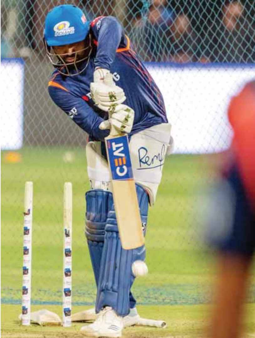
Mumbai Indians skipper Rohit Sharma bats during team's practice session

Rohit also said that current Mumbai Indians coach Mahela Jayawardene is someone who gives a lot of clarity to his players. "Mahela is very calm, very composed. He only tells you to do things he sees as right