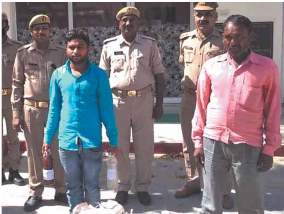
Bootleggers in custody of Chinhat police