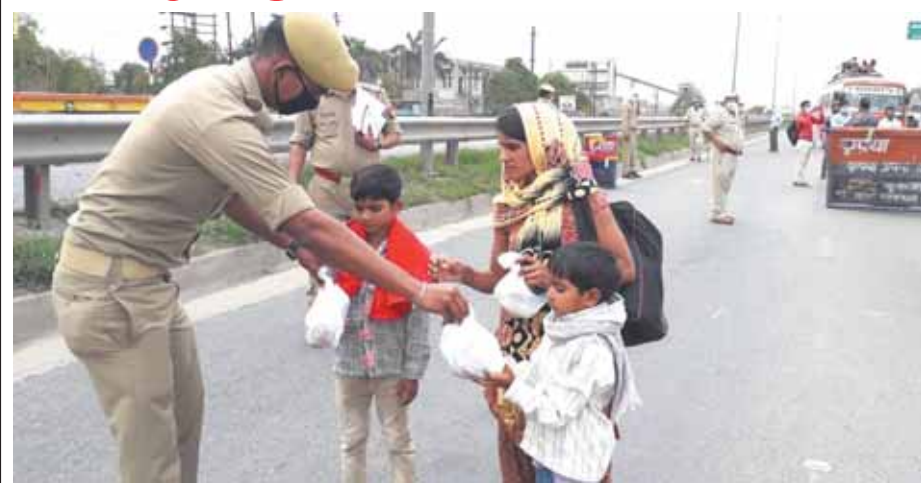
Despite being under stress maintaining law and order, UP police personnel extended their humane touch when they came to know of several people walking home to their villages from the national capital in Bulandshahr. The migrating poor were located, handed food packets and relief material and then vehicles arranged to drop them near their villages.