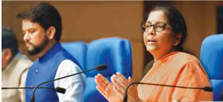
Union Finance Minister Nirmala Sitharaman addresses a Press conference to announce Gareeb Kalyan Yojana to help the poor in the view of the coronavirus lockdown at National Media Centre in New Delhi on Thursday

Focus on migrant/farm labourers; ₹50L insurance for health-sanitation workers; fund to prevent lay-off