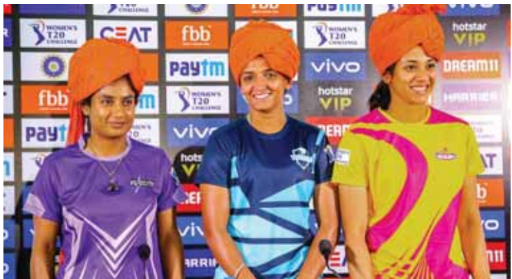
Mithali Raj, Harmanpreet Kaur and Smriti Mandhana pose for photo after pre-match conference of women's tourney in 2019

In 2019, a three-team women's tournament was held featuring sides called IPL