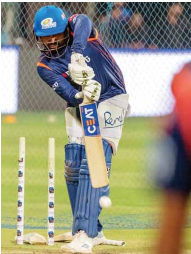
Mumbai Indians skipper Rohit Sharma bats during team's practice session

Rohit also said that current Mumbai Indians coach Mahela Jayawardene is someone who gives a lot of clarity to his players. "Mahela is very calm, very composed. He only tells you to do things he sees as right