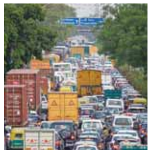
Heavy traffic on Ring Road towards Sarai Kale Khan in New Delhi on Tuesday

While popular markets like Connaught Place and Khan