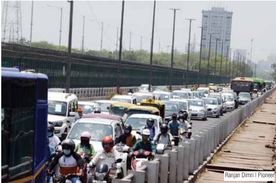
Ranjan Dimri | Pioneer

"We are checking every vehicle but sometimes it becomes very difficult due to the numbers of vehicles. People with valid passes are being allowed. However, if someone