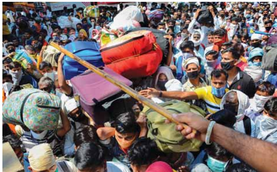
Migrants, not adhering to social distancing norms, gather to get medically screened before boarding a train to Uttar Pradesh during the ongoing nationwide Covid-19 lockdown in Amritsar on Tuesday

MHA makes States/UTs responsible for receiving, sending migrant workers to/from railway stations