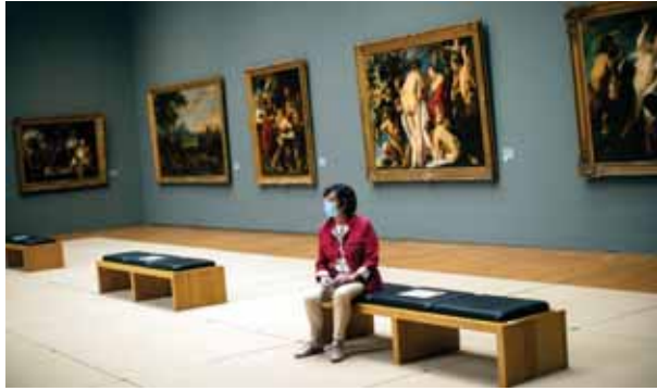
A woman wears a face mask to prevent the spread of coronavirus as she looks at paintings at the Royal Museum of Fine Arts in Brussels Tuesday

Furthermore, in Africa and the Small Island Developing States (SIDS), only 5 per cent of museums were able to offer online content to their audiences.