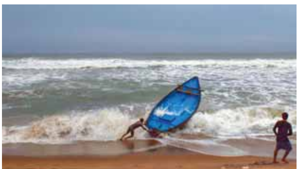
Fishermen try to control their boat amid rough sea ahead of the landfall of Cyclone Amphan at Puri beach on Tuesday

As it rumbled over the Bay of Bengal 510 km off the Digha coast in West Bengal, likely charting a north-northeastward course, the two States were on high alert. At least three lakh people have been evacuated from coastal areas and all steps have been taken to deal with any eventuality arising out of Amphan, Chief