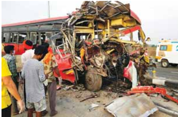
Locals and policemen stand near the mangled remains of a bus which collided with a stationary truck in Yavatmal district of Maharashtra on Tuesday

A report submitted to the Centre by a road safety organisation has shown that 180 migrants lost their lives in road accidents which left 694