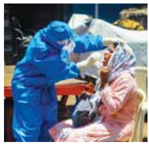
A healthcare worker collects swab sample of a Gandhi Maidan resident for Covid-19 test at Dharavi slum area in Mumbai on Tuesday

The data crunching also reveals while some States have taken the testing protocol very