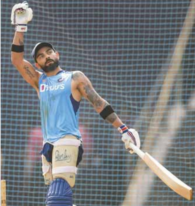
Virat Kohli bats during India's nets session