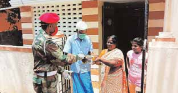
The DBA launched a Whats App messaging system and reached the retired soldiers, war widows and those above 70 years of age in particular to enquire about their needs and well being

This time around, their fight is against coronavirus. Since the civilians in these States are well served by the respective Governments, the DBA, more popular by its name Southern Command, took up another challenge. The Army establishment through its words and deeds sent a message to the retired soldiers, officers, war widows in these States that they were not alone in this world and the soldiers and officers respect and adore them