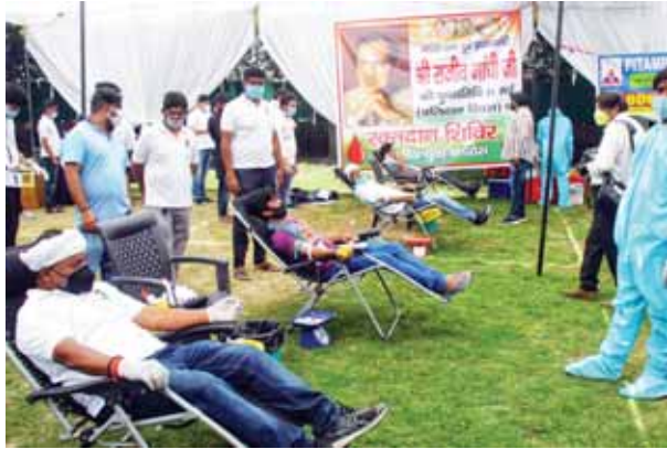
Youth Congressworkers donate blood on the death anniversary of former Prime Minister Rajiv Gandhi at IYC headquarters in New Delhi on Thursday