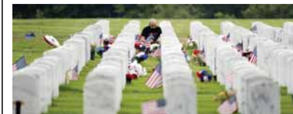
A man visits a gravesite at Fort Sam Houston National Cemetery in San Antonio on Thursday