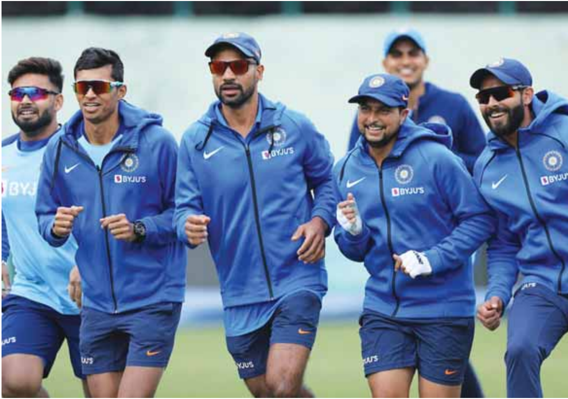
India players train at HPCA stadium in Dharamsala on the eve of first ODI of three match series in March 2020. The series was later cancelled due to coronavirus pandemic

BCCI agreeing to this bilateral series will also mean that they will have CSA's support if they want to organise the cash-rich IPL in October-November