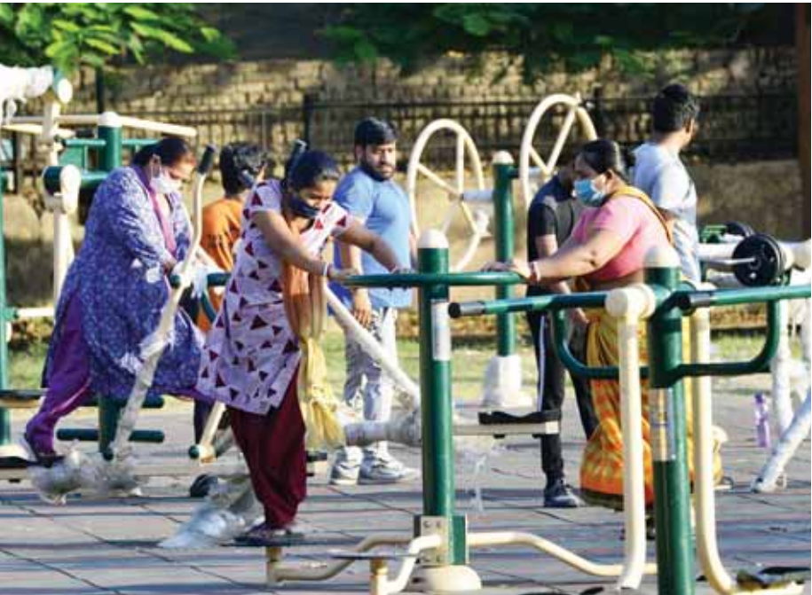
Morning walkers exercise at an open gymnasium in a park during the ongoing lockdown in New Delhi on Thursday

An order had been issued by the Delhi government directing for publicising the web link epass.Jantasamavad.Org among the stranded migrants for registering on the Government portal. PTI