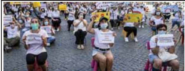
Nursery teachers stage a protest in Rome on Thursday. Nurseries teachers and owners, facing a serious crisis following the country's lockdown due to the Covid-19, are asking authorities for financial help