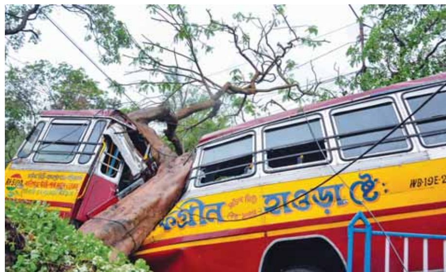
Mangled remains of a bus after a tree fell on it during Cyclone Amphan in Kolkata on Thursday

Last time Bengal witnessed a natural calamity as dreadfully ruinous as Amphan was two years before Nadir Shah attacked Delhi and 20 years before Robert Clive humbled