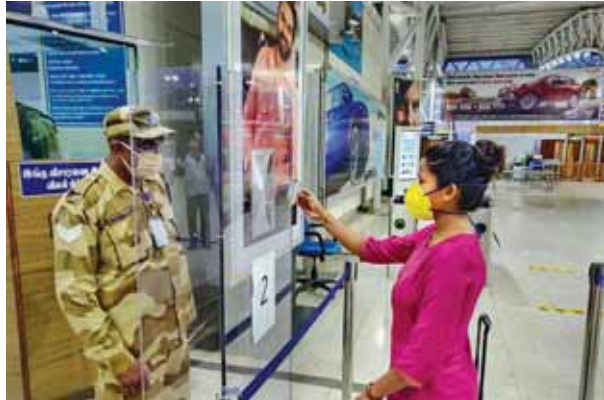
Preparations underway at the Chennai airport for a calibrated resumption of flights from May 25, as announced by the Civil Aviation Minister Hardeep Singh Puri

structures, the Minister said that flight durations have been divided in 7 categories — 0-30 minutes, 30-60 minutes, 60-90 minutes, 90-120 minutes, 120-150 minutes, 150-180 minutes, and 180-210 minutes.