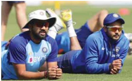
Rohit Sharma & Manish Pandey watch other players train during nets

“But in red-ball cricket, whether you are a fast bowler or spinner, you need to shine the ball. Spinner relies on shine to drift the ball. That will be a big advantage for batsman. The game will become even more batsmen friendly,” said the first Indian pacer to take a Test hat-trick.