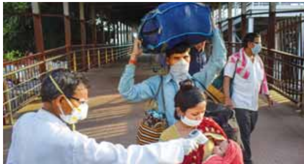
Migrants undergo thermal screening after arriving from Bhubaneswar via special train to reach their native places at Prayagraj railway station on Sunday.

the city numbered 1,665 with 180 deaths.