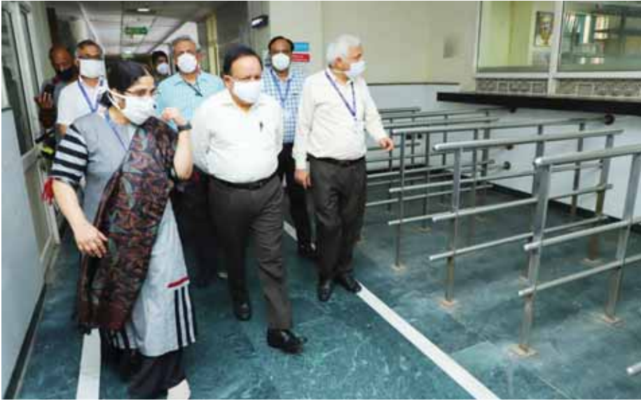
Union Health Minister Dr Harsh Vardhan visits Chaudhary Brahma Prakash Ayurved Charak Sansthan, Delhi, which is functioning as a dedicated Covid Health Centre (DCHC), to oversee the preparedness to manage Covid-19 cases. He visited the various facilities and wards and witnessed first-hand the treatment being provided to Covid-19 patients, through a holistic approach as per the directions of Ministry of AYUSH

Indian seafarers and crew working in foreign firms would also be allowed to travel.