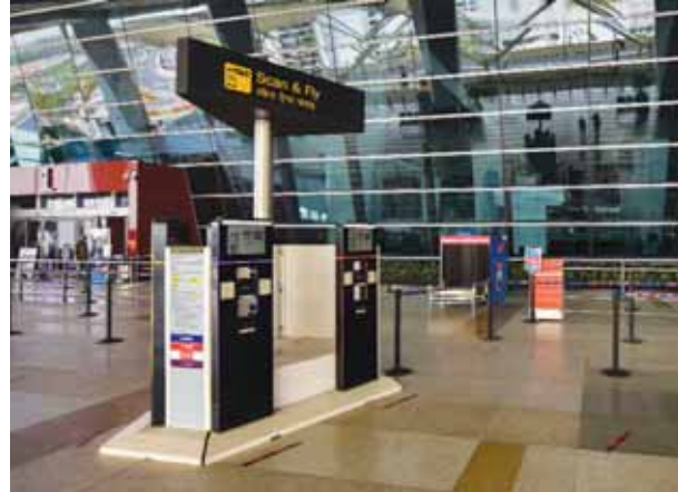
A view of 'Scan &amp; Fly' kiosk outside T3 departure gate of Indira Gandhi International Airport in New Delhi on Sunday.

Maha allows only 10% flights from Mumbai from today; air travel in Bengal from May 28