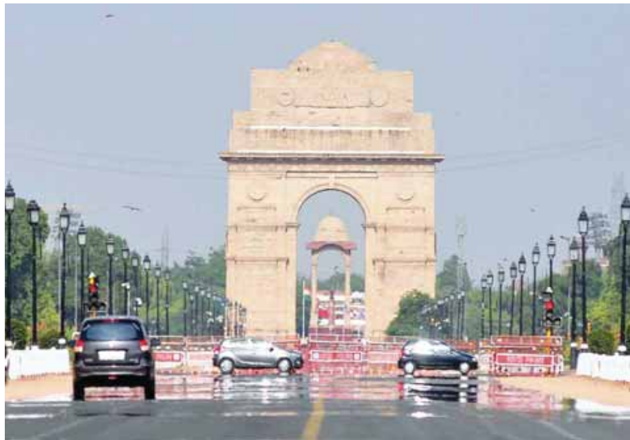
A mirage appears on India Gate as mercury soars in the national Capital on Sunday