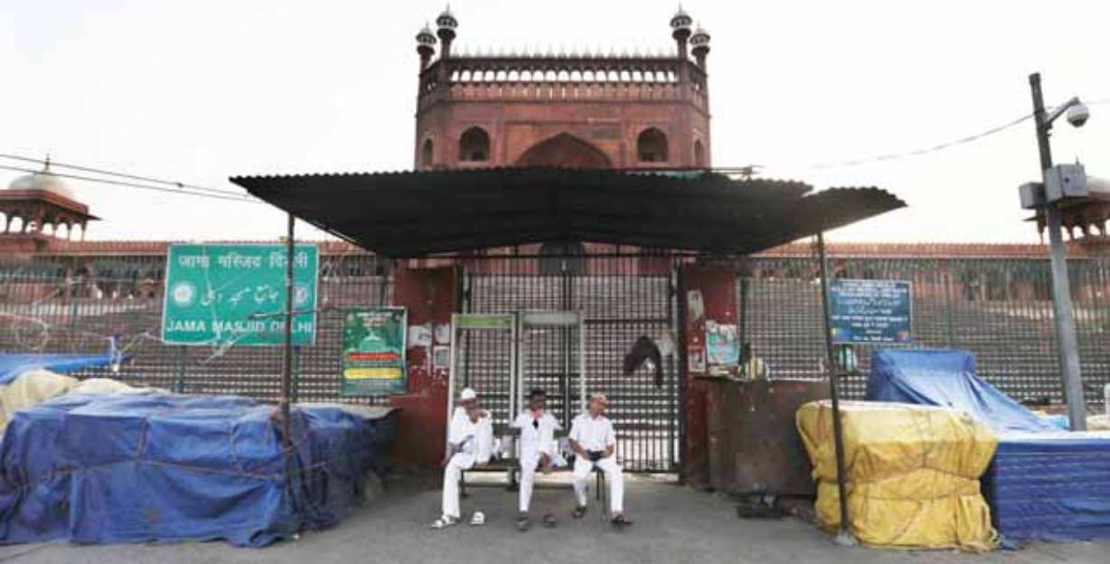
People sit in front of closed Jama Masjid on the eve of Eid al-Fitr at the old quarters of New Delhi on Sunday