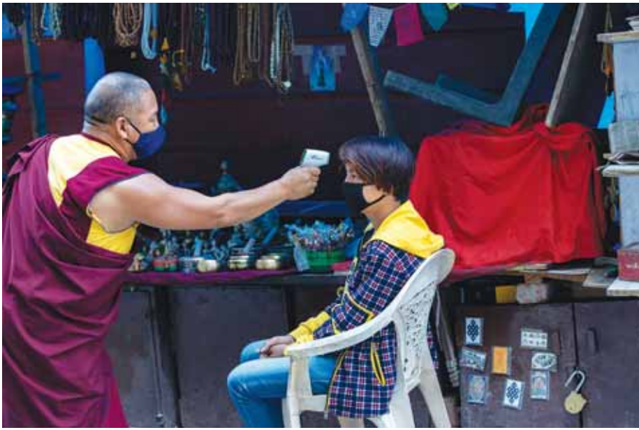
A monk uses a digital probe thermometer to measure the body temperature of a roadside vendor in Dharmasala on Sunday.

Various studies conducted across the globe have shown that only a fraction of the infection and fatalities are being detected due to inadequate testing. This means the number of people who have been quarantined is far less than those out in the streets or filling up work places and spreading the virus. These undetected "carriers" may be the single biggest hurdle in preventing the spread of coronavirus, more so in India, where testing has