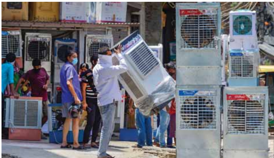
People purchase air coolers on a hot summer day in New Delhi on Sunday