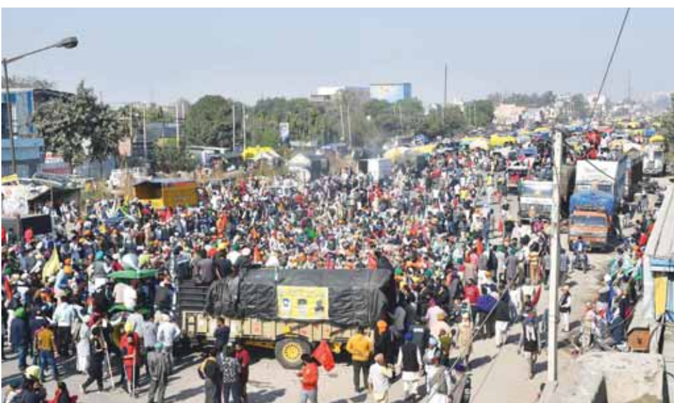
Farmers gather at the Singhu border as part of their Delhi Chalo protest against Centres new farm laws in New Delhi on Saturday