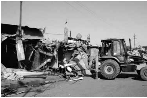
Bhopal Municipal Corporation employees demolish illegal constructions at railway station during an anti-encroachment drive in Bhopal on Saturday.

Over 500 policemen were deployed in the action to raze shops made on encroached