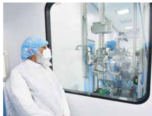
Prime Minister Narendra Modi visits the Zydus Biotech Park to review the development of Covid-19 vaccine, in Ahmedabad on Saturday

went around the place and interacted with the team of scientists behind the ongoing vaccine development effort "to know more about the indigenous DNA based vaccine being developed there". Zydus Cadila is developing its Covid-19 vaccine candidate ZyCoV-D.