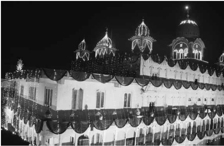
Gurudwara Nanaksar decorated with lightings ahead of the Guru Nanakdev Jayanti, in Bhopal on Saturday