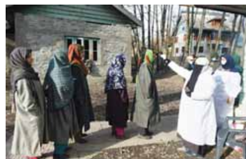
Voters undergo thermal screening as they arrive to cast their votes for the first phase of District Development Council elections at Hariganiwan area of Gund in Ganderbal district of central Kashmir on Saturday

The other highlight of the polls was healthy participation of the Pakistani refugees and women electorate in large numbers. The Pak refugees were deprived of their voting rights as long as J&K enjoyed