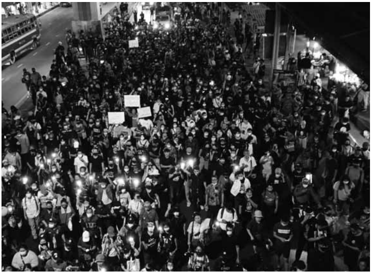
A crowd of protesters march in Bangkok, Thailand, on Saturday. Pro-democracy demonstrators are continuing their protests calling for the Government to step down and reforms to the constitution and the monarchy, despite legal charges being filed against them and the possibility of violence from their opponents or a military crackdown