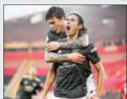
Manchester United's Edinson Cavani celebrates with Victor Lindelof after scoring Utd's second goal against Southampton at St Mary's stadium on Sunday