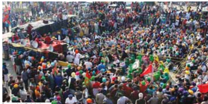
Farmers protest at Singhu border during their Delhi Chalo march against the Centre's farm reform laws, in New Delhi on Sunday

The Home Ministry too assured the farmers' organisations that a high-level team of Union Ministers will talk to them once the protesters move to the designated site. A meeting of over 30 farmer groups was held to discuss Shah's offer for talks before the scheduled