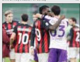
AC Milan's Franck Kessie, left and Fiorentina's Patrick Cutrone embrace at the end of the Serie A match at the San Siro