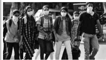
PNS ■ NEW DELHI

Days after the Union Health Minister advised the States and Union Territories to reopen medical colleges, the National Medical Commission (NMC) has issued guidelines to the education institutions enlisting do's and don'ts to ensure safety of the staff and students from Covid-19 infection. It has also asked the colleges administration to take extra care of the anxiety, mental health and psychological issues of students developed during the lockdown period and fear of infection after the opening of the campuses. The colleges have also been asked to set up helplines for mental health, psychological concerns and well-being of students in their campus which "need to be regularly monitored by Counsellors and