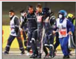
Haas driver Romain Grosjean is helped by medical staff after he crashed his car during the F1 race in Bahrain International Circuit in Sakhir on Sunday