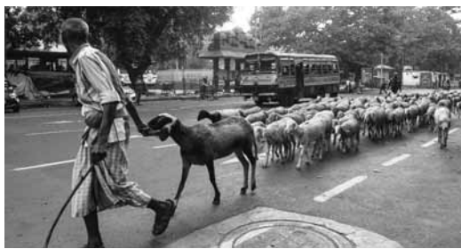
A man leads his herd of sheep on a road in Kolkata on Sunday

Two BSF jawans, one policeman and two children, aged eight and 10, are among the newly infected people, he said.