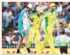
David Warner leaves the field after injury

Warner hobbled off the field after he struggled to get up following a dive in the fourth over of the Indian innings. A car waited outside the Sydney Cricket Ground to take the