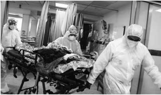
PNS ■ NEW DELHI

In just three months after crossing the 20 lakh mark on August 7, India has added whopping 70 lakhs Covid-19 cases, taking the infection tally to nearly touch 94 lakh on Sunday while the number of people who have recuperated from the disease crossed 88 lakh pushing the national recovery rate to 93.71 per cent. The total coronavirus cases mounted to 93,92,919 with 41,810 new infections being reported in a day, while the death toll climbed to 1,36,696 with 496 new fatalities, the data updated at 8 am showed. The active Covid-19 case-load remained below 5 lakh for