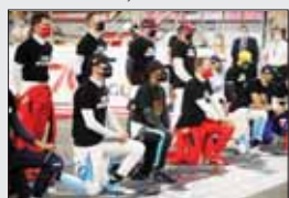
Mercedes driver Lewis Hamilton, centre, and Ferrari driver Sebastian Vettel, right, take the knee in support of the Black Lives Matter campaign and End Racism Recognition event ahead of the Bahrain F1 Grand Prix