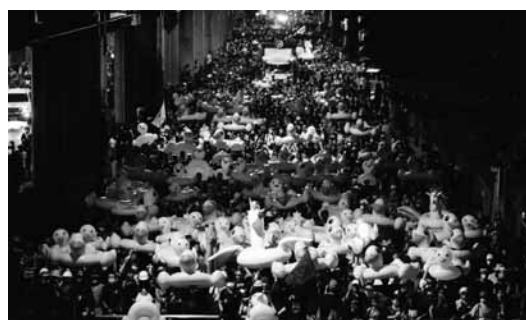
Protesters carry inflatable yellow ducks, which have become good-humored symbols of resistance during anti-government rallies, while marching towards the base of the 11th Infantry Regiment, a palace security unit under direct command of the Thai king, on Sunday.

The protesters believe that the army undermines democracy in Thailand, and that King Maha Vajiralongkorn wields too much power and