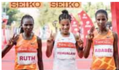
Womens elite category Gold Medalist Ethiopian Yalemzerf Yehualaw (C) flanked by Silver Medalist Kenyan Ruth Chepngetich (L) and Bronze Medalist Ethiopian Ababel Yeshaneh (R)