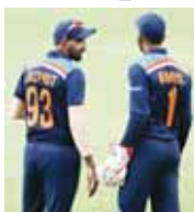
KL Rahul speaking to the media

"I would not agree when you say they are struggling. It's different conditions, different format. It's