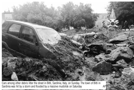
Cars among other debris litter the street in Bitti, Sardinia, Italy, on Sunday. The town of Bitti in Sardinia was hit by a storm and flooded by a massive mudslide on Saturday.

The bureau "did not remove the structure which is considered private property," it said in a statement. AFP