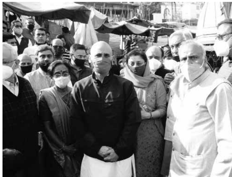
BJP MP Rita Bahuguna Joshi, former Uttarakhand CM Vijay Bahuguna and other family members in Haridwar where they had arrived on Saturday to immerse the ashes of Joshi's granddaughter who expired recently after accidentally sustaining severe burn injuries