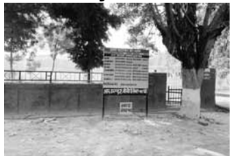
Noida Sector 48 park in question

Noida: With the increase in the number of corona patients in the capital of the country, strict restrictions have also been imposed on the events organised there. The people of Delhi have now started organising marriages in Noida in Uttar Pradesh instead of Delhi.