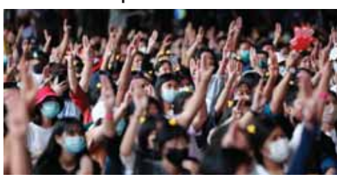
A crowd flashes the three-finger protest gesture during a student rally in Bangkok Saturday

Bangkok: Secondary school students in Thailand's capital rallied Saturday for educational and political reforms, defying government threats to crack down with legal action against the country's high-profile protest movement.