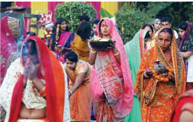
Devotees offer prayers to the rising sun on the occasion of Chhath Puja in New Delhi on Saturday

"On the way, when he stopped the car near a traffic signal, the accused, who also came in a taxi, forcibly entered the car. They evicted the driver and the woman passenger and fled with the vehicle," said the DCP.