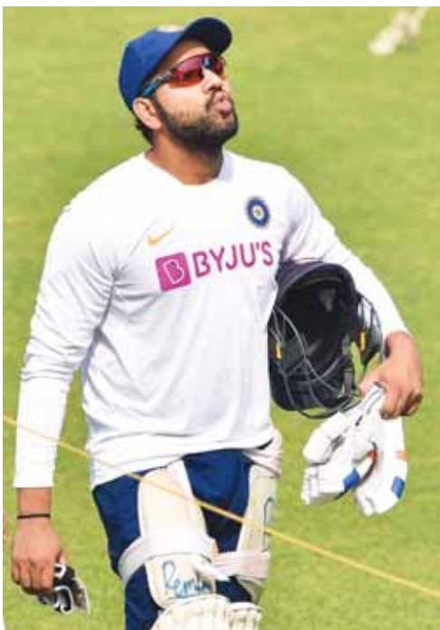
Indian opener Rohit Sharma

He hit a match-winning knock of 68 off 50 balls in the IPL final against Delhi Capitals, playing through pain. Rohit is currently doing strength and conditioning work at the National Cricket Academy in Bengaluru before heading to Australia.