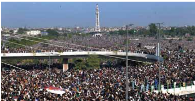
Mourners gather for the funeral prayer of Khadim Hussein Rizvi, an Islamist scholar and leader of Tehreek-e-Labbaik Pakistan, in Lahore on Saturday

According to the report released on Thursday, there is "credible information" that at least 19 serving and former Australian special forces allegedly committed up to 39 unlawful murders during the conflict in Afghanistan. PTI