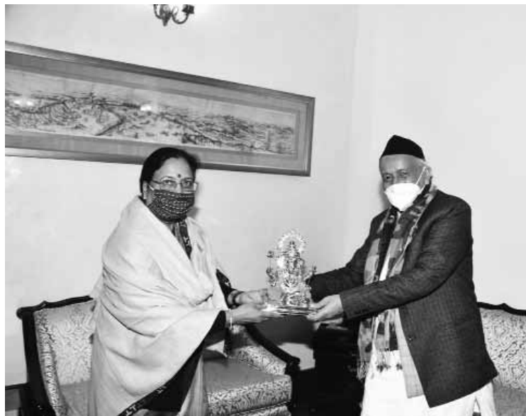
Maharashtra Governor Bhagat Singh Koshiyari meets Uttarakhand Governor Baby Rani Maurya during a courtesy visit to Raj Bhawan in Dehradun on Saturday