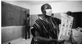
Election officials count the ballots in at a polling station in Ouagadougou, Burkina Faso, for the presidential and legislative elections late on Sunday

While the vote were not reported incidents of major attacks, threats of violence prevented people from casting ballots in hard-hit parts of the country, in the North, Sahel and East regions. Nearly 3,000 polling stations out of 335 didn't open, according to a report from CODEL, a local