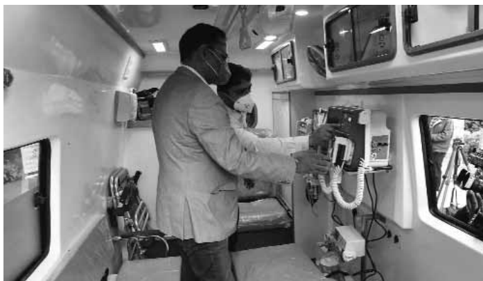
Delhi Health Minister Satyendar Jain inspects the ambulance donated by BSES to GB Pant, GTB and LBS hospital part of its social responsibility, during handing over ceremony at Delhi Secretariat