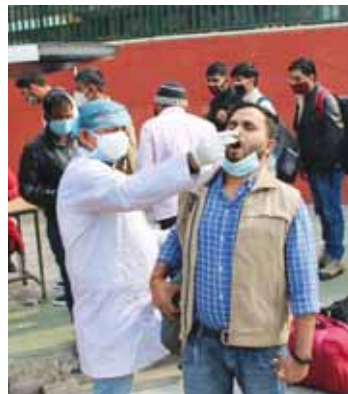
A health worker collects samples from a passenger for the Covid-19 test, as coronavirus cases surge across Delhi, at ISBT Kashmere Gate in New Delhi on Monday

"After Delhi and Maharashtra situation in Gujarat has also worsened. What is that you are allowing marriage celebration during day time? You file an affidavit of the status report on steps taken as on date," the SC said.