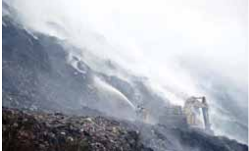
Firefighters attempt to douse a blaze at the Ghazipur landfill site in New Delhi on Wednesday

"The AQI is forecasted to improve towards 'very poor' category by tomorrow and likely stay in the lower end of Very Poor on November 27 and 28," SAFAR said.