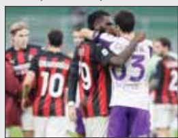
AC Milan's Franck Kessie, left and Fiorentina's Patrick Cutrone embrace at the end of the Serie A match at the San Siro