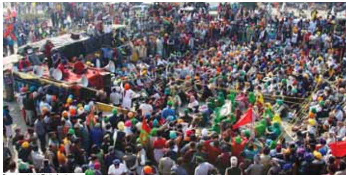
Farmers protest at Singhu border during their Delhi Chalo march against the Centre's farm reform laws, in New Delhi on Sunday

The Home Ministry too assured the farmers' organisations that a high-level team of Union Ministers will talk to them once the protesters move to the designated site. A meeting of over 30 farmer groups was held to discuss Shah's offer for talks before the scheduled date of December 3 once they