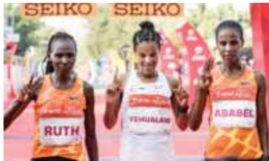
Women's elite category Gold Medalist Ethiopian Yalemzerf Yehualaw (C) flanked by Silver Medalist Kenyan Ruth Chepngetich (L) and Bronze Medalist Ethiopian Ababel Yeshaneh