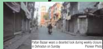
Patali Bazaar wears a deserted look during weekly closure in Dehradun on Sunday.