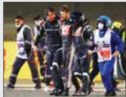
Haas driver Romain Grosjean is helped by medical staff after he crashed his car during the F1 race in Bahrain International Circuit in Sakhir on Sunday