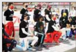
Mercedes driver Lewis Hamilton, centre, and Ferrari driver Sebastian Vettel, right, take the knee in support of the Black Lives Matter campaign and End Racism Recognition event ahead of the Bahrain F1 Grand Prix