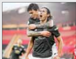
Manchester United's Edinson Cavani celebrates with Victor Lindelof after scoring Utd's second goal against Southampton at the St Mary's stadium on Sunday