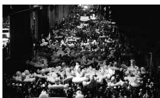
Protesters carry inflatable yellow ducks, which have become good-humored symbols of resistance during anti-government rallies, while marching towards the base of the 11th Infantry Regiment, a palace security unit under direct command of the Thai king, on Sunday.

The protesters believe that the army undermines democracy in Thailand, and that King Maha Vajiralongkorn wields too much power and