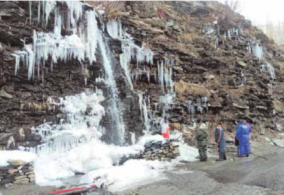
Tourists visit a water stream frozen due to drop in the temperature at Nursery near Sissu in Lahaul-Spiti district on Saturday PTI

used as a tool or an excuse to interfere in democratic processes,” the Srinagar MP said. The PAGD president’s letter comes amid allegations by the Valley’s major political parties, including the NC and the Peoples Democratic Party, of not having a level-playing field for the polls. The parties have accused the administration of locking up their candidates in accommodations at several places and not allowing them to campaign. The DDC polls will be held in eight phases beginning November 28 and ends on December 24. The PAGD is an alliance of several political parties seeking the restoration of Jammu and Kashmir’s special status abrogated by the Centre in August last year. PTI