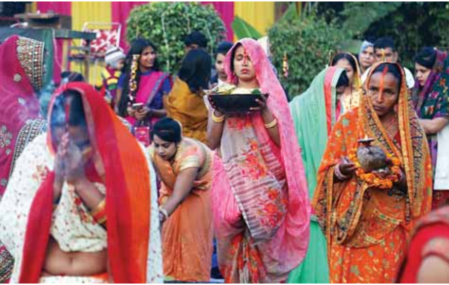
Devotees offer prayers to the rising sun on the occasion of Chhath Puja in New Delhi on Saturday

"On the way, when he stopped the car near a traffic signal, the accused, who also came in a taxi, forcibly entered the car. They evicted the driver and the woman passenger and fled with the vehicle," said the DCP.