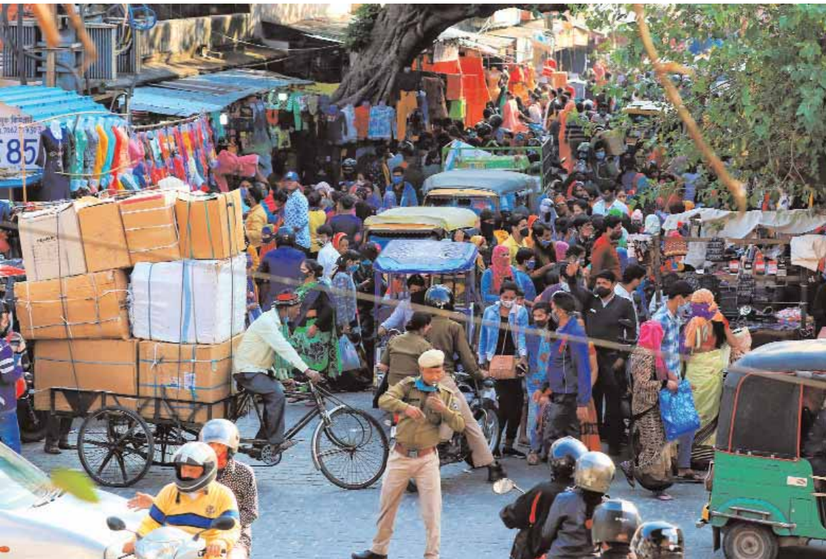
Crowd at Chandpole Bazar amid rise in the Covid-19 cases in Jaipur on Saturday