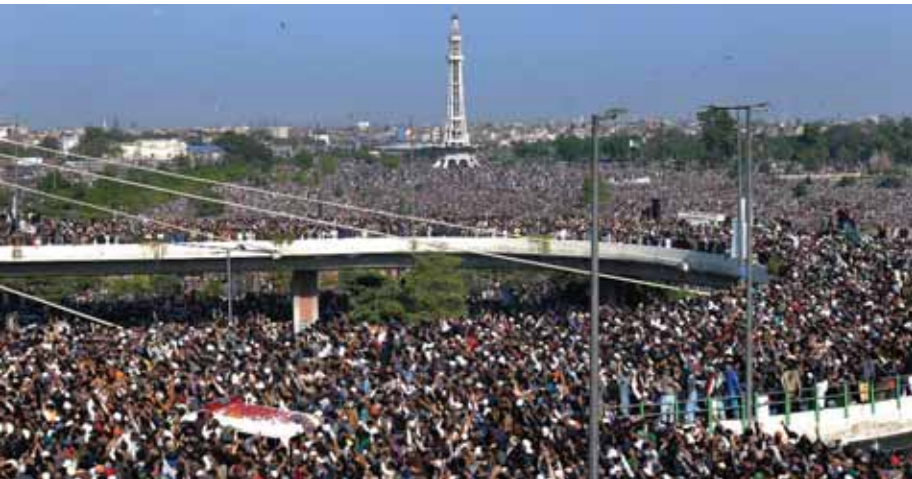
Mourners gather for the funeral prayer of Khadim Hussein Rizvi, an Islamist scholar and leader of Tehreek-e-Labbaik Pakistan, in Lahore on Saturday

According to the report released on Thursday, there is "credible information" that at least 19 serving and former Australian special forces allegedly committed up to 39 unlawful murders during the conflict in Afghanistan.