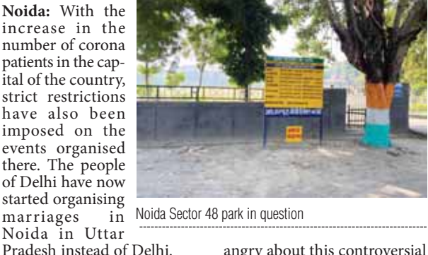
Noida Sector 48 park in question