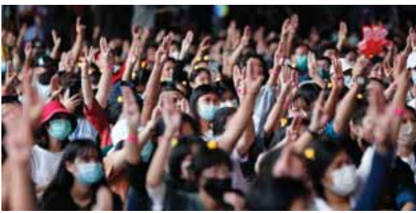
A crowd flashes the three-finger protest gesture during a student rally in Bangkok Saturday

"Our preference would have been that with the conditions improving, this should have taken place," Acting US Defense Secretary Christopher Miller announced that Washington would reduce troop levels in Iraq and Afghanistan by mid-January, in line with President Donald Trump's pledge to bring US forces home.