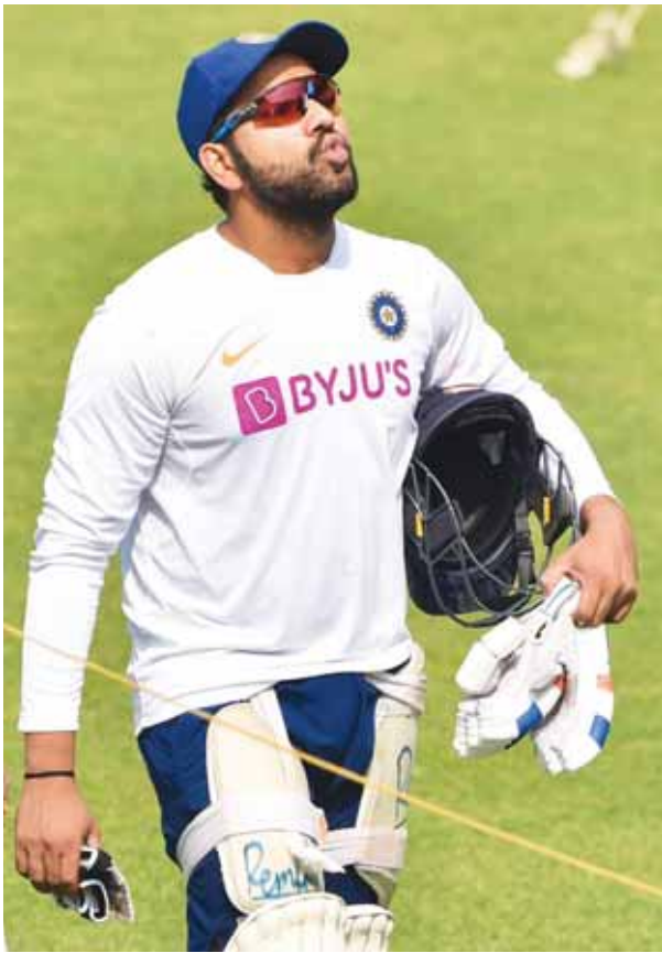
Indian opener Rohit Sharma

He hit a match-winning knock of 68 off 50 balls in the IPL final against Delhi Capitals, playing through pain. Rohit is currently doing strength and conditioning work at the National Cricket Academy in Bengaluru before heading to Australia.