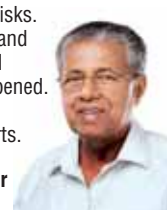
Kerala Chief Minister —Pinarayi Vijayan

We cannot take any risks. We still have to wait and see when educational institutions can be opened. We will take up the matter with the experts.