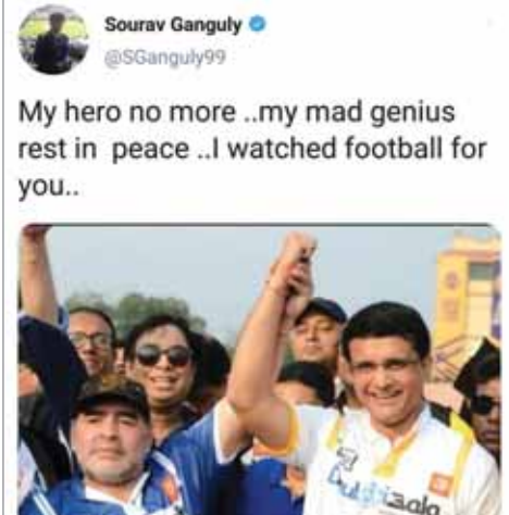
Footballers Lionel Messi, Cristiano Ronaldo, BCCI President & former cricketer Sourav Ganguly paid tribute to Diego Maradona on social media after his death on Wednesday