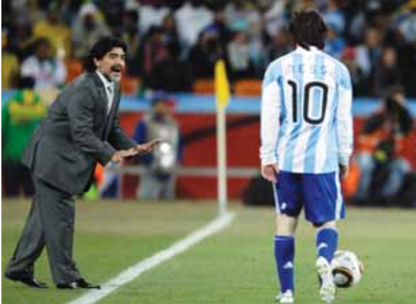
In this June 27, 2010 file photo, Argentina head coach Diego Maradona, left, gives instructions to Argentina's Lionel Messi during the World Cup round of 16 football match between Argentina and Mexico at Soccer City in Johannesburg