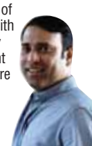
Former cricketer —VVS Laxman

I remember missing a couple of Ranji Trophy matches to be with my wife for the delivery of my daughter. It is a very important feeling, especially when you are going to get your first child.