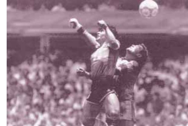
In this June 22, 1986 file photo, Argentina's Diego Maradona, left, beats England's goalkeeper Peter Shilton to a high ball and scores his first of two goals at the World Cup quarterfinal match in Mexico City. This was the day of the "Hand of God," when Maradona used his left fist to knock a ball past England's Shilton