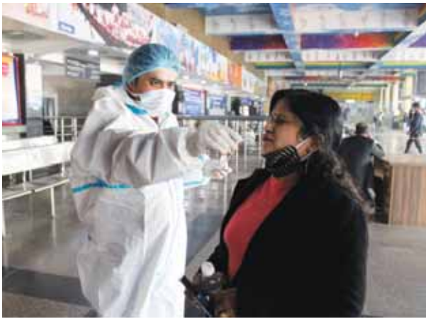
A health worker collects swab samples of a passenger at New Delhi railway station on Wednesday

The MHA's new directions, titled as 'Guidelines for Surveillance, Containment and