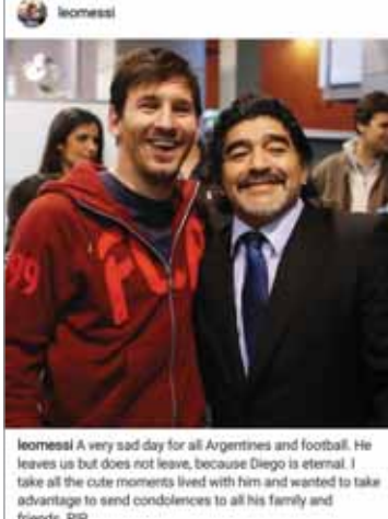
Footballers Lionel Messi, Cristiano Ronaldo, BCCI President & former cricketer Sourav Ganguly paid tribute to Diego Maradona on social media after his death on Wednesday