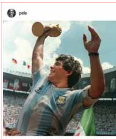
Sad news today. I have lost a dear friend, and the world has lost a legend. There is much more to say, but for now may God give his family strength. One day, I hope, we will play soccer together in the sky. Brazilian football icon Pele hoped he would "some day play ball with Maradona in the sky" as he paid tribute to Diego Maradona after his death

alongside Pele. "Maradona inspires us," said then-Argentina striker Carlos Tevez, explaining his country's everyman fascination with Maradona at the 2006 World Cup in Germany. "He's our idol, and an idol for the people." Maradona reaped titles at home and abroad, playing in the early 1980s for Argentinos Juniors and Boca Juniors before moving on to Spanish and Italian clubs. His crowning achievement came at the 1986 World Cup, captaining Argentina in its 3-2 win over West Germany in the final and decisive in a 2-1 victory against England in a feisty quarterfinal match. Over the protests of England goalkeeper Peter Shilton, the referee let stand a goal by Maradona in which, as he admitted years later, he intentionally hit the ball with his hand in "a bit of mischief." But Maradona's impact wouldn't be confined to cheating. Four minutes later, he spectacularly weaved past four opponents from midfield to beat Shilton for what FIFA later declared the greatest goal in World Cup history. Many Argentines saw the match as revenge for their country's loss to Britain in the 1982 war over the Falkland Islands, which Argentines still claim as "Las Malvinas."