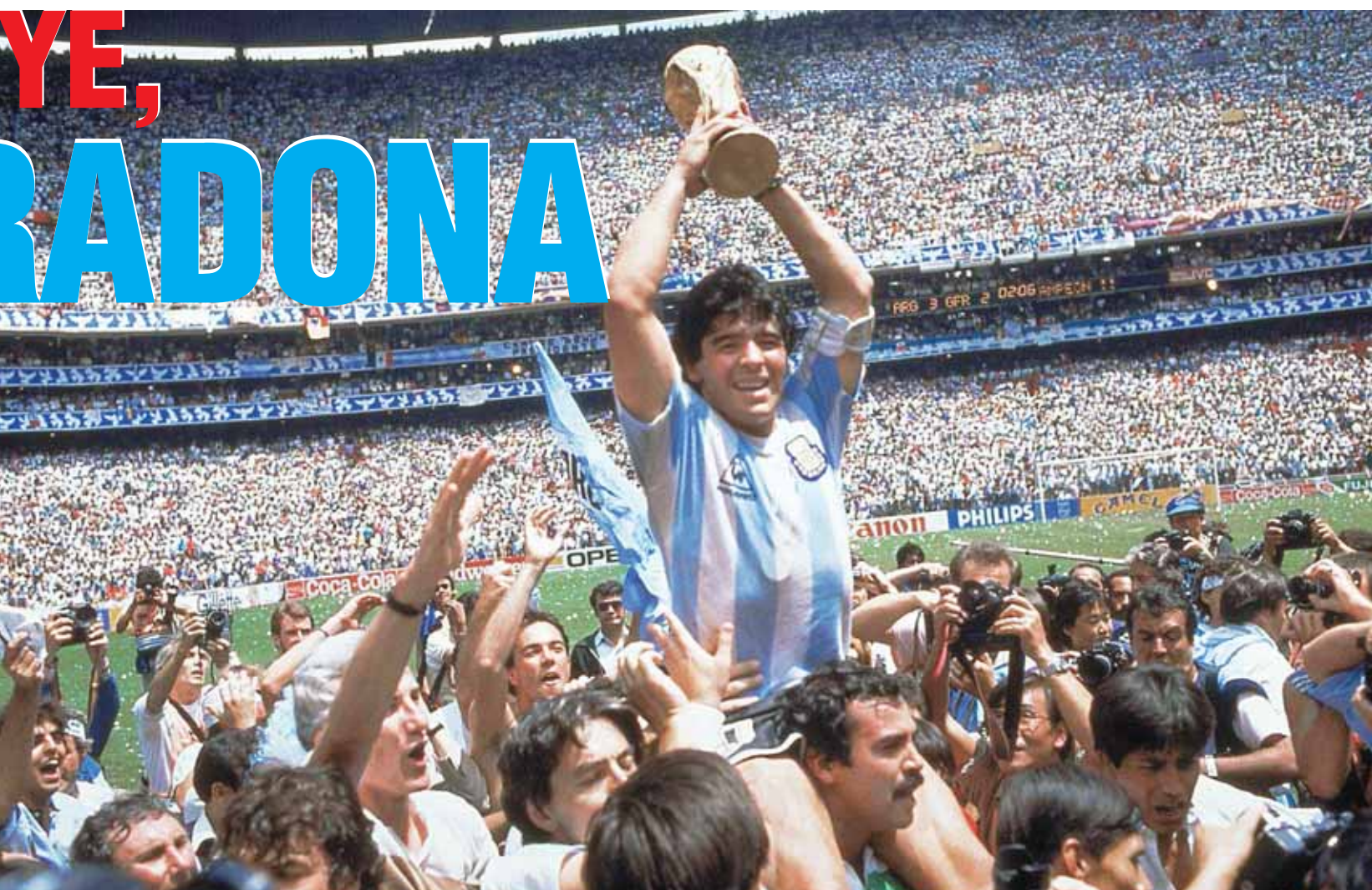
In this June 29, 1986 file photo, Diego Maradona holds up FIFA World Cup trophy after Argentina's 3-2 victory over West Germany in the final match at Atzeza Stadium in Mexico City