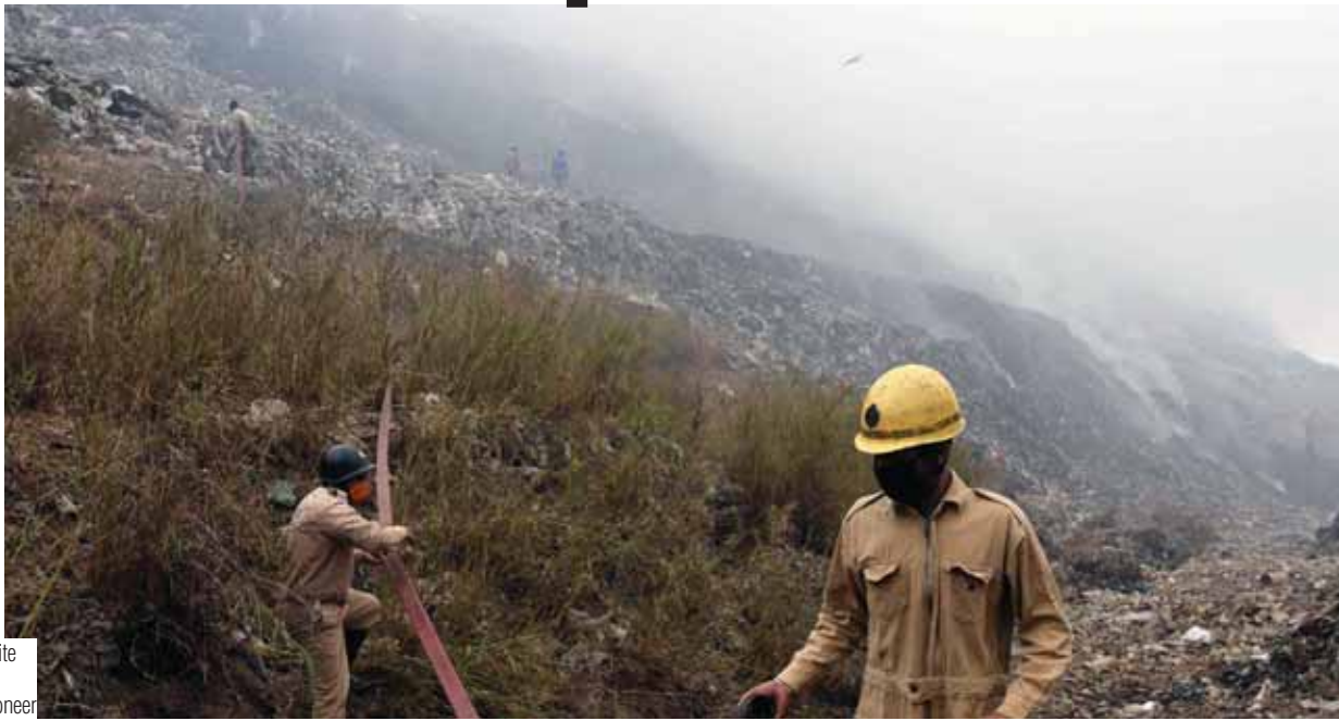
Smoke billows from the Ghazipur landfill site after a fire in New Delhi on Wednesday

A senior EDMC official said that the fire erupted early in the morning and spread over a large area. "There may be several reasons for fire at the landfill site. Landfill fires are caused by wet waste rotting and decomposing material such as plastic and other materials, leading to methane formation, which is a greenhouse gas and flammable and often leads to fires," he said.