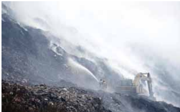
Firefighters attempt to douse a blaze at the Ghazipur landfill site in New Delhi on Wednesday

"The AQI is forecasted to improve towards 'very poor' category by tomorrow and likely stay in the lower end of Very Poor on November 27 and 28," SAFAR said.