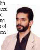
Actor —Angad Bedi

I share a special bond with Mumbai. I have experienced failure way more than the success that I am enjoying now. Perhaps that is one of the reasons I value success!