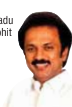
DMK President —MK Stalin

I am satisfied with the discussions with Tamil Nadu Governor Banwarilal Purohit on the issue of release of former Prime Minister Rajiv Gandhi's assassins.