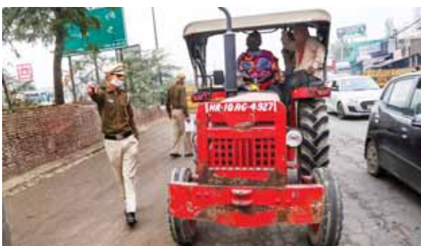
Police personnel check vehicles at Singhu border ahead of the scheduled farmers' protest march to Delhi on Nov 26-27 against the Centre's new farm laws in New Delhi on Wednesday

The scuffle between the farmers and the police broke out at the Shambhu border near Ambala city when the farmers broke the blockades