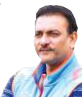
Head coach, Team India —Ravi Shastri

Virat Kohli will be missed. But like I say, in adversity comes opportunity. There are a lot of young guys on the side and it's an opportunity for them.