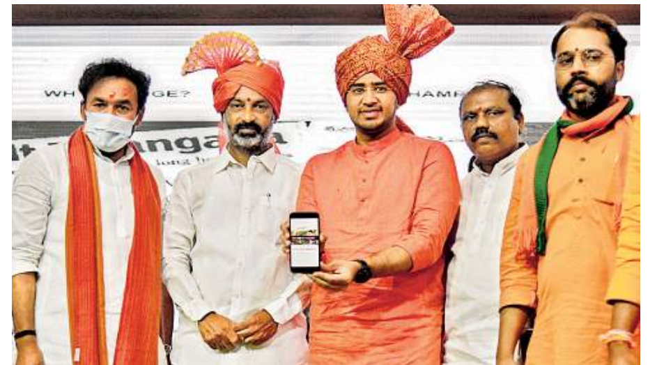
BJP youth wing president Tejaswi Surya launches the 'Change Hyderabad' campaign in Hyderabad on Monday

In BJP, an ordinary worker like him can become a national leader, he said.