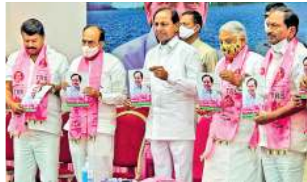
Chief Minister K Chandrasekhar Rao releases the TRS manifesto for the GHMC elections in the presence of the party senior leaders in Hyderabad on Monday.

"Hyderabad will collapse, real estate will be hit and land prices will crash if communal forces rule the city," the Chief Minister said, releasing the manifesto at Telangana Bhavan, the party headquarters here.