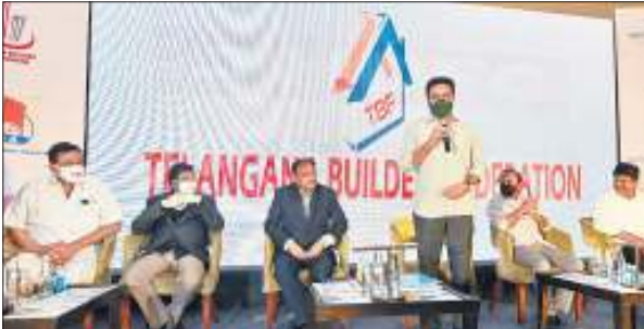
IT Minister KT Rama Rao addressing the Telangana Builders Federation annual meeting in the city on Monday

Pointing to the charge-sheet released by BJP, KTR said that an FIR should be filed against the center for not releasing funds even after Chief Minister K Chandrashekar Rao sought Rs1,300 crore as immediate relief. Addressing the Telangana Builders Federation (TBF) annual meeting, KTR raked up the Amaravati issue. He said, "Let alone Hyderabad, what has BJP given to Andhra Pradesh and Amaravati? Only mud and water were given to Amaravati by the Center." He said that Prime Minister Narendra Modi didn't