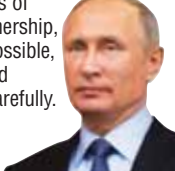
Russian President —Vladimir Putin

It is necessary to actively use the instruments of public-private partnership, to attract, where possible, extra-budgetary and borrowed funds, carefully.