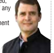
Congress leader —Rahul Gandhi

The Government of the Grand Alliance, which will be formed, won’t be the Government of any particular caste, religion or class. It will be the Government for the entire Bihar.