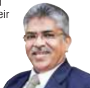
Retired High Court judge —Kemal Pasha

Education is the tool for liberation and people should give priority to educating their children. The Government policies must help in the uplift of the downtrodden.