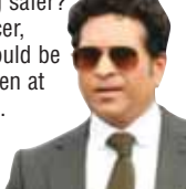
Former cricketer —Sachin Tendulkar

The game has become faster but is it getting safer? Be it a spinner or pacer, wearing a helmet should be mandatory for batsmen at the professional level.