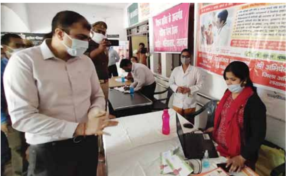
District Magistrate Abhishek Prakash pays a visit at sampoorna samadhan shivir conducted under Mission Shakti at Mailhabad tehsil on Tuesday

Besides, Women and Child Safety Organisation launched a ‘Safe City’ project under which facilities of 100 two-wheeler Pink Patrol, 10 four-wheeler Pink Patrol, 25 Pink Booths, data analytics centre at 1090, integration of 1090 with 112 and cyber forensic lab were carried out for ensuring safety and security of women.