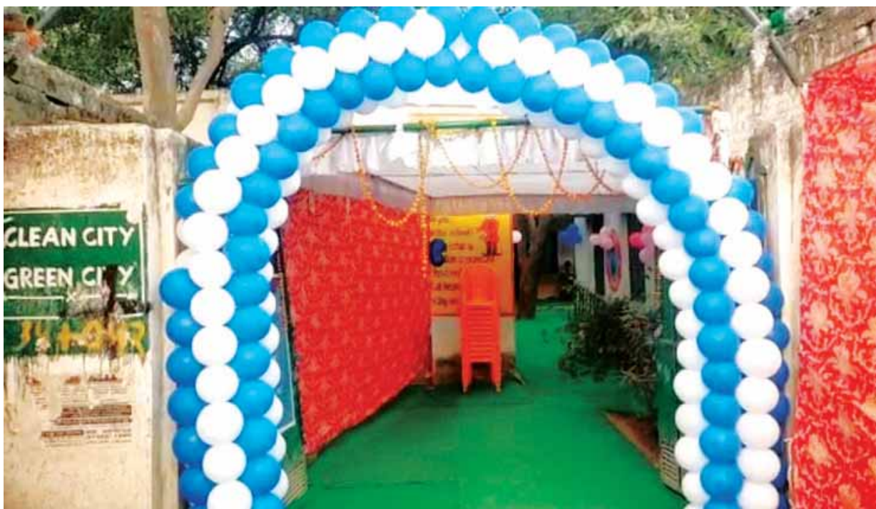
Aesthetically decorated model polling booth at Ghatampur on Tuesday.