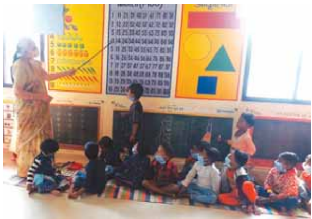
Governor Anandiben Patel teaching children at a school in Varanasi on Tuesday

During the day, she also inspected primary school at Amini in Sewapuri, selected by NITI Aayog for overall development as an ideal block where all the central and state government schemes are being implemented in all its gram sabhas. She also inspected Anganbadi centres located in these school complexes. At Matuka Anganbadi Centre, she completed the ceremony