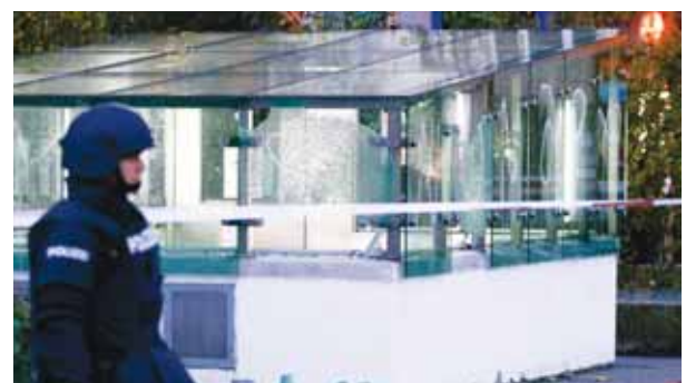
A police officer patrols in front of an entrance of a car parking with broken glasses after a shooting in Vienna, Austria, on Tuesday.

Vienna's hospital service said seven people were in life-threatening condition on Tuesday after the attack, the Austrian news agency APA