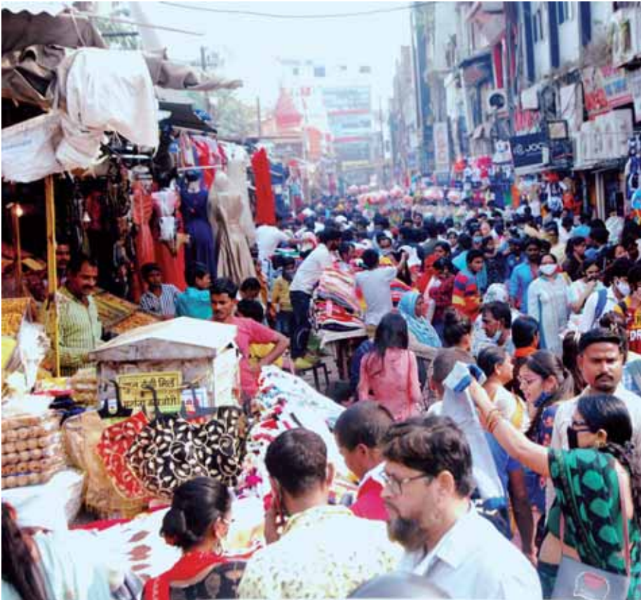
Huge crowd in Aminabad market on the eve of Karwa Chauth

sampling locations, the mean values of PM10 were above the permissible limit of 100 µg/m3 while at six out of nine, the mean PM 2.5 values exceeded the permissible limit of 60 µg/m3, as prescribed by CPCB.