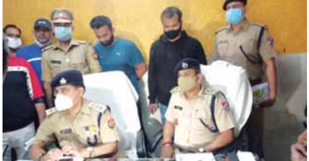
GRP officials addressing mediapersons on Tuesday.

Meanwhile, a theft in the same train on October 18 also