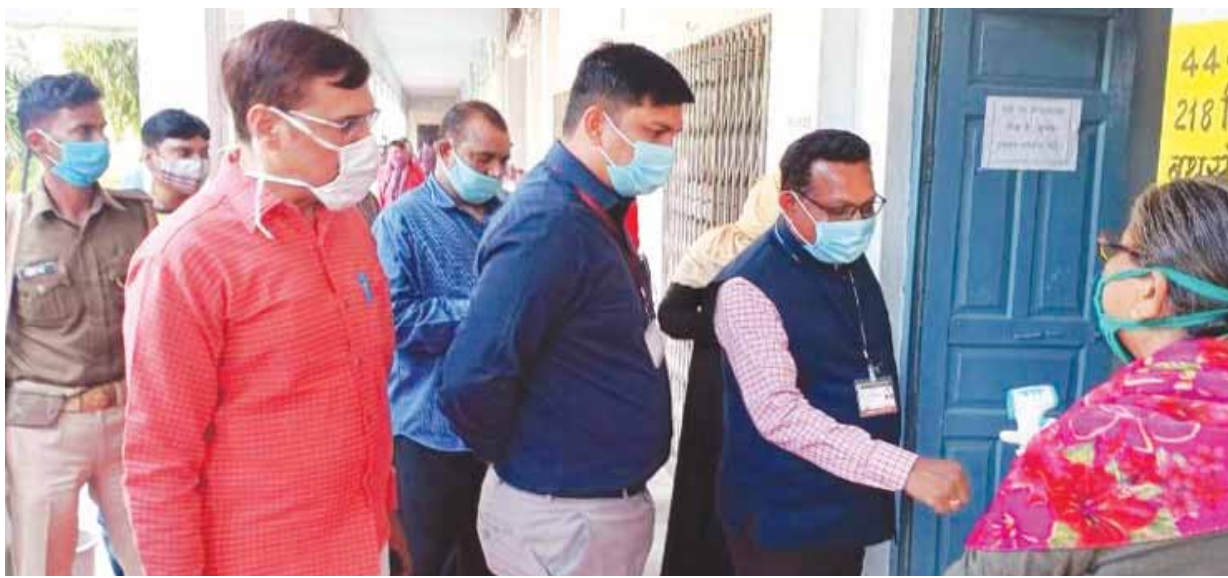
Thermal screening of electorate at Ghatampur polling booth