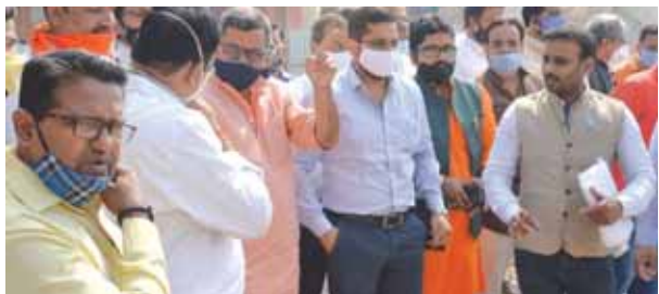
UP Minister Neelkanth Tiwari inspecting parking site at Townhall in Varanasi

Under the Smart City Yojana, the Smart Ward Yojana is being implemented in five wards which maximum areas are situated along the holy river Ganga and near Shree Kashi Vishwanath Mandir.