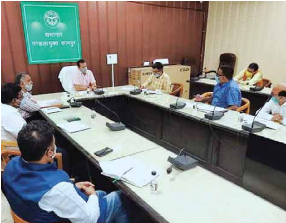
Divisional Commissioner Raj Shekhar holds meeting with officials of Food Department.

The divisional commissioner said districts like Etawah