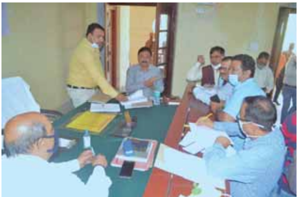
Nomination process for MLC seats going on in Varanasi on Thursday

The nomination process will continue till November 12. As per the schedule, the scrutiny of the nomination papers will be held on November 13, while the candidates can withdraw their names by