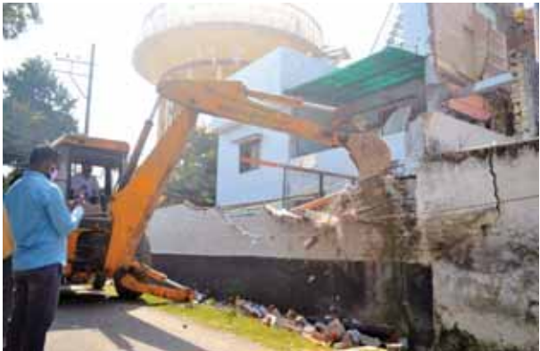
Building of close aide of Mokhtar Ansari being demolished in Varanasi on Thursday