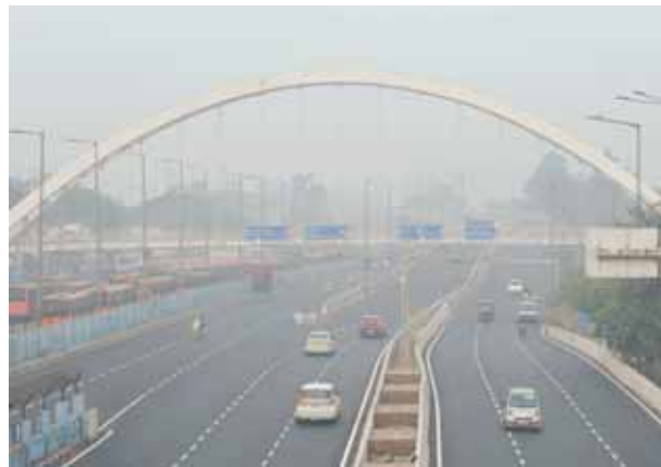
Vehicles ply amid hazy weather condition in New Delhi on Thursday

According to scientists in Ministry of Earth Sciences, raging farm fires and a fall in the wind speed and temperature pushed air quality in