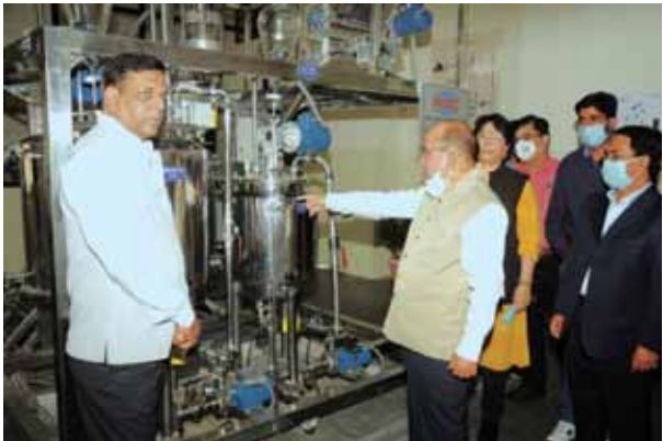
'Nano Grain based Ethanol Unit' inaugurated at NSI on Thursday.