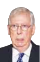
US Senator —Mitch McConnell

As I've said repeatedly in the last few months, we need another (COVID) rescue package. And we need to do it before the end of the year.