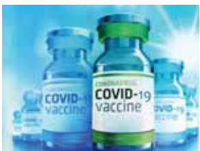
NEW DELHI

Even as strategies are being worked out towards the preparation of Covid-19 vaccine, with the shots expected to be available early next year, the Central Government has asked all the States to submit the list of health workers — doctors, MBBS students, nurses, paramedic staff and ASHA workers — in the Government and private sector who have been identified as the priority group to get the first doses.