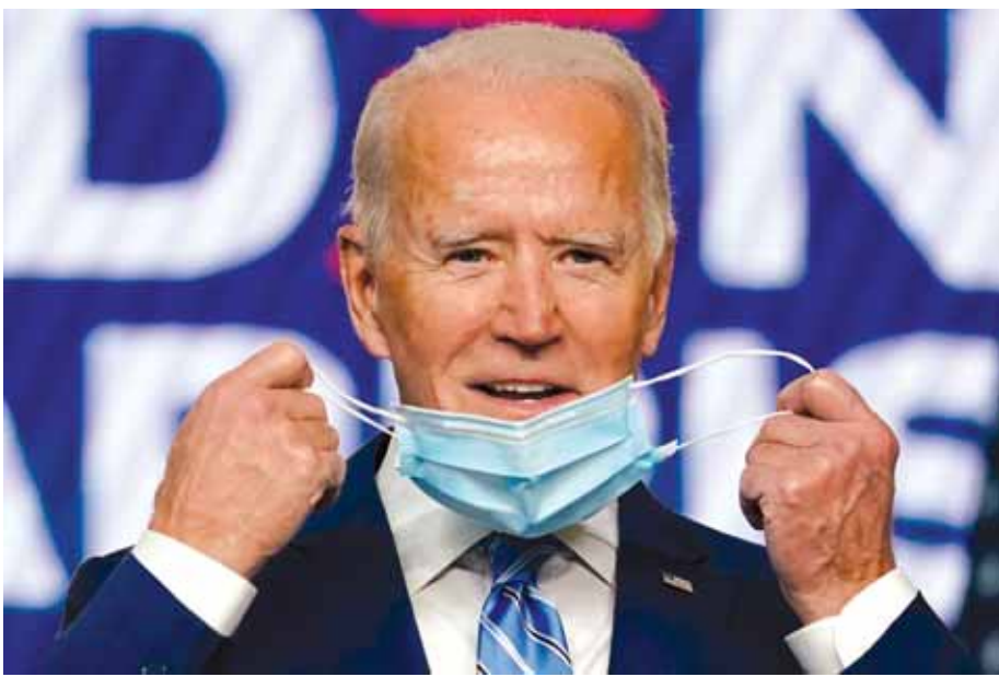
Democratic presidential candidate and former Vice-President Joe Biden takes off his face mask as he arrives to speak in Wilmington

Trump Campaign Manager Bill Stepien told