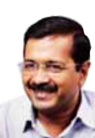
Delhi Chief Minister —Arvind Kejriwal

We will celebrate Diwali together this year as well, without burning crackers. If we burn crackers, we will be playing with the health of our children and our family.