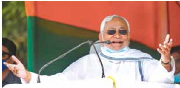
Bihar Chief Minister Nitish Kumar addresses a gathering during an election rally in Katihar on Thursday

This is for the first time that the socialist warhorse, who has ruled the state for close