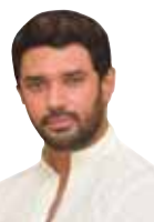
Lok Janshakti Party chief —Chirag Paswan

He (Nitish Kumar) is the most greedy person and will do anything to remain in power. He used to stand with folded hands in front of Prime Minister Narendra Modi at political rallies.