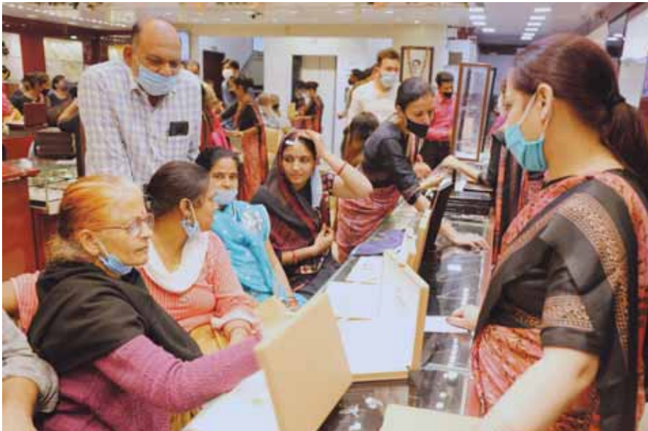
Customers throng at Kashi Jewellers showroom on Sunday.

Honesty, innovation and faith are the key to Kashi