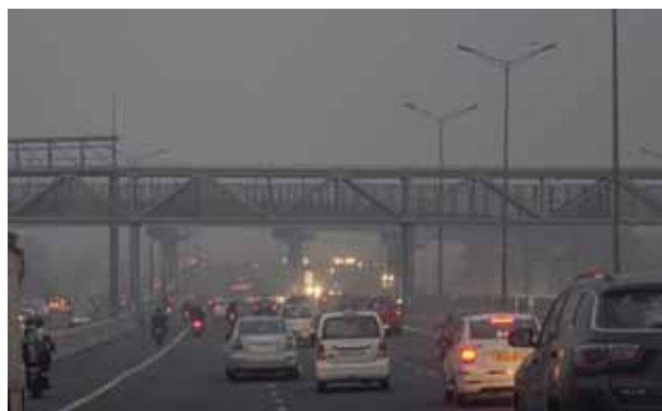
Vehicles ply on a street, amid hazy weather conditions, in New Delhi, on Sunday

AQI was recorded at 426; Situation unlikely to improve, says SAFAR