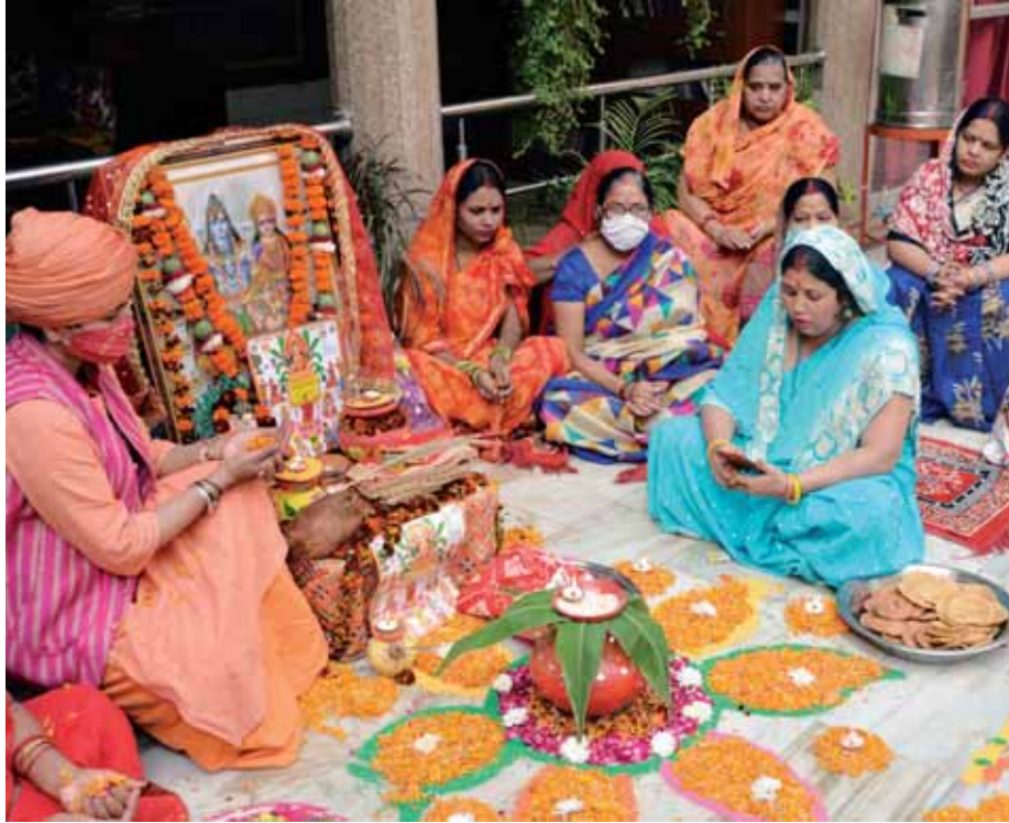
Women performing puja at Mankameshwar temple on the occasion of Ahoi Ashtami on Sunday

riage ceremony of his brother-in-law on November 3. When they returned on November 8, they found the house burgled. The thieves made off with Rs 12,000 in cash and ornaments.