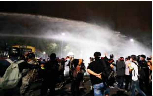
Police use water cannons to disperse pro-democracy protesters during a street march in Bangkok, Thailand on Sunday