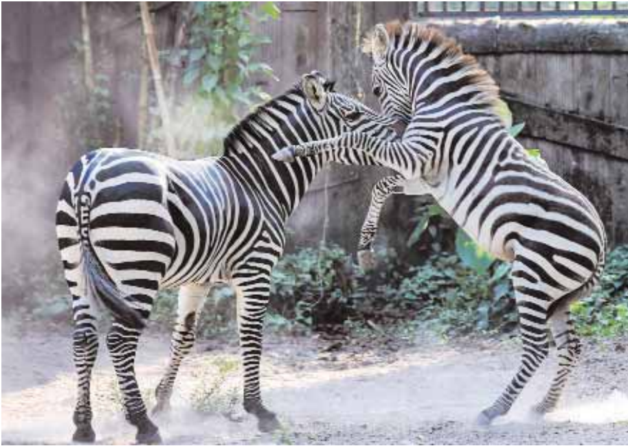
Zebras play at Alipore Zoo in Kolkata on Sunday

The BEC was in the news recently over the sprawling Cheruvalli Estate in Pathanamthitta district which is being acquired by the Government of Kerala for constructing a new international airport.