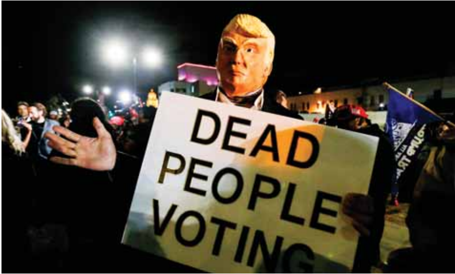
A supporter of President Donald Trump during a rally in Beverly Hills, California