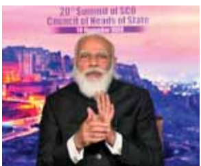
China and Pakistan, who are members of the SCO.

With situation remaining tense at the Line of Actual Control (LAC) in Ladakh, Prime Minister Narendra Modi on Tuesday asserted that all member nations of the Shanghai Cooperation Organisation (SCO) should respect each other's sovereignty and territorial integrity. This message was obviously directed towards