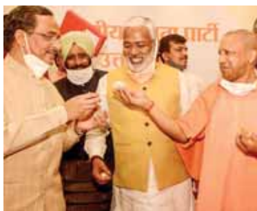
Uttar Pradesh Chief Minister Yogi Adityanath, Deputy CM Dinesh Sharma and UP BJP president Swatantra Dev Singh celebrate party's win, at the party office in Lucknow on Tuesday