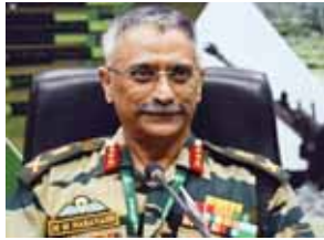
■ NEW DELHI

Having held eight rounds of military level talks to end the stalemate at the Line of Actual Control (LAC) in Ladakh with little progress, Army Chief General M M Naravane said here on Tuesday “we are hopeful that we will be able to reach an agreement which is mutually acceptable and mutually beneficial.” His observations came days after the Corps Commanders of India and China held the eighth round of parleys at Chushul, Ladakh on November 6. Both the sides reaffirmed their resolve to continue the dialogue to ensure peace and tranquility at the LAC. Naravane said the senior military commanders of India and China are “ironing out the modalities” of how to proceed ahead and we are very hopeful that we will be able to reach an agreement which is mutually acceptable and mutually beneficial. He also said there was no shortage of extreme weather