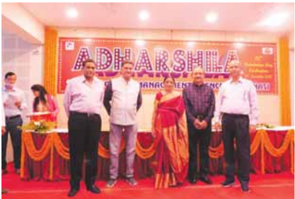
SMS celebrating its Foundation Day in Varanasi on Tuesday