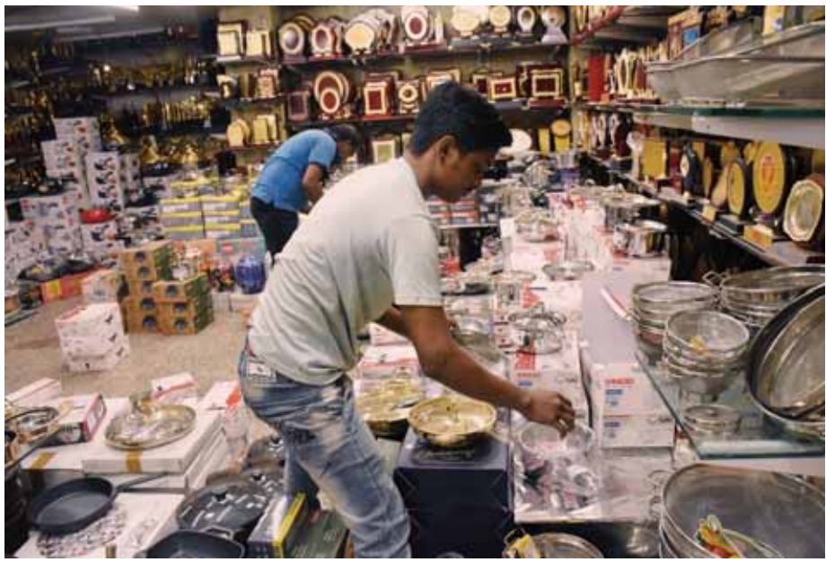
Preparations being made at a shop ahead of Dhanteras, in Nazirabad market on Tuesday

It may be noted that while the air quality deteriorates every year in the month of October because of weather conditions, festive occasions at this time of the year only add to pollution levels and the air quality starts worsening since Karva Chauth and the trend continues till after Diwali and Chhat Puja. On Tuesday, Lucknow recorded an AQI of 344, which was in the 'very poor' category.