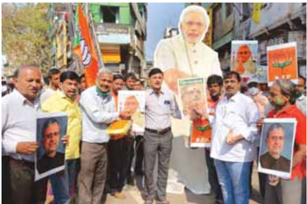
BJP supporters celebrating NDA's victory in Bihar assembly polls in Varanasi on Tuesday