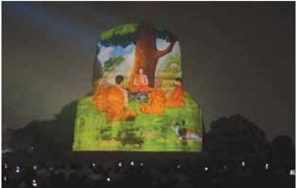
Light & Sound Show being presented at Sarnath in Varanasi on Monday evening.

Long-awaited Light & Sound Show began at Dhammek Stupa, Sarnath just a few hours after its inauguration by the Prime Minister Narendra Modi through video conferencing when its first show was displayed here on Monday evening and it was watched by several dignitaries. This 30-minute show is based on the life of Lord Buddha in which background voice was given by eminent Bollywood actor Amitabh Bachchan. On the occasion, UP Minister of State (Independent Charge) for Tourism Minister Dr Neelkanth Tiwari informed that this show would be screened daily at this famous Buddhist site of Sarnath.