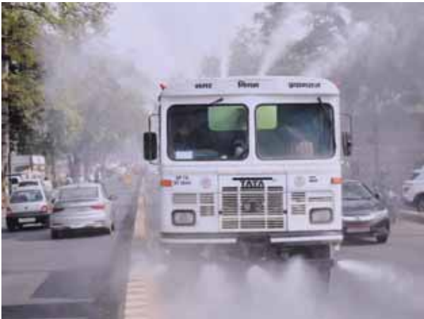
A Nagar Nigam tanker sanitises road in Prayagraj

According to CMO Dr GS Bajpai, the order of reduction of corona infection is in progress. Monday was the first week of July when the number of infected ranged from 50 to 55, which went beyond 500. Now it is a matter of relief, the lack of viral load in the testing of people is also visible in the report. He said strict vigil will