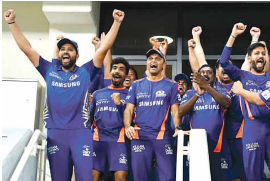
Mumbai Indians captain Rohit Sharma and team celebrate their win over Delhi Capitals during the IPL 13 final held at the Dubai International Cricket Stadium, Dubai, on Tuesday