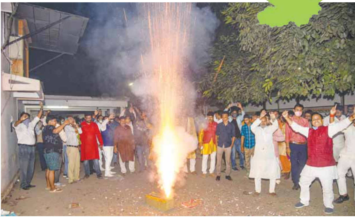
BJP workers celebrate after NDA's victory in the Bihar Assembly elections results, in Patna, on Tuesday