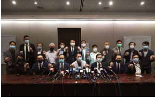
Hong Kong's pro-democracy legislators pose for a photo before a press conference at the Legislative Council in Hong Kong on Wednesday