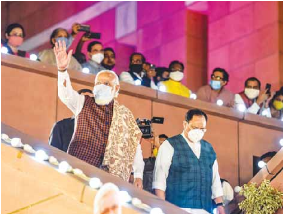
Prime Minister Narendra Modi waves to party workers at BJP HQ, a day after the National Democratic Alliance (NDA) garnered majority in the Bihar Assembly polls, in New Delhi on Wednesday

He also said Bihar has chosen “vikas raaj” over “goonda raaj”, “DBT raaj” over “loot raaj” and LED over lantern.