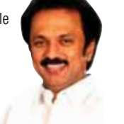
DMK chief —MK Stalin

The remarkable performance of RJD to emerge as the single largest party in Bihar inspires confidence in our democracy.