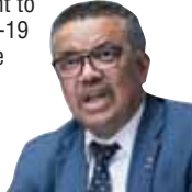
WHO Director-General —Tedros A Ghebreyesus

I called on member States to reiterate their commitment to fair allocation of a COVID-19 vaccine. We mustn't leave any country behind in the response.