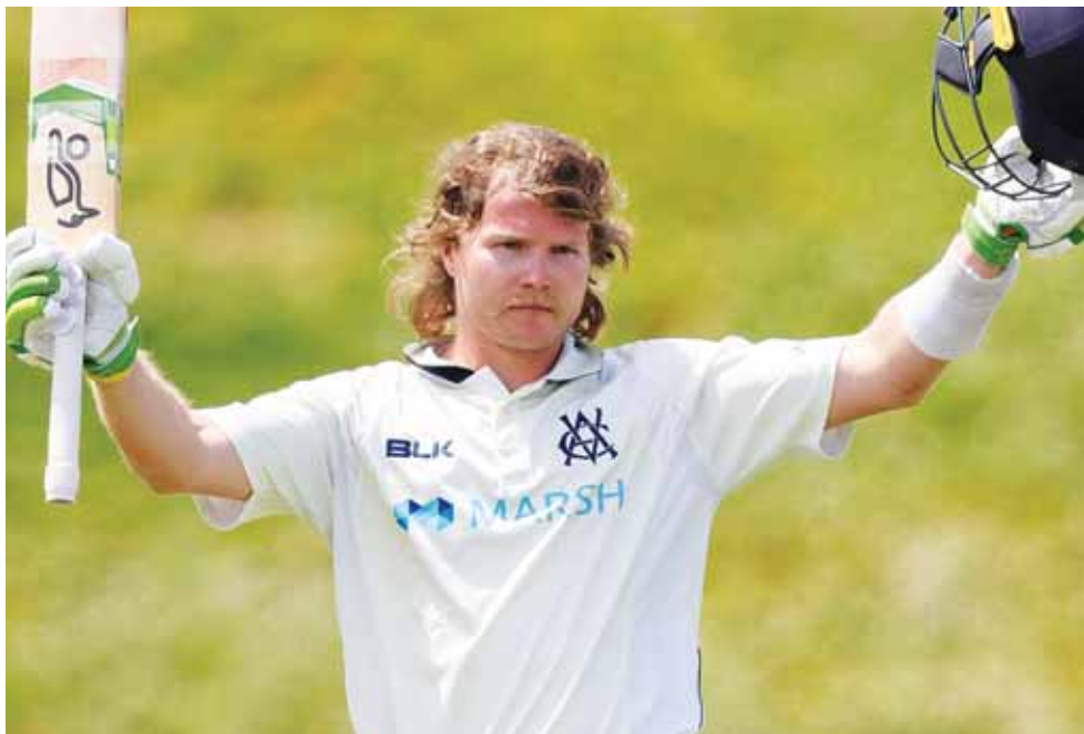
Australian batsman Will Pucovski celebrates after scoring double hundred for his state team Victoria during Sheffield Shield.