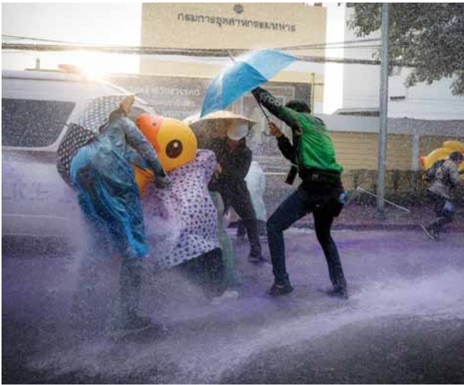
Pro-democracy protesters take cover with inflatable ducks and umbrellas as police fire water cannons during an anti-Govt rally near the Parliament in Bangkok on Tuesday AP

Japanese officials said. If signed, it will be Japan’s first such agreement since the 1960 status of forces agreement with the United States, which set bases for about 50,000 American troops to operate in and around Japan under the Japan-US security pact. Japan is committed to maintain and deepen its 60-year-old alliance with the US as the cornerstone of Japanese diplomacy and security, but has in recent years sought to complement its regional defence by stepping up cooperation with others, especially Australia, amid China’s growing maritime activity that has spread from the East and South China seas and beyond. AP