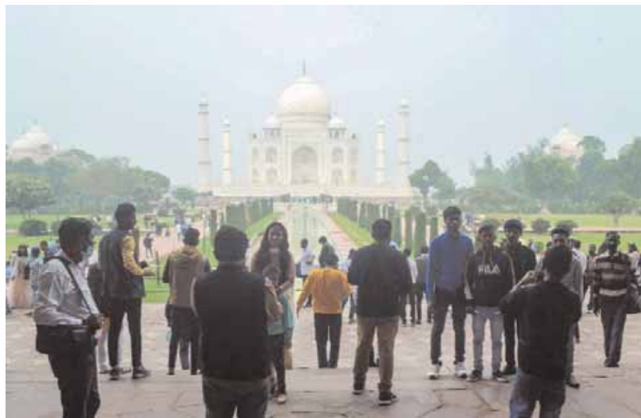
Tourists visit the historic Taj Mahal shrouded in smog in Agra on Tuesday