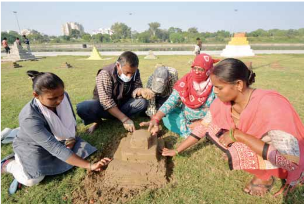
Preparations underway for Chhath Puja at Laxman Mela ground on Tuesday