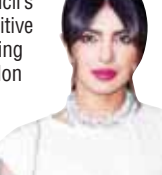
Actor —Priyanka Chopra

I am honoured to be the British Fashion Council's Ambassador for Positive Change while I'm living and working in London over the next year.