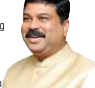
Union Minister —Dharmendra Pradhan

The Open Acreage Licensing Policy is a market-friendly policy which is driving self-reliance in the energy sector.