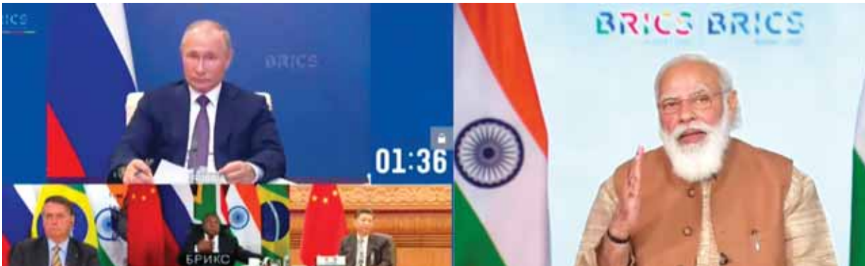
Prime Minister Narendra Modi addresses members during the BRICS summit, via video conferencing, in New Delhi, on Tuesday

During the first meeting at the Shanghai Cooperation Organisation (SCO) on November 10, Modi in a veiled reference to China's expansionist policy said, "India believes that to improve connectivity it is important to