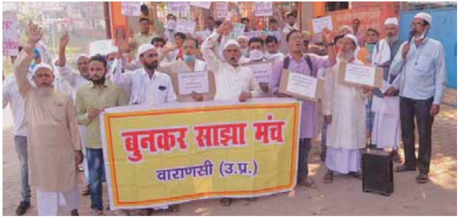
Weavers staging protest at Shastri Ghat in Varanasi on Tuesday

We were in need of additional relief during the lockdown but instead of giving relief, the government made an additional financial burden on them ending the old electricity flat rate on power loom, the agitated weavers said while staging a protest at Shastri Ghat here under the banner of Bunkar Sanjha Manch, (Varanasi) Uttar Pradesh. The state government has introduced a new electricity rate per unit on the powerloom which is injustice to the weavers who are already in acute financial crunch, they said demanding, the government should restore the old flat rate electricity rate in the larger interest of