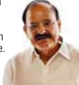
Vice-President —M Venkaiah Naidu

The ancient education system always taught us to live in harmony with nature and respect all beings and non-beings. Our education was complementary to life.