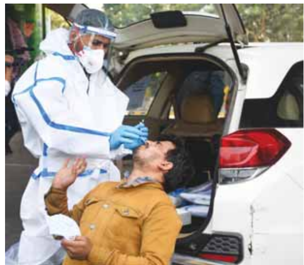
A health worker takes samples from a commuter during a campaign to conduct random Covid-19 rapid antigen-based testing of people coming from the national Capital at Delhi-Noida border on Wednesday