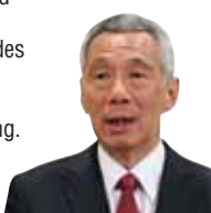
Singaporean PM —Lee Hsien Loong

Few countries would be willing to join a coalition that excludes players like China. They all want to do business with Beijing.