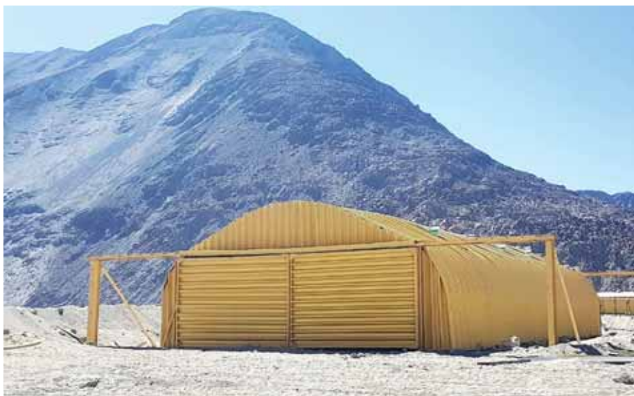
Indian Army sets up upgraded living facilities for troops in Eastern Ladakh

The stand-off sites are located at a height of more than 15,000 feet in most of the places in Eastern Ladakh. Due to paucity of oxygen at such heights, the Army has taken precautions to deploy only acclimatised soldiers well versed in surviving at such