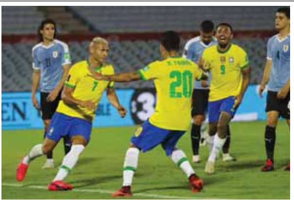
Richarlison celebrates with teammate Roberto Firmino after scoring Brazil's 2nd goal against Uruguay at Centenario stadium in Montevideo

The remaining two spots in the Nations League semi-finals will be decided on Wednesday, with Italy and Belgium currently in pole position.