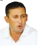
Former India fast bowler —Ajit Agarkar

I think there are a couple of teams: CSK certainly needs a little bit of restructuring ahead of next year's Indian Premier League.