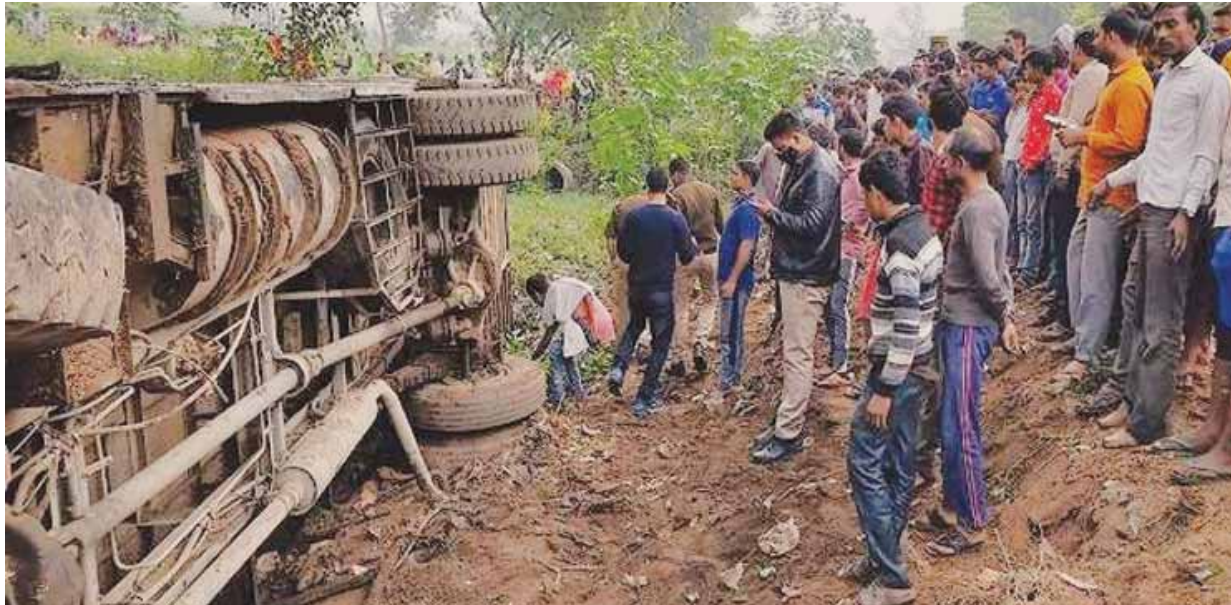
Private bus overturned in a pit in Ghatampur police area on Wednesday morning.