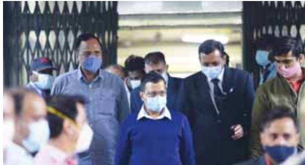
Delhi Chief Minister Arvind Kejriwal during his visit to GTB Hospital to meet Covid-19 patients in New Delhi on Wednesday

Leaders of the Aam Aadmi Party (AAP), BJP Congress and other parties have been invited for the meeting.