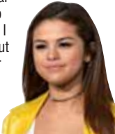
Singer and actor —Selena Gomez

I got so angry that my (mental health) story was twisted into so many different things. Did I go and get help? Yes I did. But I'm not ashamed. I feel better and understand things now.