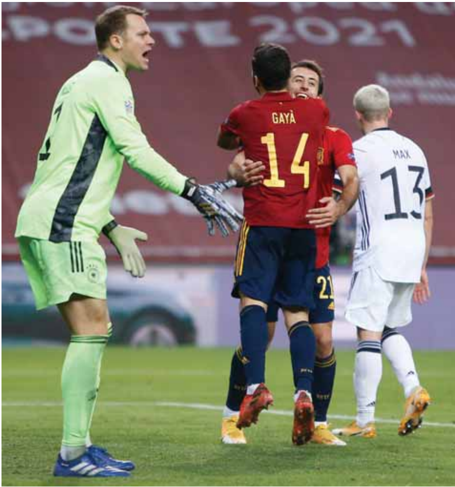
Mikel Oyarzabal celebrates with Spanish teammate Gaya after scoring his side's sixth goal against Germany

Germany's defence was posted missing as Jose Gaya