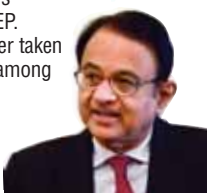
Congress leader —P Chidambaram

There are pros and cons to India joining the RCEP. But the debate has never taken place in Parliament or among the people or involving the Opposition parties.