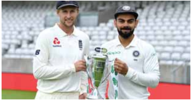
Indian captain Virat Kohli and England's Joe Root pose with trophy

The win also extended Brazil's long reign of dominance over the Celeste, who have not beaten their fierce rivals since 2001.