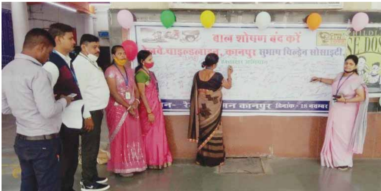
A signature campaign was oraganised by Childline titled" Childline se Dosti" to protest child labour on Wednesday.