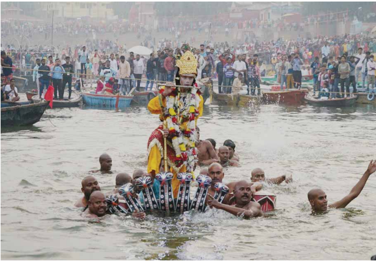
Nag Nathaiya being held at Tulsi Ghat in Varanasi on Wednesday