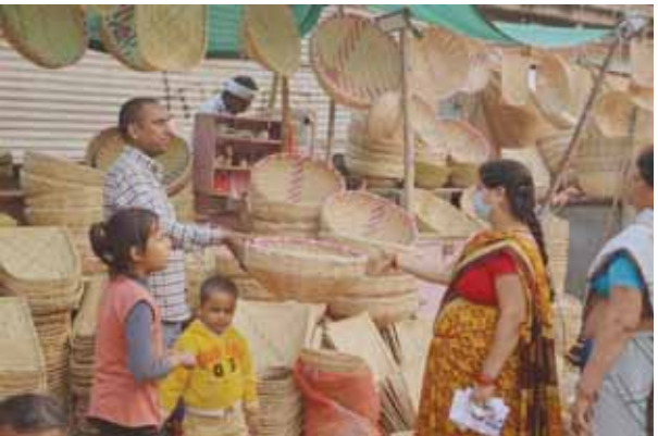
Women purchasing Chhath articles as the four days festival begins in Varanasi on Wednesday

Chhath-related articles were seen being sold on roadsides at various places in almost