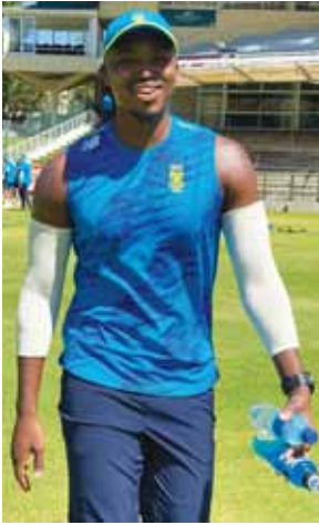
SA pacer Lungi Ngidi

South African players, match officials, administrators