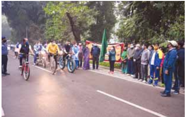
Cycle rally being taken out on Qaumi Ekta Diwas at BLW in Varanasi on Thursday

During the event, all the participants involved in the cycle rally followed the COVID-19 guidelines including wearing masks in the right manner and keeping distance of two yards while pedaling bicycles. They also created awareness by sending mes-