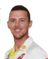
Australian cricketer —Josh Hazlewood

I think bubble life is a lot easier than quarantine. There are a few things you can get out to do and playing cricket as well. That is a huge bonus.