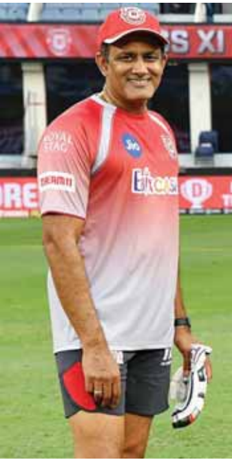
Kings XI Punjab coach Anil Kumble