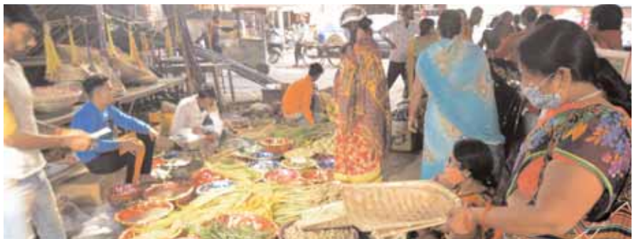
Women making purchases for Chhath Puja in Lucknow on Thursday