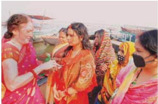
After taking holy bath in river Ganga, women start Kharna on second day of Chhath in Varanasi on Thursday

Heavy rush was seen in the markets to purchase sugarcane, various types of fruits and other articles. As the women need different types of