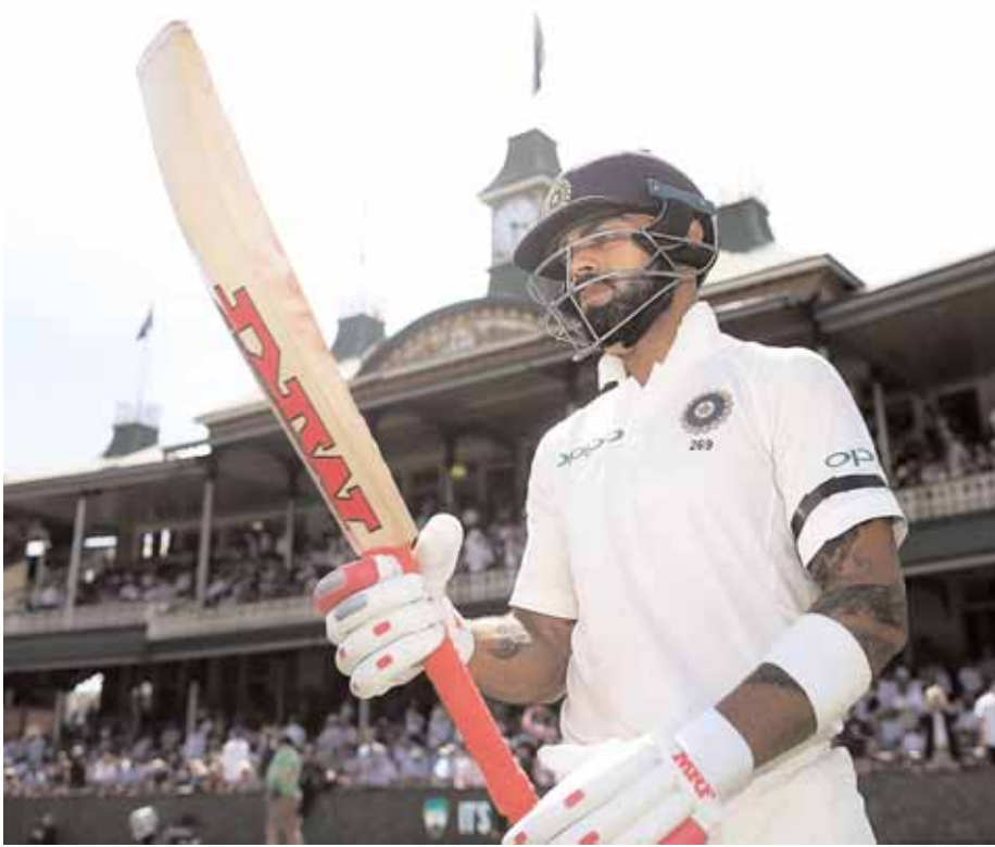
Indian skipper Virat Kohli arrives at crease to bat during 4th Test against Australia at SCG in January 2019

With so many options, Ponting feels India will have to answer more questions than the