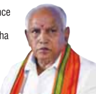
Karnataka Chief Minister —BS Yediyurappa

Marathas are also Hindu followers. There is a difference between development of Marathi and Maratha. Maratha is a community and they are Hindus.