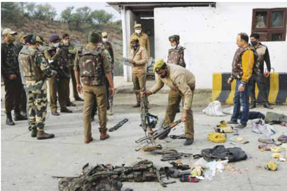
Security personnel inspect the site of encounter at Nagrota Ban toll plaza in Jammu on Thursday

A huge consignment of arms and ammunition, including 11 AK-47 rifles, 29 grenades, 3 kg RDX, mobile phones & radio handsets, medicine and ration supplies were also recovered from the encounter site.