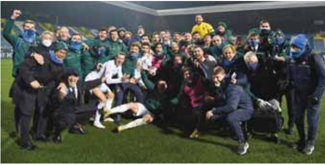
Italian players celebrate after win against Bosnia and Herzegovina