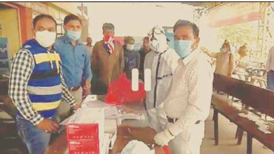
Special COVID-19 testing camp organised at the Jhakarkati Bus Station on Thursday.

Singh inspected the camp set up at Jhakarkati bus sta-