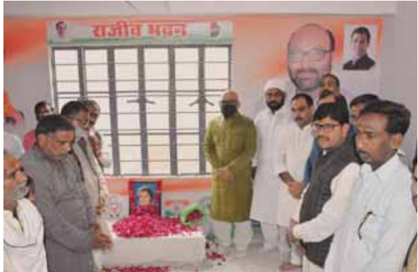
Congress workers celebrating Indira Gandhi Jayanti in Varanasi on Thursday

They also recalled the contribution of the ex-PM Indira