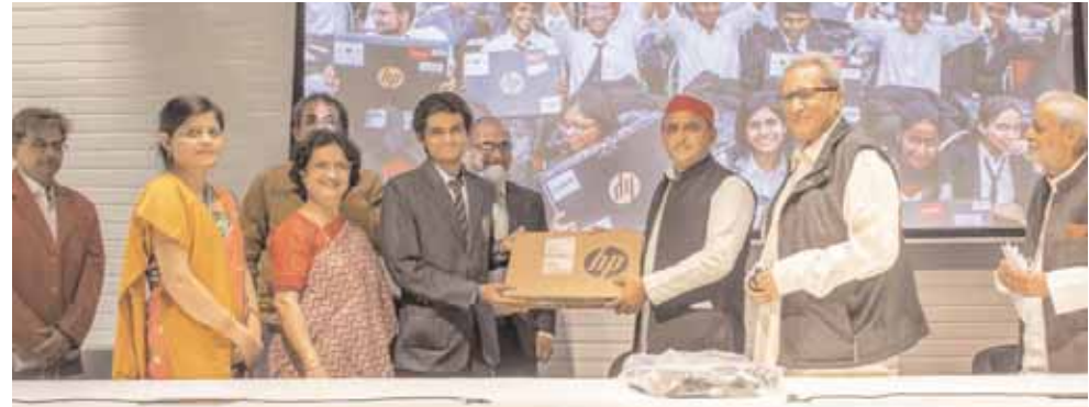
Akhilesh Yadav giving away laptop to meritorious student in Lucknow on Friday