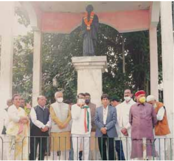
Congressmen paying rich tributes to Indira Gandhi on her birth anniversary on Thursday

He said Indira Gandhi carried forward former Prime Minister Lal Bahadur Shastri's core initiative of making India self-sufficient in food. He said her Green Revolution and White Revolution had made