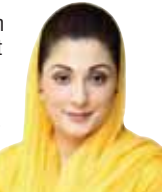
PML-N vice-president —Maryam Nawaz

As long as this fake Government remains in power, the poor cannot run a household and they will not be able to obtain cheap medicine.