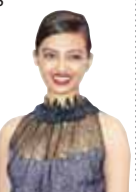
Actor —Radhika Apte

The Indian film industry has lost a legend. I am eternally grateful that I got to work alongside Soumitra sir in Ahalya . He was a true gentleman and a kind soul.