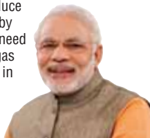
Prime Minister —Narendra Modi

India is trying to reduce its carbon footprint by 30-35 per cent. We need to increase natural gas usage by four times in our need for energy.