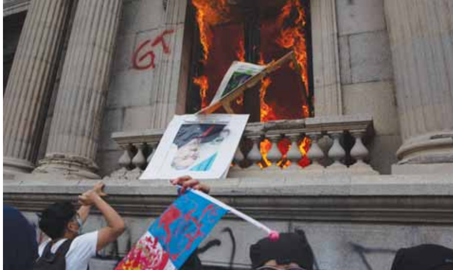
An official photo of former Congress President Eduardo Meyer is thrown out from the Congress building after protesters set a part of the building on fire in Guatemala City on Saturday

Video on social media showed flames shooting out a window in the legislative building. According to media reports, security agents fired tear gas at protestors and there