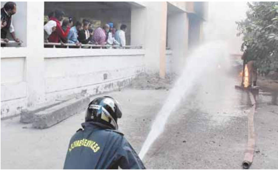
A fire fighter spraying water on burning car at car parking, in Civil Lines in Prayagraj