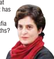
Congress leader —Priyanka Gandhi

What’s the reason that the Yogi Government has failed to take action against the liquor mafia despite so many deaths? Who is responsible?