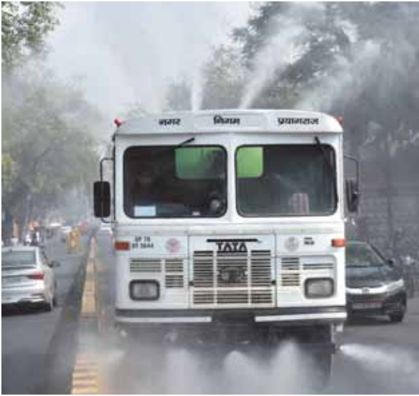
Nagar Nigam tanker sanitising road in Prayagraj

On the other hand, according to the CMO, 25 people who were free of infection on Saturday were discharged from