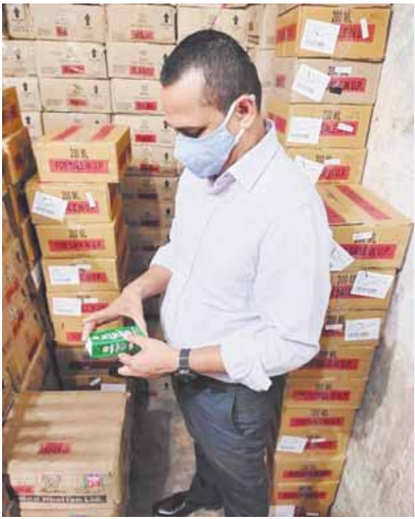
Divisional Commissioner, Raj Shekhar, inspecting a liquor godown at Bilhaur

He later checked the full stock and also minutely checked the holograms for