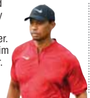
Ace golfer —Tiger Woods