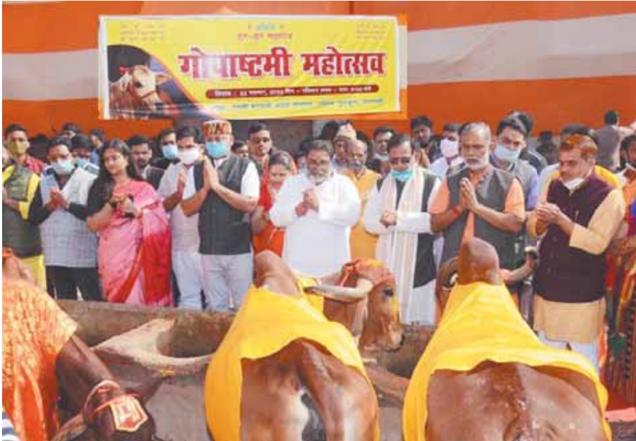
Gopashtami festival being organised at Dharm Sangh in Varanasi on Sunday