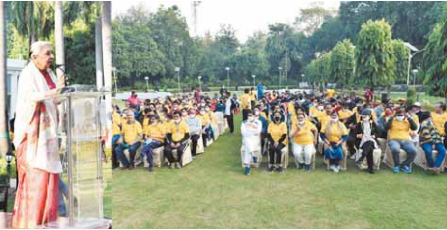
Governor Anandiben Patel addressing participants of centennial walk at Raj Bhawan on Sunday

The governor said various programmes should be organised for the students and they should be taken on educational excursions. "Give them an opportunity to make all the necessary preparations related