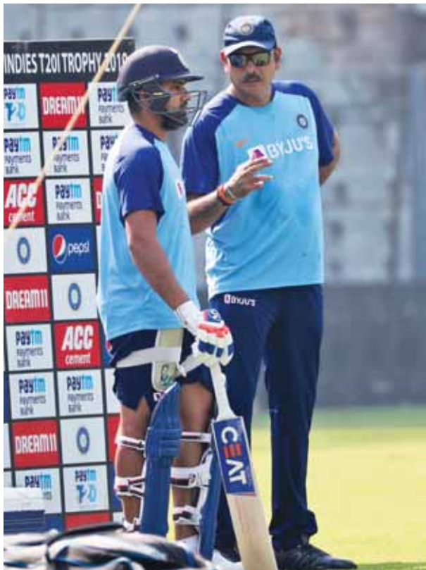
Rohit Sharma chats with Ravi Shastri during India nets session

PTI ■ NEW DELHI He has enjoyed and revelled in his new role as a Test opener but Rohit Sharma is ready to be flexible about his batting position in the eagerly-anticipated Test series