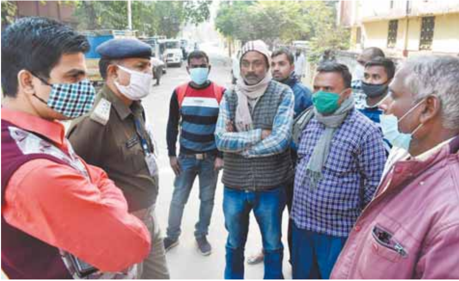
SDM and CO talking to family members of one of the victim who died drinking spurious liquor at SRN Hospital in Prayagraj

Now reports say that they are showing signs of improvement. Consumption of spurious liquor from the registered country liquor shop had caused