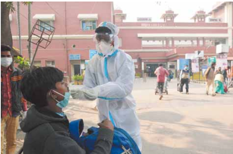
People arriving at Charbagh station being tested by health officials on Monday