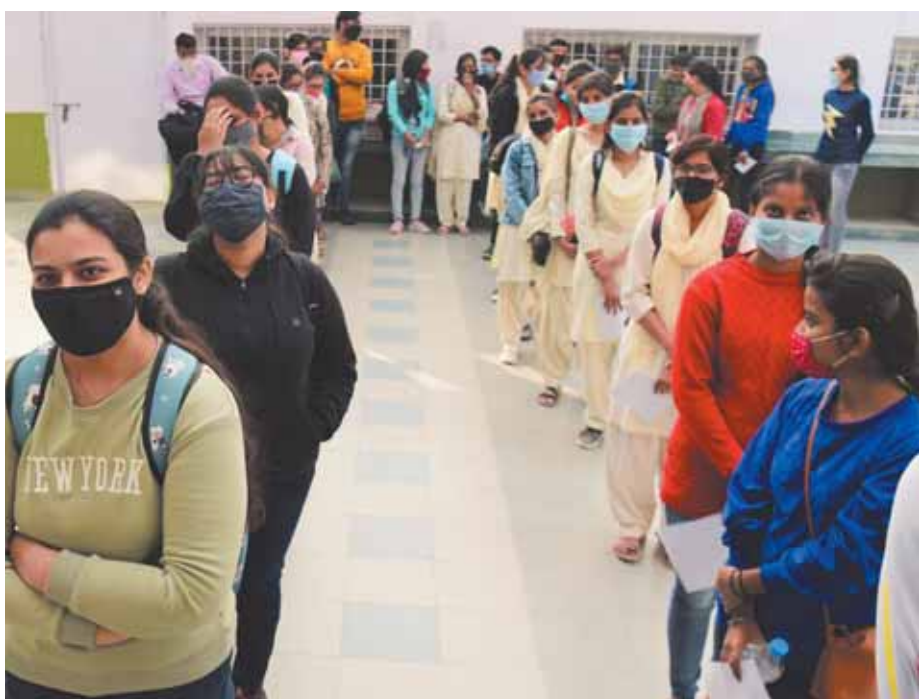
Students stand in queue while going to their classes at National PG College after it reopened on Monday