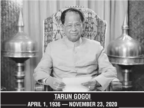
TARUN GOGOI APRIL 1, 1936 — NOVEMBER 23, 2020

His condition deteriorated on November 21, following multi-organ failure and was put