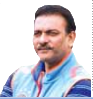
Head coach, Team India —Ravi Shastri

Virat Kohli will be missed. But like I say, in adversity comes opportunity. There are a lot of young guys on the side and it's an opportunity for them.