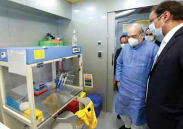
Union Home Minister Amit Shah launches a mobile laboratory that will conduct free RT-PCR tests for Covid-19 here and the results will be available in six to eight hours. SpiceHealth, an initiative of the promoters of SpiceJet, and led by Avani Singh, CEO, SpiceHealth, will be setting up a number of portable testing facilities across the country to make the highly sensitive RT-PCR testing readily accessible

The study also demonstrates the power of frequent testing in shortening the pandemic and saving lives.