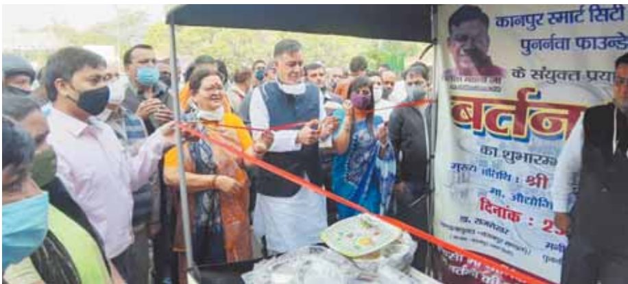
State cabinet minister Satish Mahana and Mayor Pramila Pandey inaugurating the Bartan Bank on Monday.

The citizens of Kanpur will have to be aware about the