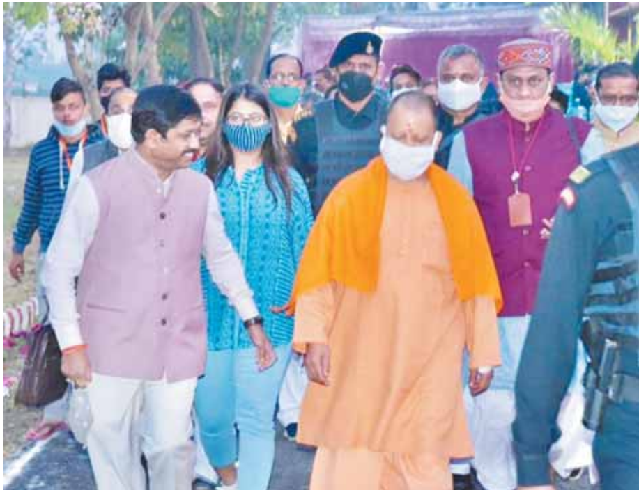
Chief Minister Yogi Adityanath, arrives to attend a programme in Prayagraj

It is believed that the Sangh chief also discussed the problems arising out of Covid. It is also discussed that CM Yogi also informed the Sangh chief about the preparations to bring a law against Love Jihad. In fact, after the growing cases of love jihad in Uttar Pradesh, the Yogi Adityanath Government started preparing to enact a law