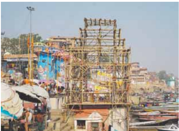
Preparations going on for Dev Deepawali in Varanasi on Monday

Though the schedule of Prime Minister Narendra Modi has yet not confirmed, he is likely to see the grandeur of Dev Deepawali here on the auspicious occasion of Karthik Purnima on November 30. If the PM comes here, it would be the first time when Modi will attend the Dev Deepawali function and visit his parliamentary constituency physically since the nationwide lockdown imposed to prevent the spread of coronavirus pandemic on March 25 last, though he had interacted with the local people on many occasions through video conferencing apart from inaugurating and laying foundation stones of many projects through virtual platforms. The Dev Deepawali programme is also likely to be attended by the Governor Anandiben Patel and Chief Minister Yogi Adityanath but all their visits would depend on the permission of the Election Commission (EC) as on December 1, the voting for two MLC seats from