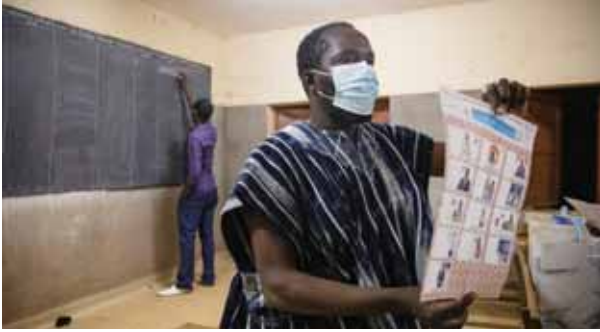
Election officials count the ballots in at a polling station in Ouagadougou, Burkina Faso, for the presidential and legislative elections late on Sunday

While there were no reported incidents of major attacks, threats of violence prevented people from casting ballots in hard-hit parts of the country, in the North, Sahel and East regions. Nearly 3,000 polling stations expected to open yesterday didn’t, preventing up to 350,000 people