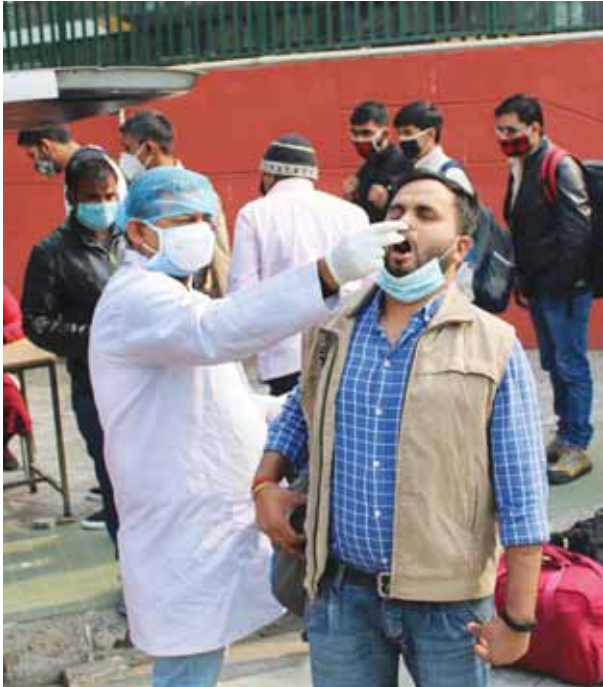
A health worker collects samples from a passenger for the Covid-19 test, as coronavirus cases surge across Delhi, at ISBT Kashmere Gate in New Delhi on Monday