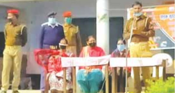
Awareness programme was held at Aryakanya Inter College in Mirzapur under Road Safety Week

that through awareness programmes police department was trying to instill the spirit to fight against any type of violence against women, dignity