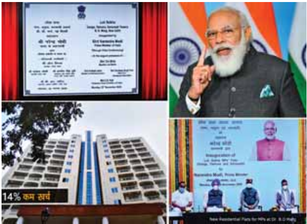
Prime Minister Narendra Modi addresses at the inauguration of multi-storeyed flats for Members of Parliament, through video conferencing, in New Delhi on Monday

Not only the accommodation for MPs, there were several projects in Delhi which had been lying incomplete for many years, and were in limbo. Construction of several buildings began during this Government itself and was completed in the stipulated time, even before the scheduled time. When there was the Government of Atal Bihari