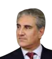
Pakistan Foreign Minister —Shah Mahmood Qureshi

Today, we joined a multilateral Digital Cooperation Organisation as founding member, ushering in a new era of digital diplomacy to shape global digital agenda.