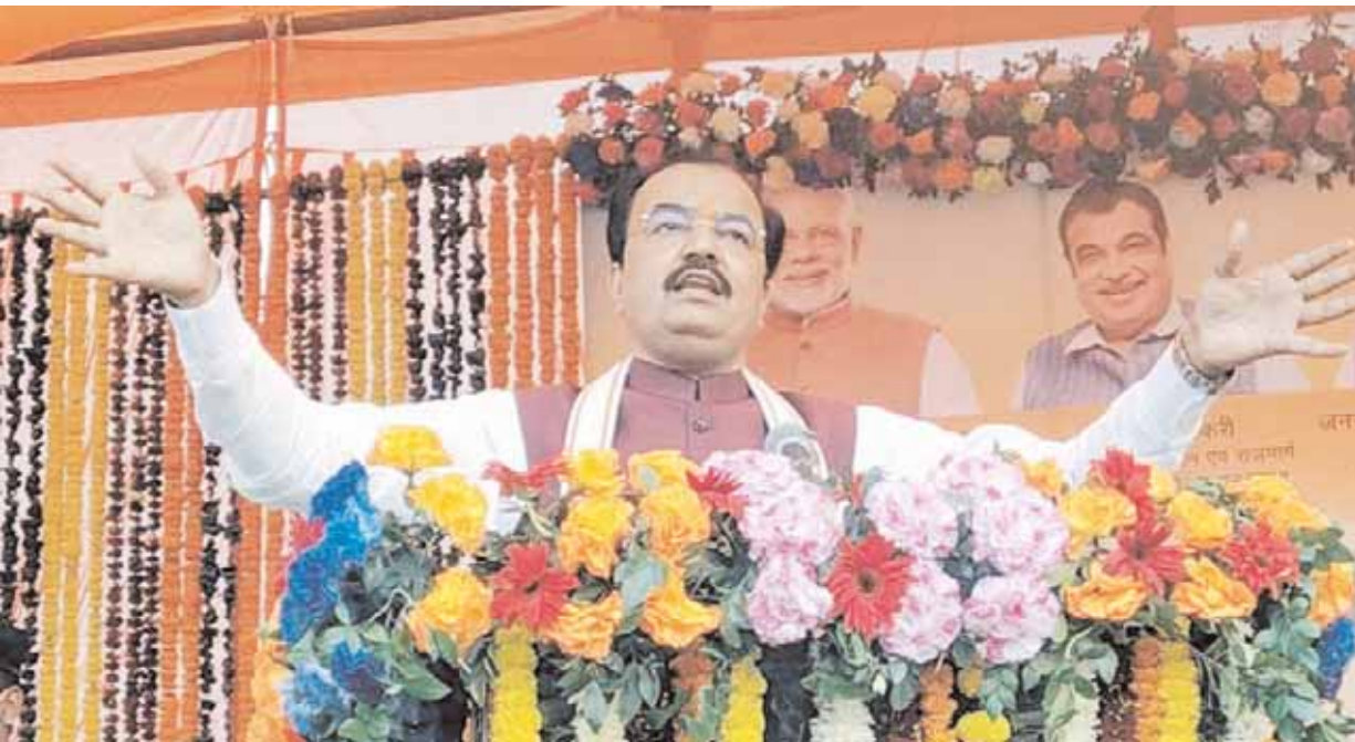
Deputy Chief Minister Keshav Prasad Maurya delivering his speech during foundation laying ceremony of six lane bridge in Prayagraj

together to offer a joint degree programme. The idea of a joint PhD programme was originally proposed in the 53rd IIT Council meeting held on September 27, 2019. The vision behind this is to build a ‘Network of Excellence’ of all IITs rather than each one striving to become a ‘Tower of Excellence’. The IIT Council accepted the proposal to start a Joint Degree Programme. Through this academic collaboration, both the institutes are expecting a significant boost in high quality research and foundation for further academic collaborations