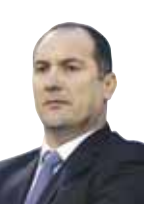
Indian football team coach —Igor Stimac

Diego Maradona’s balance and acceleration were things that every defender was scared of. You could barely knock him down while he was running with the ball.