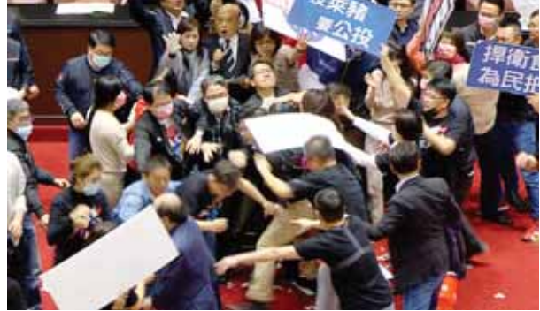
Lawmakers fight during a Parliament session in Taipei, Taiwan on Friday AP

A DPP lawmaker wrestled a KMT lawmaker to the floor