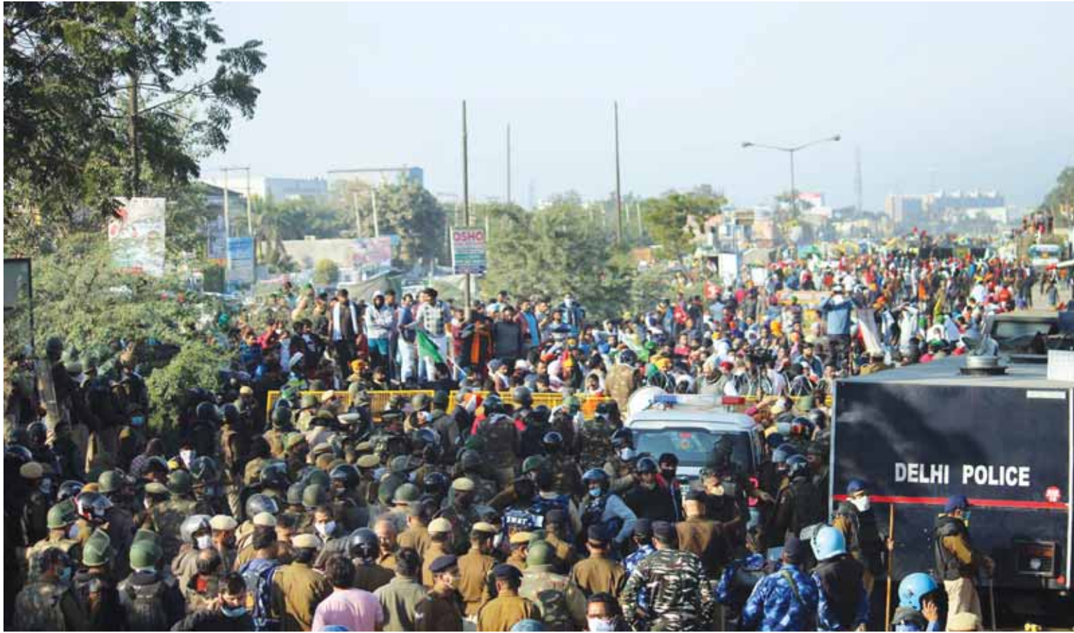
Farmers stand facing security personnel at Singhu border to protest against Centre's new Farm Laws on Friday

Braving tear gas shells and water cannons they camped at the Delhi borders for several