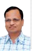
Delhi Home Minister —Satyendar Jain

The demands of the farmers are genuine. Therefore the request of the Delhi Police to convert stadiums into jails is being rejected by the Delhi Government.