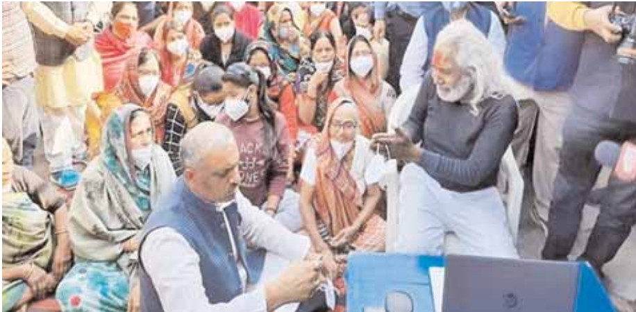
Victims of Coolie Bazar incident talking to former chief minister Akhilesh Yadav through video call on Friday.