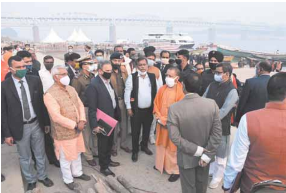
CM Yogi Adityanath inspecting preparations for proposed visit of PM in Varanasi on Friday