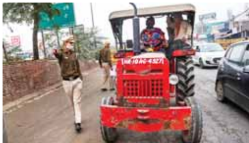
Police personnel check vehicles at Singhu border ahead of the scheduled farmers' protest march to Delhi on Nov 26-27 against the Centre's new farm laws in New Delhi on Wednesday

The scuffle between the farmers and the police broke out at the Shambhu border near Ambala city when the farmers broke the blockades