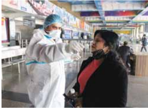
A health worker collects swab samples of a passenger at New Delhi railway station on Wednesday

The MHA's new directions, titled as 'Guidelines for Surveillance, Containment and