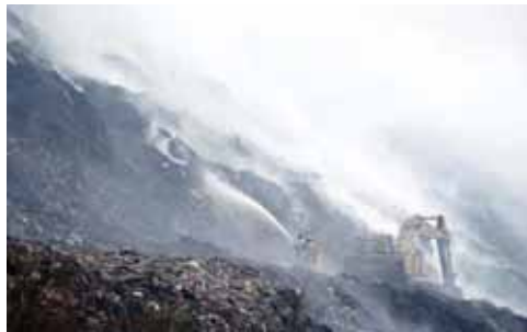
Firefighters attempt to douse a blaze at the Ghazipur landfill site in New Delhi on Wednesday

"The AQI is forecasted to improve towards 'very poor' category by tomorrow and likely stay in the lower end of Very Poor on November 27 and 28," SAFAR said.