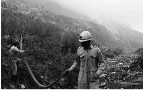
Smoke billows from the Gazipur landfill site after a fire in New Delhi on Wednesday