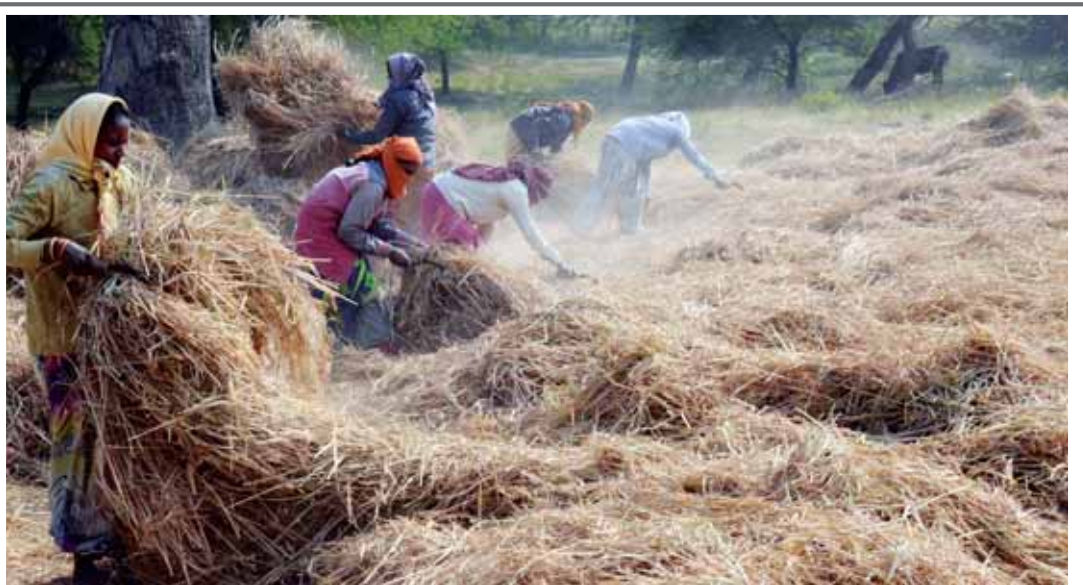
Village women involved in threshing the paddy to separate hay and paddy in Ghughwa village near the Chhattisgarh capital Raipur on Wednesday.

The region has witnessed several killings of villagers and widespread damage to houses and crops by rogue elephants. Between June and October, 15 elephants died in separate districts due to various reasons.