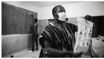
Election officials count the ballots in at a polling station in Ouagadougou, Burkina Faso, for the presidential and legislative elections late on Sunday

While the vote was held, no reported incidents of major attacks, threats of violence prevented people from casting ballots in hard-hit parts of the country, in the North, Sahel and East regions. Nearly 3,000 people have been killed in the past year, according to a report from CODEL, a local