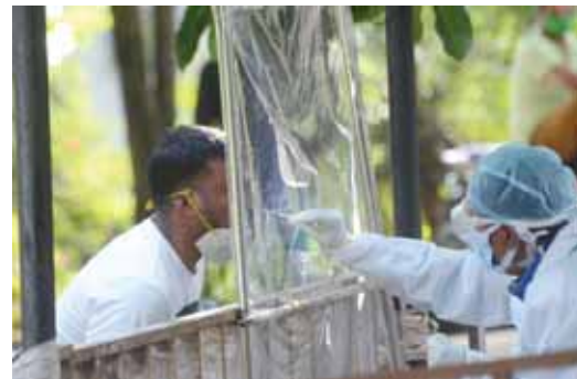
A medic collects swab samples from a person for Covid-19 test in Ranchi on Monday

While Khunti and Pakur did not report even a single