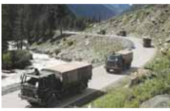
Indian security establishment.

These developments come at a time when the two sides are preparing for the ninth round of Corps Commander-level talks soon. While both the commanders reiterated their commitment to continue talks, China's aggressive infrastructure push has alarmed the