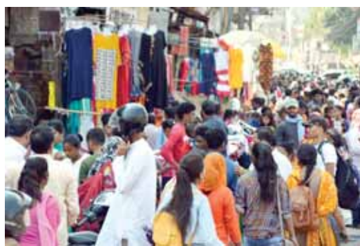
People flock markets amid coronavirus in Ranchi on Monday

There should be a number cap on social gatherings and unnecessary moving should be stopped. Outside goods need to be washed, cleaned and then used. Don't eat raw fruits. The Government can only alert people, it can enforce masks too. Government can challenge people with the help of CCTV cameras just like they do while penalising traffic violators. Also, 60 plus people should not move out and marriages should be done with minimum people maintaining social distancing. I am not