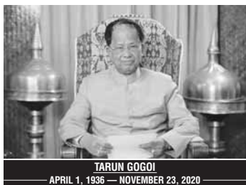
TARUN GOGOI APRIL 1, 1936 — NOVEMBER 23, 2020

His condition deteriorated on November 21, following multi-organ failure and was put