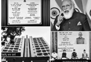
Prime Minister Narendra Modi addresses at the inauguration of multi-storied flats for Members of Parliament, through video conferencing, in New Delhi on Monday.

Not only the accommodation for MPs, there were several projects in Delhi which had been lying incomplete for many years, and were in limbo. The construction of several buildings began during this Government itself and was completed in the stipulated time, even before the scheduled time. When there was the Government of Atal Bihari