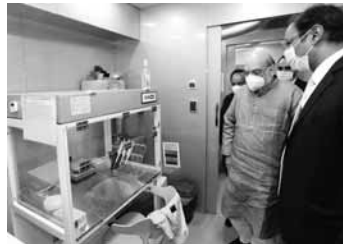
Union Home Minister Amit Shah launches a mobile laboratory that will conduct free RT-PCR tests for Covid-19 here and the results will be available in six to eight hours. SpicHealth, an initiative of the promoters of SpicLab, and led by Anil Singh, CEO, SpicHealth, will be setting up a number of portable testing facilities across the country to make the highly sensitive RT-PCR testing readily accessible.

The study also demonstrated the power of frequent testing in shortening the pandemic and saving lives.