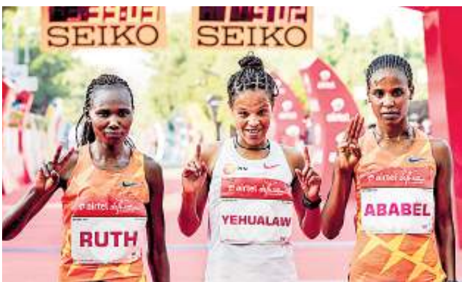
Womens elite category Gold Medalist Ethiopian Yalemzerf Yehualaw (C) flanked by Silver Medalist Kenyan Ruth Chepngetich (L) and Bronze Medalist Ethiopian Ababel Yeshaneh