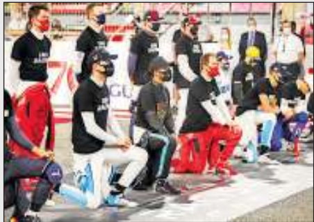
Mercedes driver Lewis Hamilton, centre, and Ferrari driver Sebastian Vettel, right, take the knee in support of the Black Lives Matter campaign and End Racism Recognition event ahead of the Bahrain F1 Grand Prix