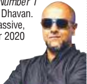
Musician —Vishal Dadlani

I honestly don't believe anyone could pull off a Coolie Number 1 redux other than Varun Dhavan. This is gonna be the massive, commercial blockbuster 2020 has been waiting for.