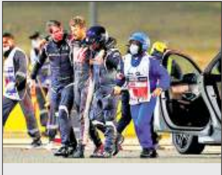
Haas driver Romain Grosjean is helped by medical staff after he crashed his car during the F1 race in Bahrain International Circuit in Sakhir on Sunday