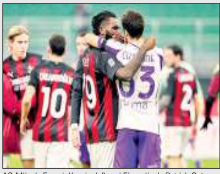
AC Milan's Franck Kessie, left and Fiorentina's Patrick Cutrone embrace at the end of the Serie A match at the San Siro