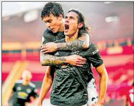
Manchester United's Edinson Cavani celebrates with Victor Lindelof after scoring Utd's second goal against Southampton at the St Mary's stadium on Sunday