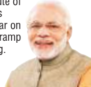
Prime Minister —Narendra Modi

Had a good interaction with the team at Serum Institute of India. They shared details about their progress so far on how they plan to further ramp up vaccine manufacturing.