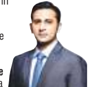
CEO, Serum Institute —Adar Poonawalla

Vaccine will be distributed initially in India, then we will look at the COVAX countries which are mainly in Africa.