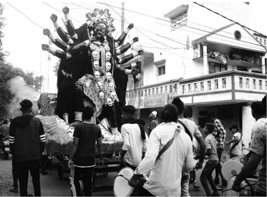
Devotees carry an idol of Goddess Kali for installation at a puja pandal on the first day of the beginning of the Navratri festival in Bhopal on Saturday

If the victims did not get justice in this case and action was not taken against other officials, then the Congress party would stage a large-scale movement, responsible governance and administration.