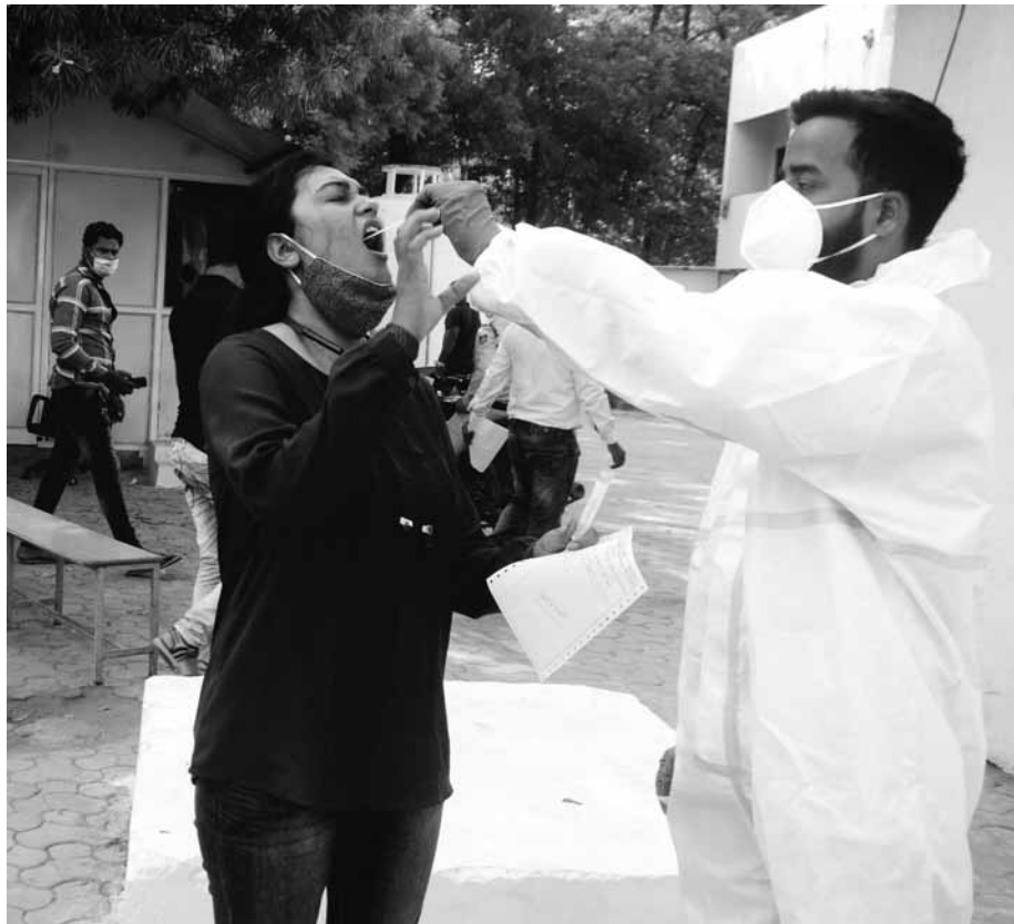
A health official collects a swab sample for COVID-19 test at a fever clinic at Government JP hospital in Bhopal on Saturday. India has the second highest total of confirmed COVID-19 cases in the world

Based on the complaint and after the preliminary investigation, the police registered a case under section 354 IPC and have started search for the accused.