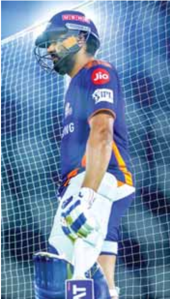
Rohit Sharma prepares to bat at nets @mipaltan

Rohit played second fiddle to de Kock in MI's win against KKR, with the South African hitting