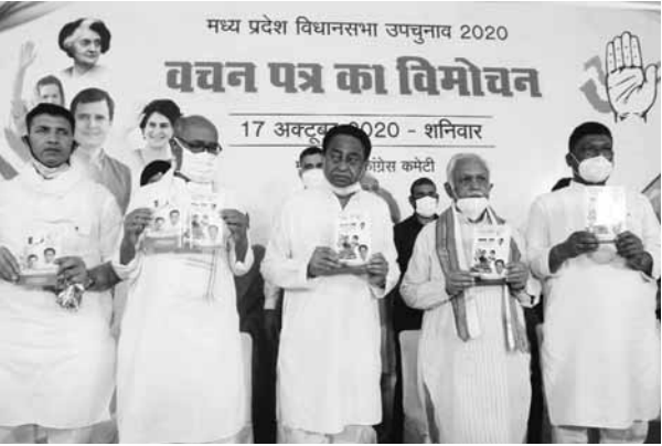
Madhya Pradesh State Congress President Kamal Nath, along with Congress Rajya Sabha MP Dignvijay Singh, releases party's manifesto 'Vachan Patra' for upcoming bypolls in the State, at his residence in Bhopal on Saturday