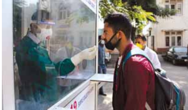
A health worker collects a nasal swab sample to test for Covid-19 at a Government hospital in Jammu on Saturday

The PMO said two pan-India studies on the Genome of SARS-CoV-2 (Covid-19 virus) in India conducted by ICMR and Department of