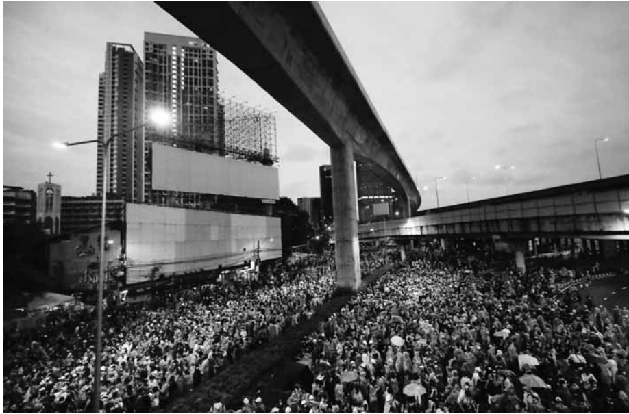
Pro-democracy protesters gather during a protest in Bangkok on Saturday

Her popularity soared earlier this year after she led a successful effort to stamp out the coronavirus. There is currently no community spread of the virus in the nation of 5 million and people are no longer required to wear masks or social distance.