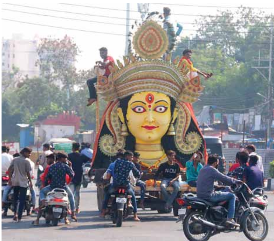
Devotees carry an idol of Goddess Durga for installation at a puja pandal on the first day of the beginning of the Navratri festival in Bhopal on Saturday

This means if anything happens, they would be behind bars.