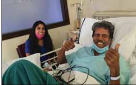
India's first World Cup-winning captain Kapil Dev is well on road to recovery after a successful emergency coronary angioplasty, and this is evident from a photo in which the legendary all-rounder is seen flashing a double thumbs up sign from his hospital bed