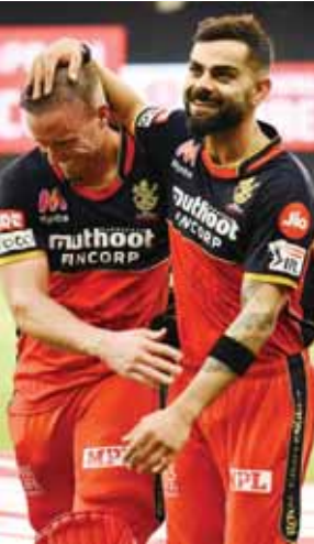
Virat Kohli & Ab de Villiers

They run into a RCB squad which has grown in confidence as the tournament has progressed. Virat Kohli and his men are placed third on the points table with 14 points, the same as