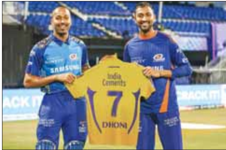
Pandya brothers Hardik and Krunal pose with CSK skipper MS Dhoni's jersey at the end of IPL match between Mumbai Indians and Chennai Super Kings