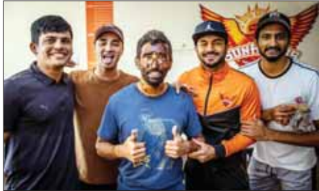
Wriddhiman Saha poses for photo with his Sunrisers Hyderabad teammates Priyam Garg, Abhishek Sharma, Manish Pandey and Khaleel Ahmed after his birthday celebrations