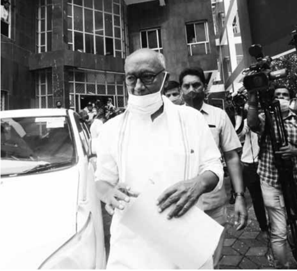
Senior Congress leader and Rajya Sabha MP Digvijay Singh comes out from Election Commission office after registering a complaint against BJP leaders using derogatory remarks during the ongoing election campaign, in Bhopal on Saturday

Accused conducted recce for days to plan robbery and have planned to sell car and repay loan. After the crime the car was sold which was recovered from buyer.