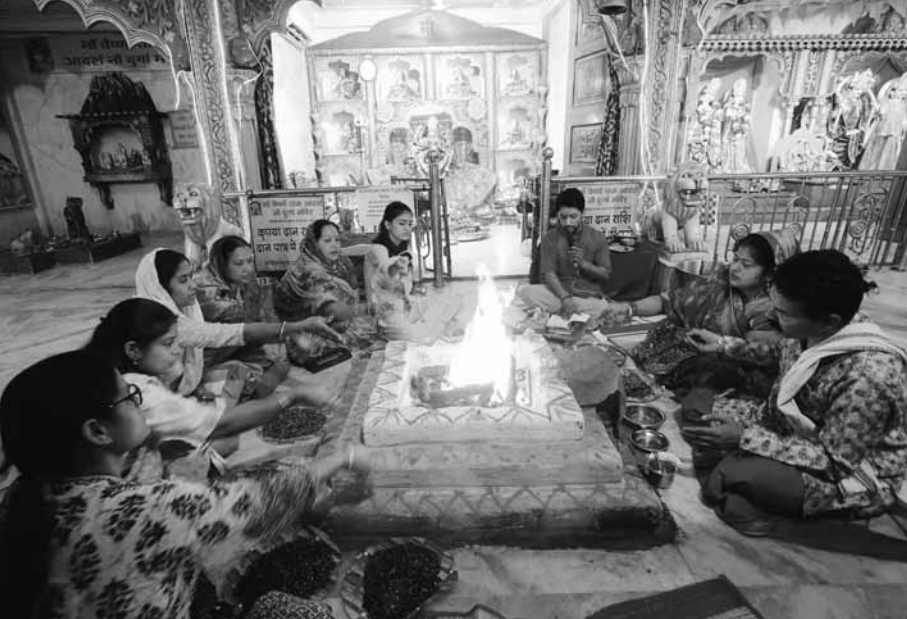
Devotees perform Yagna on Maha Ashtami in a temple during Navratri festival in Bhopal on Saturday

However, the art was by and large a sacred task to be performed with a reasonable degree of ritual purity and humility by the master craftsmen. Generally, Tanjavoor painting was generally made on a canvas, pasted over a plank of wood (jackfruit or teak) with Arabic gum. In the past, artists used natural colours like vegetable and mineral dyes, whereas the present day artists use chemical paints.