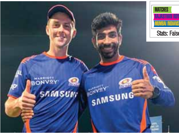
Trent Boult & Jasprit Bumrah pose for photo after win against CSK

But Rohit's absence was hardly felt on Friday as the young Ishan Kishan (261 runs) launched into CSK bowlers with gusto.