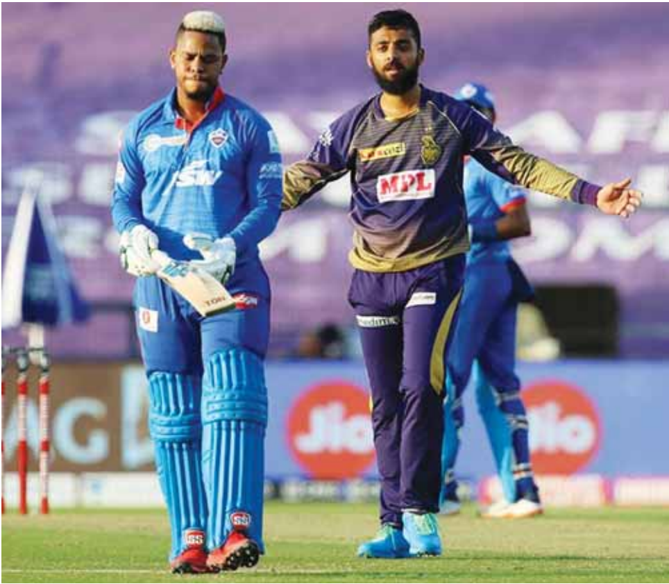
Varun Chakravarthy reacts after he dismiss Delhi Capitals Shimron Hetmyer during run chase on Saturday

The spinner opened his account after Pant holed out at deep square leg and in his next over he got two in two, dismissing Shimron Hetmyer (10) and Iyer off consecutive balls.